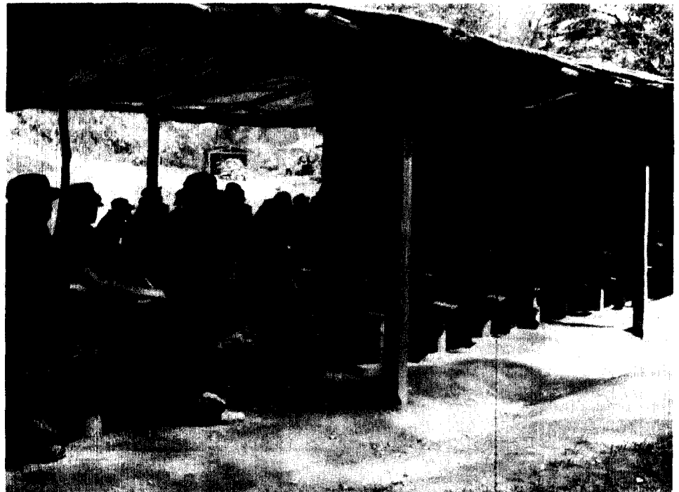
Figure 3.2: Resistance Members Attending Human Rights Training

In January 1989, AID awarded a grant to the Resistance to provide human rights training to Resistance members through April 1989. AID obligated about $178,000 in second-phase funds for this grant. AID subsequently extended the grant through March 1990 and obligated $170,000 in third-phase funds for the extension. The Resistance hired civilians and some of its members to provide instruction on the Resistance military code of conduct and system of military justice. According to the Resistance official directing this training program, about 4,000 Resistance members in Honduras had been trained as of April 1989.