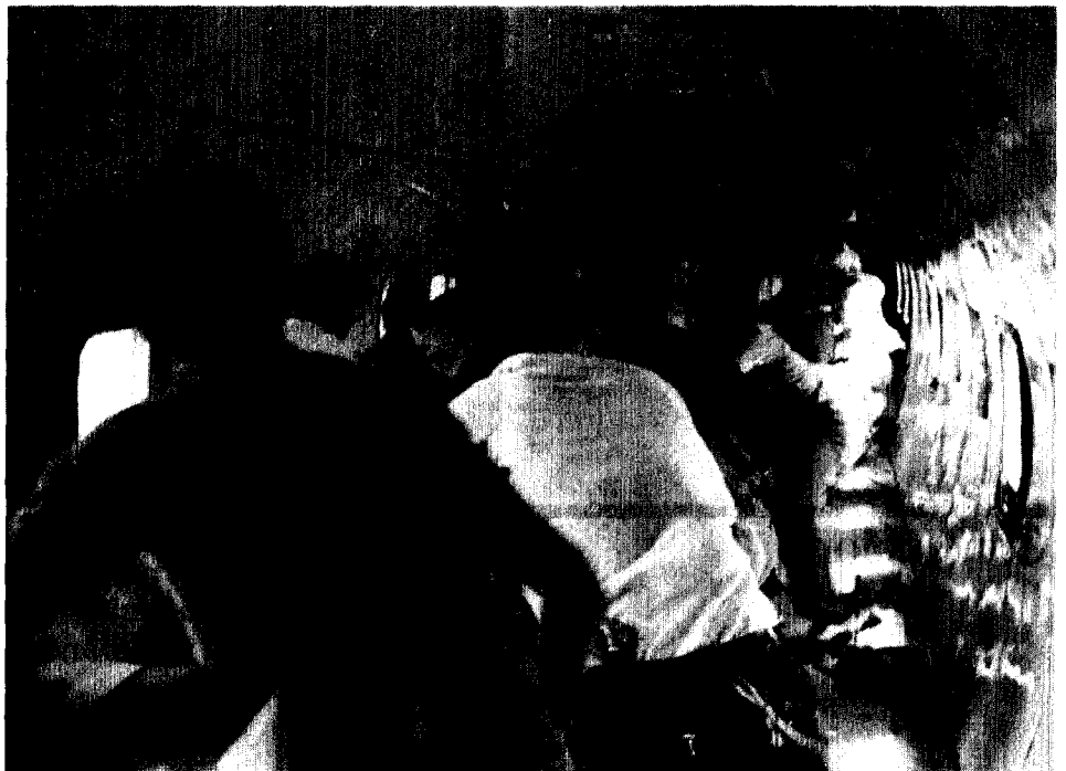
Figure 3.3: Air Cargo Handlers Preparing for an Airdrop

The DC-6 crashed into the side of a mountain on February 25, 1989, and all 10 persons aboard were killed. The exact cause of the crash could not be determined, but AID officials believe that the plane ran out of fuel. To compensate for the loss, AID increased the use of the helicopters to deliver supplies previously air-dropped. Local trucking firms delivered supplies to central Honduras where the Resistance loaded the helicopters with supplies to be transported to eastern Honduras. According to AID and Air Logistics officials, this method worked well but placed significant demands on the helicopters and the pilots. To meet the increased work load, the helicopter company hired a third pilot in June 1989. In July 1989, AID contracted with another air cargo company to provide fixed wing aircraft to resume the airdrops.