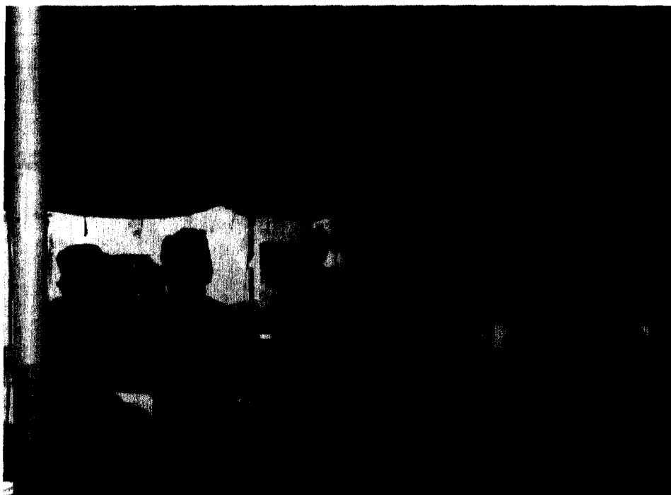
Figure 3.1: Resistance Members Attending Computer Training

Resistance members also received human rights training during the second phase. In December 1988, AID awarded a grant to the Nicaraguan Association for Human Rights to provide training through May 1989 to about 6,000 Resistance members regarding treatment of civilians and other armed forces personnel. The Association has trained, monitored, investigated, and reported on the human rights record of the Resistance since October 1986. Prior to the AID grant, the organization operated with funds from a State Department grant.