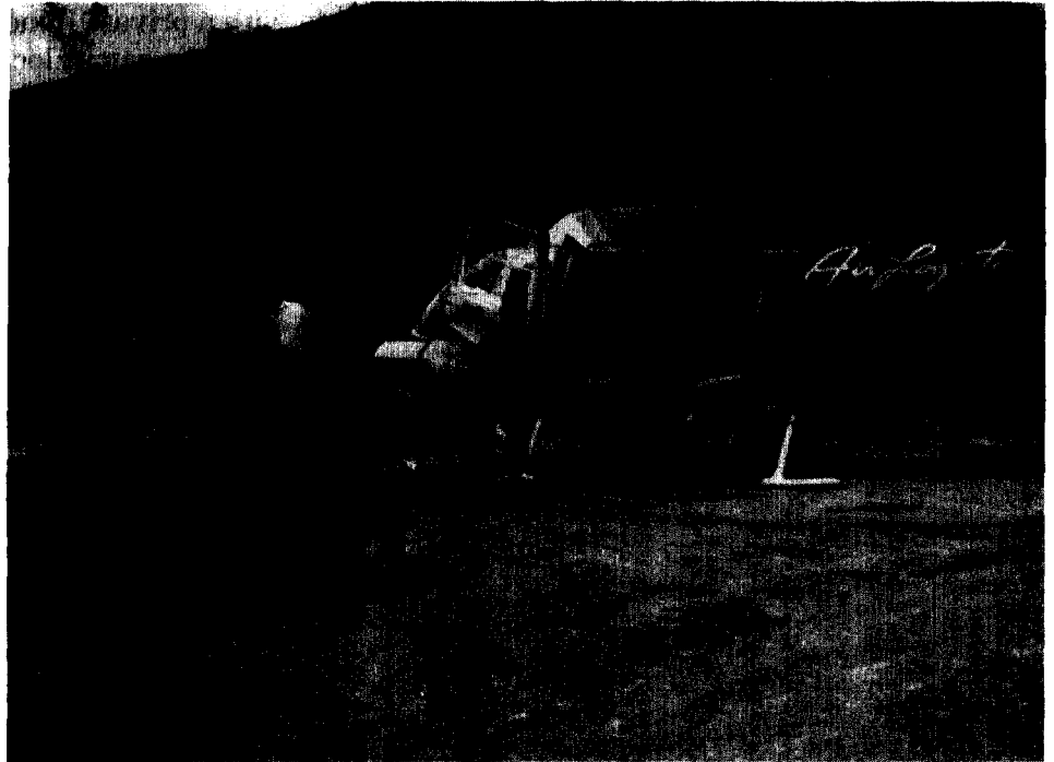
Figure 3.4: Resistance Members Loading an AID Contractor's Helicopter