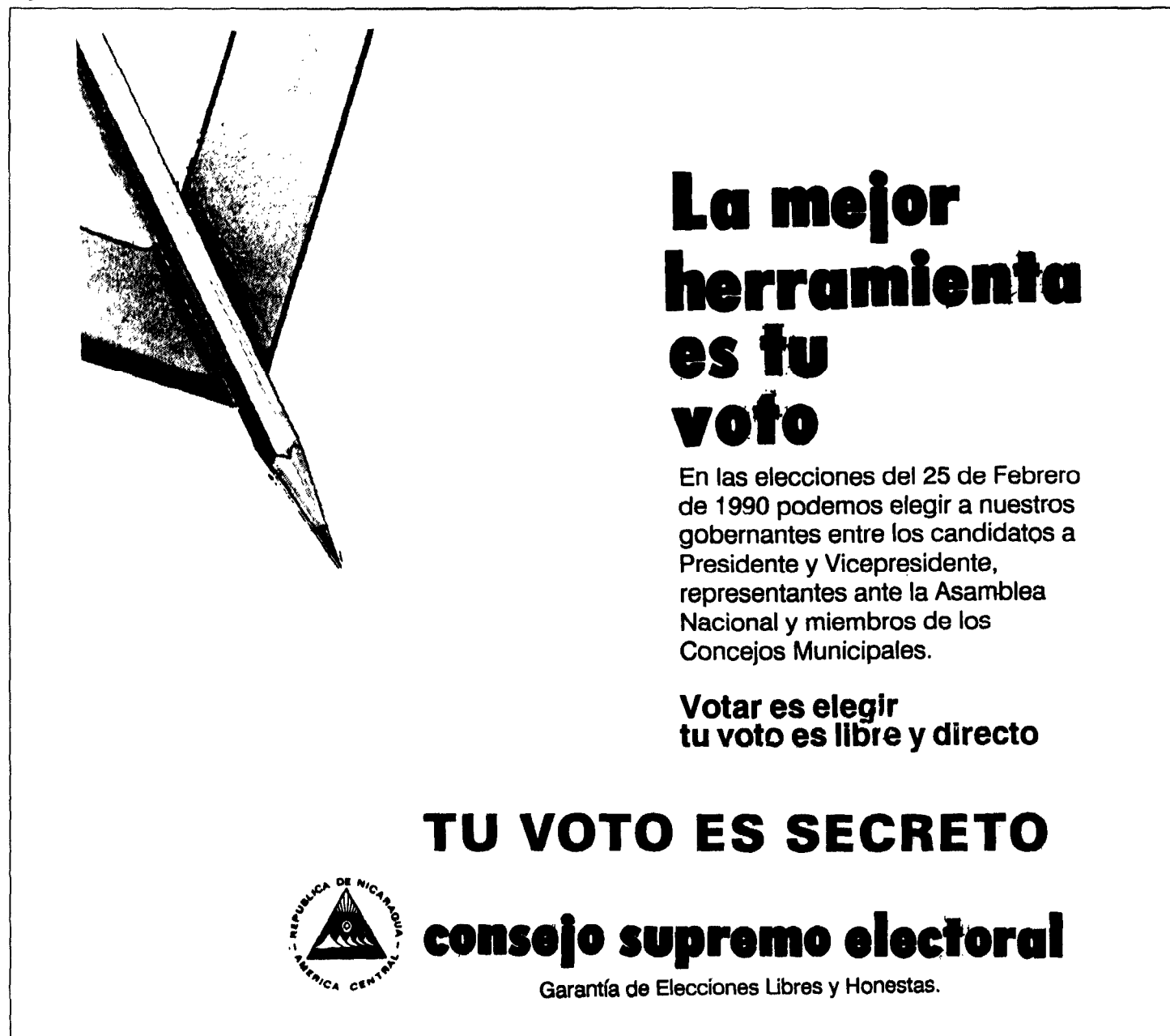
Figure 3.1: Supreme Electoral Council Advertisement Promoting Voter Participation a

a Translated, the advertisement reads, "The best tool is your vote. In the elections of February 1990, we can elect our leaders among the candidates for President and Vice-President, Representatives to the National Assembly and members of the Municipal Councils. To vote is to choose. Your vote is free and direct. Your vote is secret. Supreme Electoral Council. Guarantor of free and honest elections."