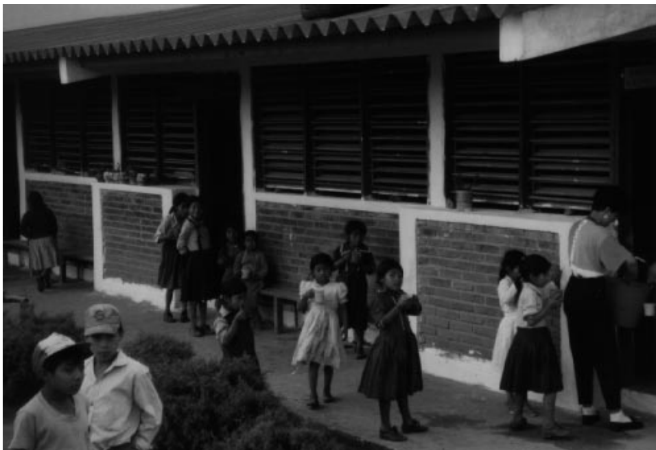
Figure II.1: School Feeding Project in Honduras

Maternal and child health projects generally target children and pregnant and lactating women because of their nutritional vulnerability (see fig. II.2). However, rather than having nutritional goals, projects in all the countries we visited used food as an incentive for mothers to bring children to health centers for inoculations and preventive care. In some projects, nutritional problems were not criteria for participation. For example, in Indonesia, according to PVO and local officials, PVOs have established projects where the government of Indonesia had not provided adequate health coverage. The community health centers used food as an incentive for women to attend classes in nutrition and family planning. According to project officials, although the women served were poor, they were not screened for nutritional status and were not necessarily the poorest. Maternal and child health projects sponsored by PVOs in Honduras and Ghana provided food to poor mothers. The Honduran project provided food to persons who were not eligible under the project criteria, according to a recent evaluation and local project officials. PVO officials told us the project in Ghana may not have served the poorest mothers because they lacked the status to join the informal socializing of mothers who came to the centers.