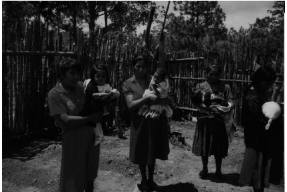
Figure II.2: Maternal and Child Health Direct Feeding Project in Honduras

In commenting on a draft of this report, AID said it recognizes, as the PVOS do, that it is not always possible to reach the most vulnerable groups in a society. It also stated that