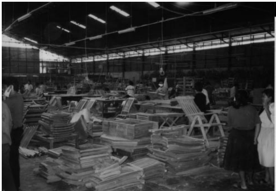
Figure I.2: Furniture Cooperative in Indonesia Supported by Title II Monetized Funds