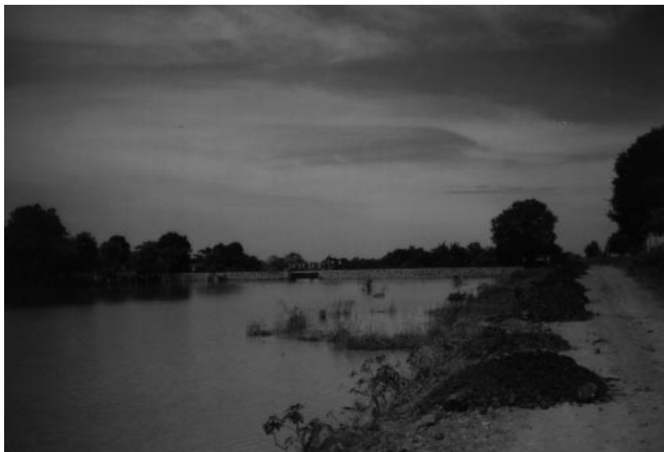
Figure II.5: Dam Built by Food-for-Work Project in Indonesia

In Honduras, a community project coordinator told us that besides constructing a sewage drainage system, the community, with the PVO's help, had resolved other problems with the municipality, such as land titling, electricity, and water hook-up. The coordinator did add, however, that he had encountered problems keeping "trained" workers (i.e., bricklayers). The trained participants were able to get jobs at the government public works program making over three times the daily ration. Although unplanned, one of the long-term impacts may be enabling workers to get higher-paying jobs.