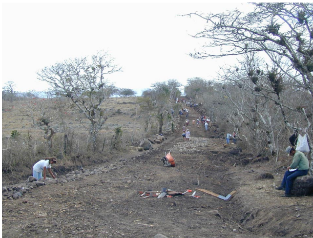
Figure 11: Rural Road Near Jinotega, Nicaragua