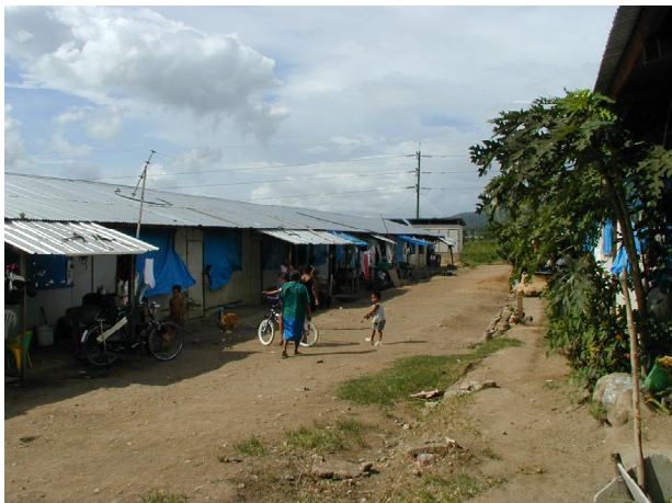
Figure 4: Temporary Shelters in El Progreso Compared to Housing Completed With Disaster Recovery Funds in El Pataste, Honduras