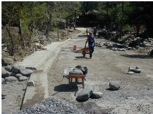
Figure 2: Cobblestone Road Project in Pespire, Honduras