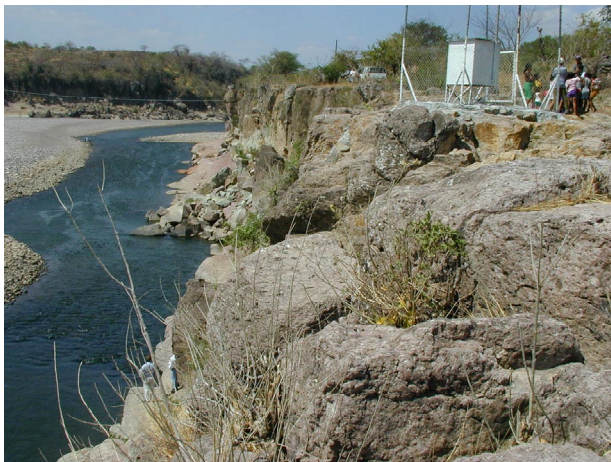
Figure 5: River Gauge Near Choluteca, Honduras