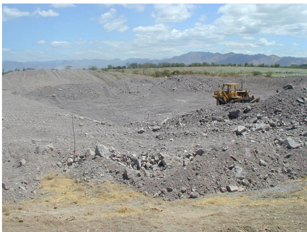
Figure 9: Construction of Sewage Treatment Lagoons Near Choluteca, Honduras