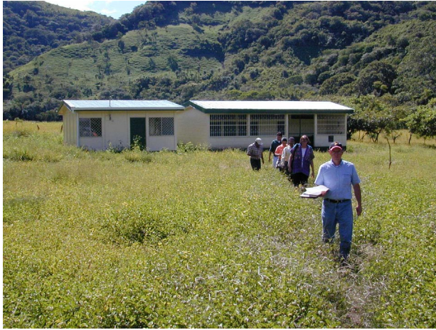
Figure 12: Rural Health Facility Near Matagalpa, Nicaragua

lack of support. In January 2001, we returned to the clinic unannounced and found that a doctor was present and living at the residence and the clinic was operating. He had been assigned following our earlier visit. (See figure 12.)