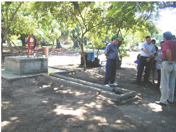
Figure 8: Well Sites in Rural Nicaragua