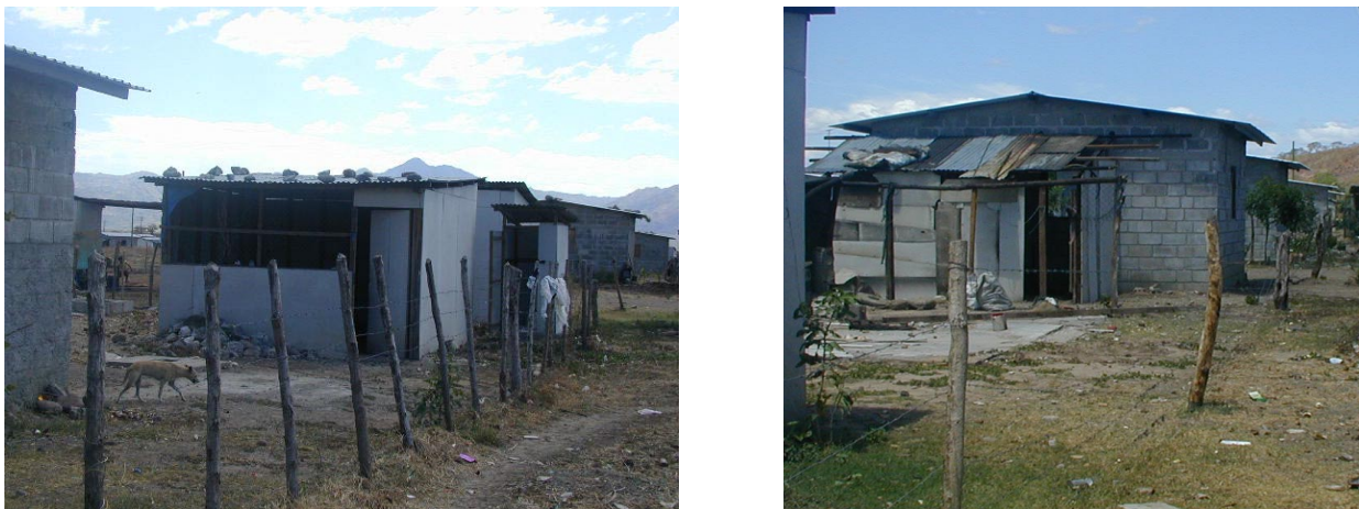
Figure 10: Houses in Limon de la Cerca, Honduras

Twelve nongovernmental organizations representing a variety of international donors built 1,126 houses for families who lost their homes in Mitch floods. USAID funded a temporary health clinic and a vocational training center. USAID is also funding a potable water and sewer system for the planned community; the residents have a temporary water supply and latrines in the meantime. However, because such services are not complete or are inadequate to support the community, many houses remain unoccupied and some families have moved elsewhere. Crime is increasing and some residents are stealing materials from unoccupied houses. According to USAID officials, these problems stem partly from the rush of donors to finish houses and the fact that community leadership has been divided among the different areas developed by nongovernmental organizations, with the unintended result of setting up separate communities. (See figure 10.) USAID is optimistic that the community will become more viable as more families move in following completion of the water system and the rest of the houses. However, USAID officials also noted that experienced developers are needed for these large sites to help ensure that attention is paid to overall infrastructure and services.