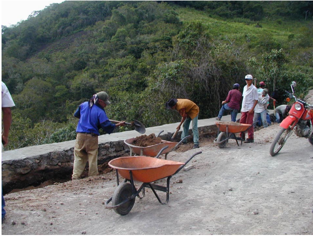
Figure 7: Construction of Retaining Walls and Culverts Near Jinotega, Nicaragua