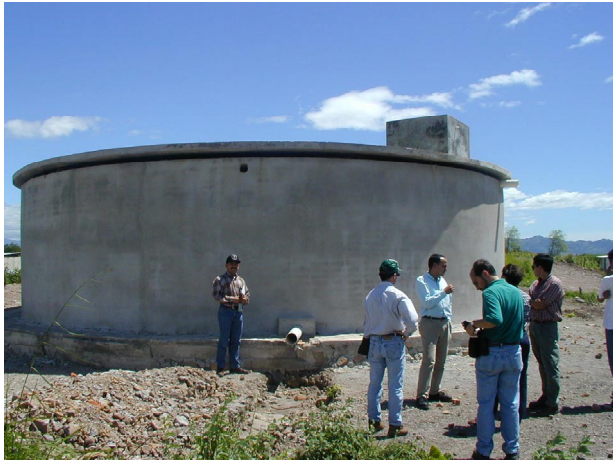
Figure 3: Water and Sanitation Projects Near Choluteca, Honduras