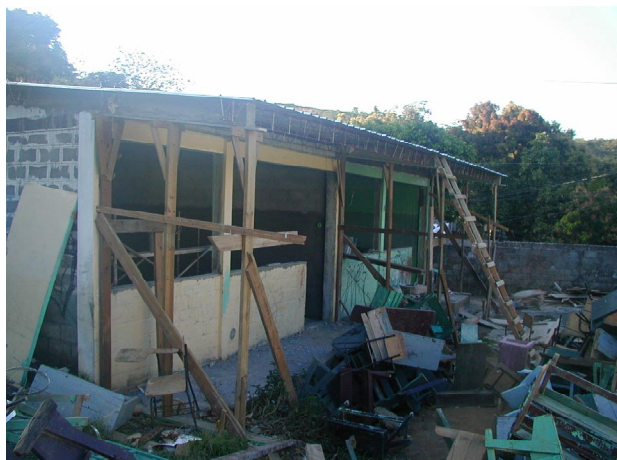
Figure 6: School Under Repair Near La Ceiba, Honduras