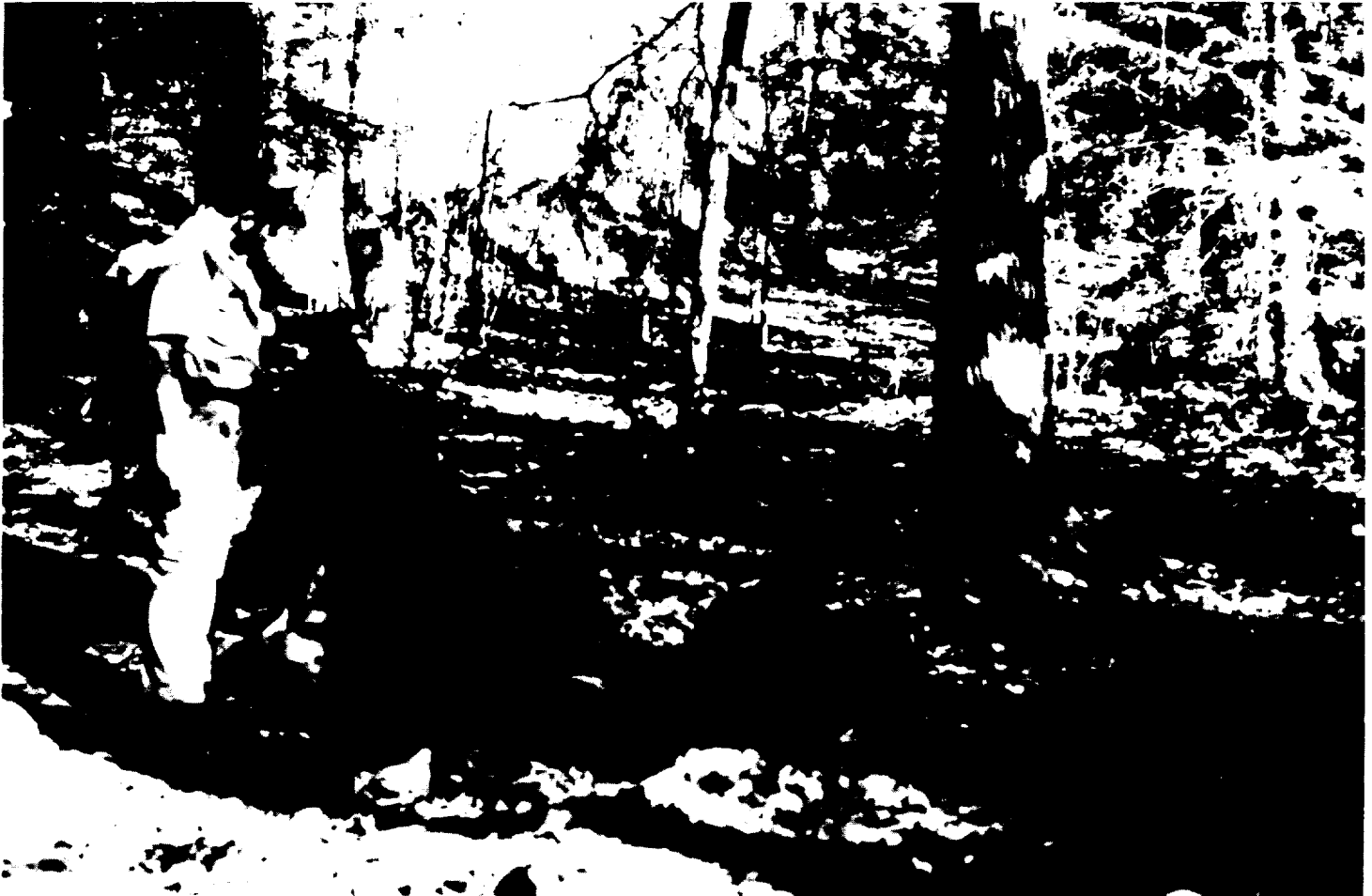
Figure 2.8: Old Tent and Litter at Campsite in Cohutta Wilderness

Conditions at some campsites in the Bob Marshall Wilderness Complex were examined by the Intermountain Forest and Range Experiment Station staff, who reported in July 1983 that large areas had been disturbed and many trees had been damaged. They stated that such damage is primarily a result of the prevalence of large parties with stock and the persistence of practices such as felling trees for tent poles and tying stock to trees. In a 1988 inventory of selected campsites, the Forest Service stated that about 5 percent of the 300 campsites visited exceeded Forest Service standards for barren vegetation.