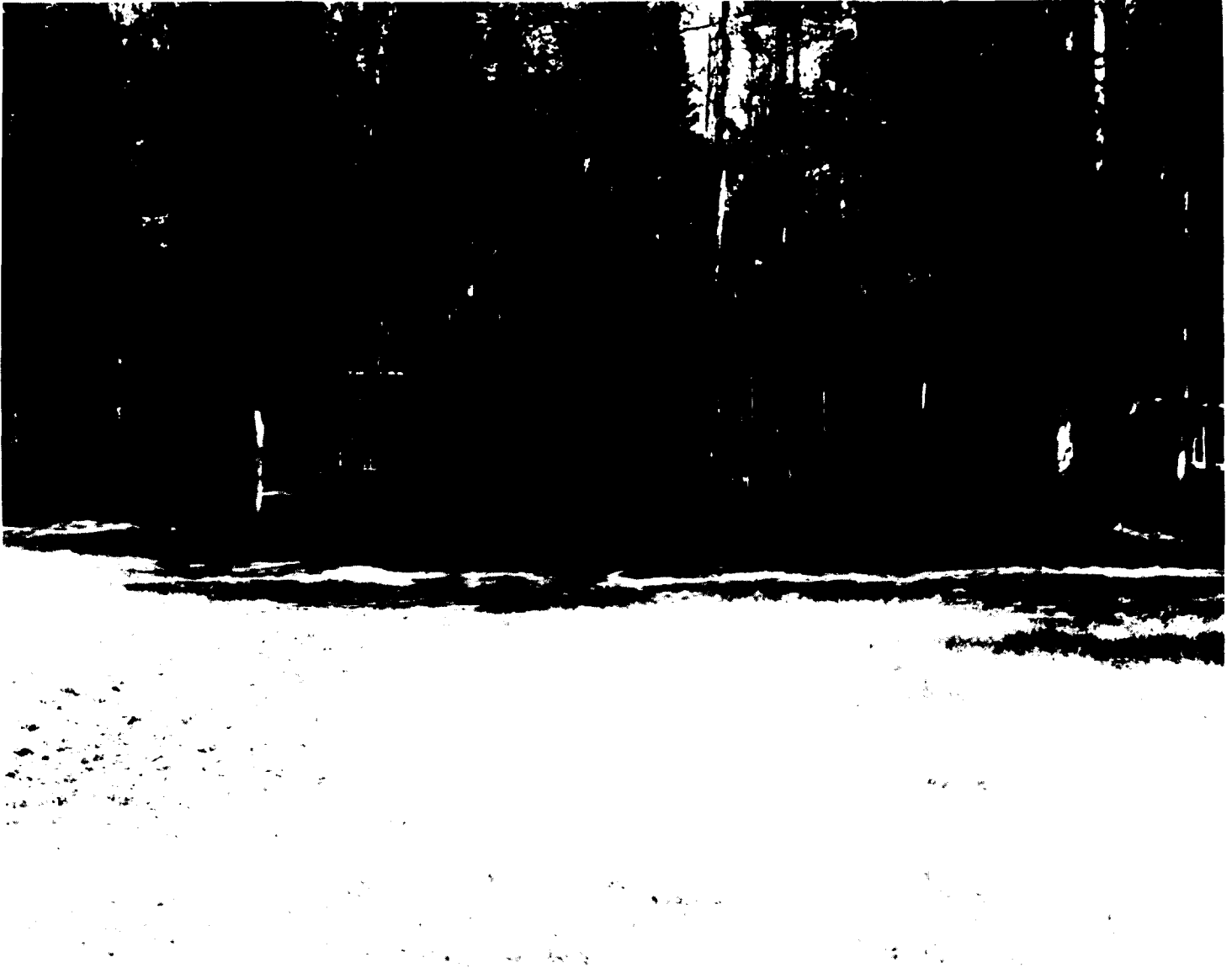
Figure 2.21: Remains of Research Impoundment in Frank Church-River of No Return Wilderness