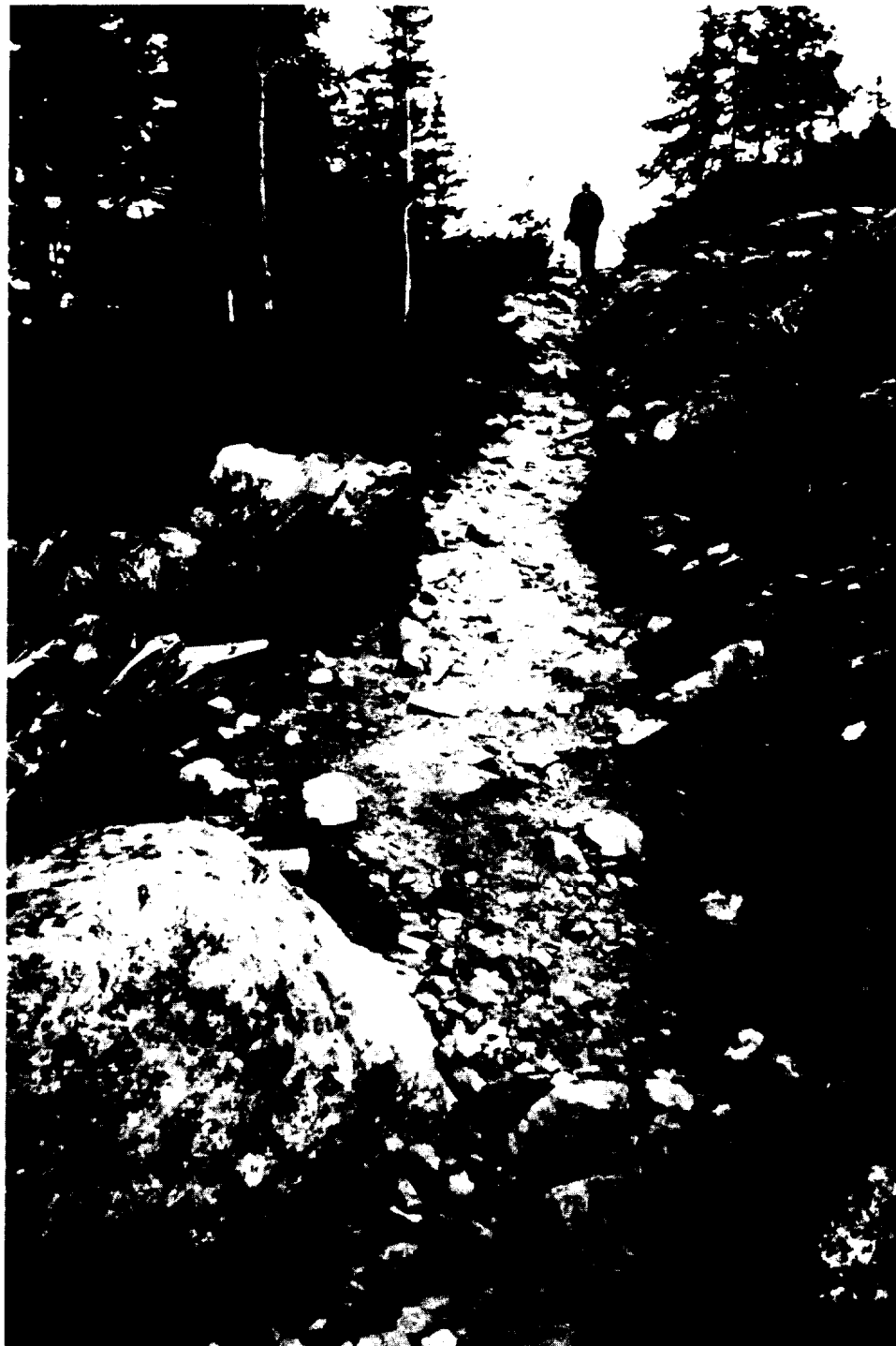
Figure 2.1: Eroded Trail in Holy Cross Wilderness