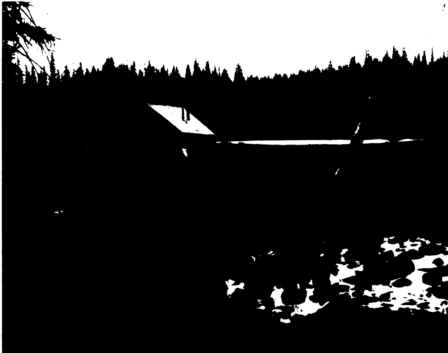
Figure 2.17: Nonhistorical Cabin in Three Sisters Wilderness

When we visited the cabin in November 1988, we observed the remains of an unauthorized outdoor toilet and other debris. (See fig. 2.18.) Also, considerable food was stored in the cabin. The District Ranger told us that although the cabin does not have any historical significance, he had no immediate plans to remove it. The draft wilderness plan for the Willamette National Forest stated that other cabins and shelters have been illegally constructed in the wilderness.