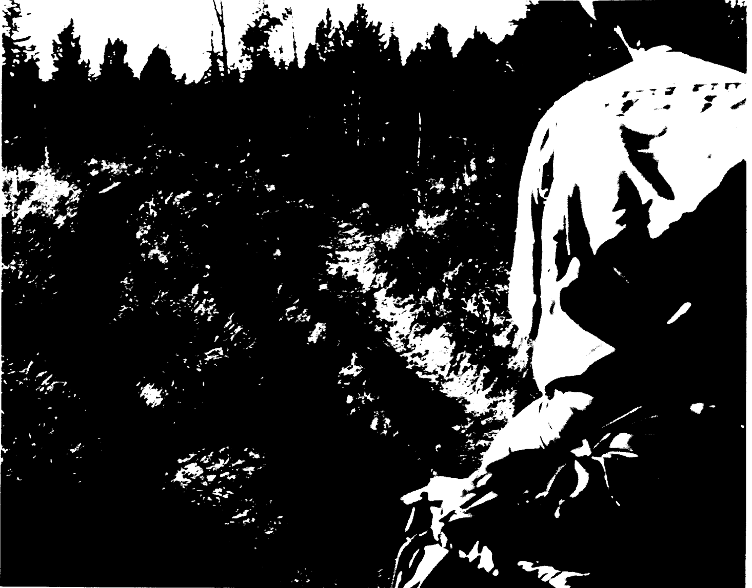
Figure 2.6: Gullying and Multiple Trail in Bob Marshall Wilderness