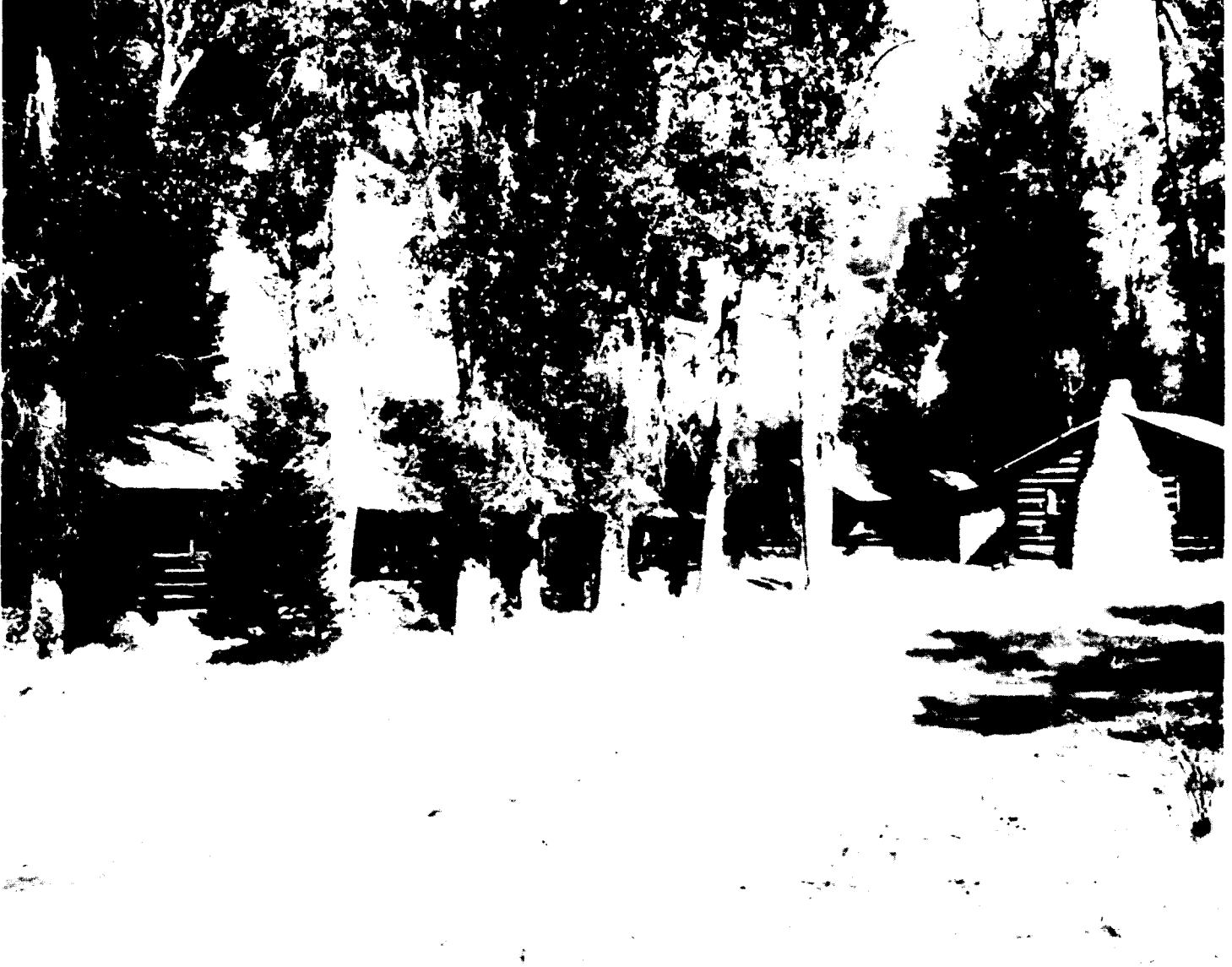
Figure 2.19: Nonhistoric Buildings at Forest Service-Acquired Ranch in Frank Church-River of No Return Wilderness