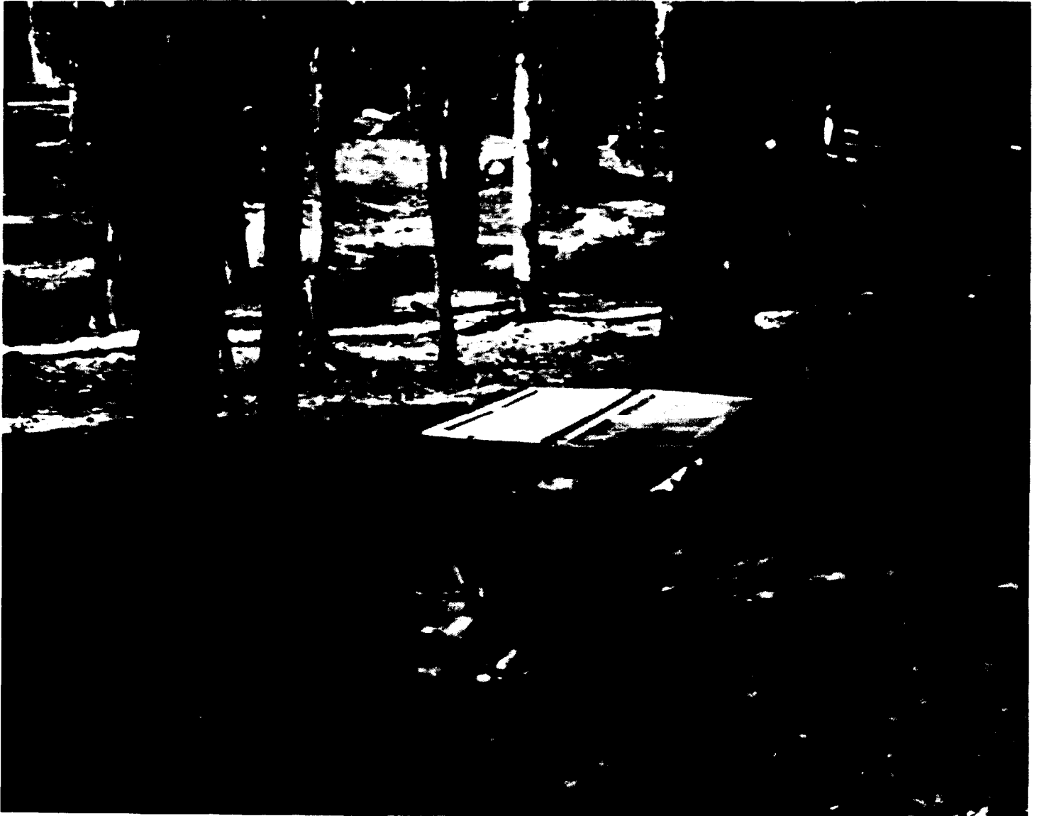
Figure 2.18: Remains of Outside Toilet in Three Sisters Wilderness

At another district that manages a portion of the Three Sisters Wilderness, the Disbursed Recreation Manager said four three-sided shelters have been constructed and they are resulting in adverse impacts because of concentrated camping over the years. A decision had not been reached regarding whether they will be removed and, if so, how to proceed with the removal, he said.