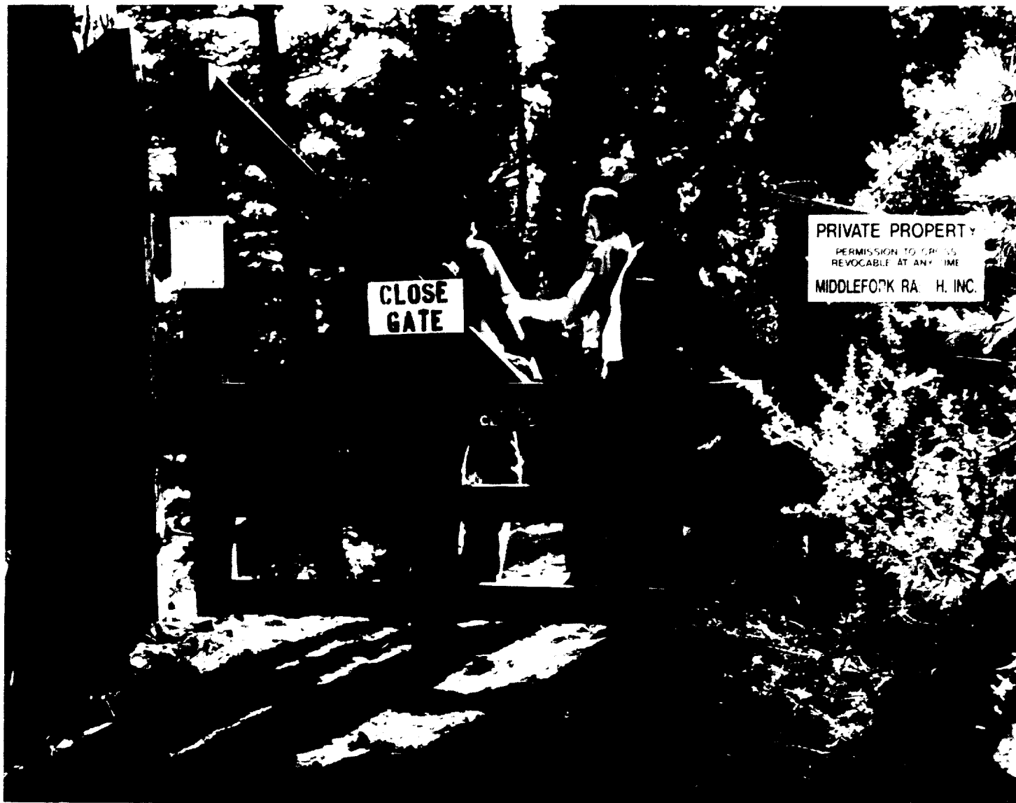
Figure 2.22: Private Property Sign Across Trail in Frank Church-River of No Return Wilderness

In West Virginia's Dolly Sods Wilderness, the Forest Service has been negotiating for several years in an attempt to acquire access through an area owned by a private corporation. However, at the time of our fieldwork, it had been unable to acquire ownership or an easement. During our hike in the wilderness, which was led by a volunteer of the American Hiking Society, we were confronted by a no-trespassing sign at one of the main access trails to the wilderness. He told us that visitors use