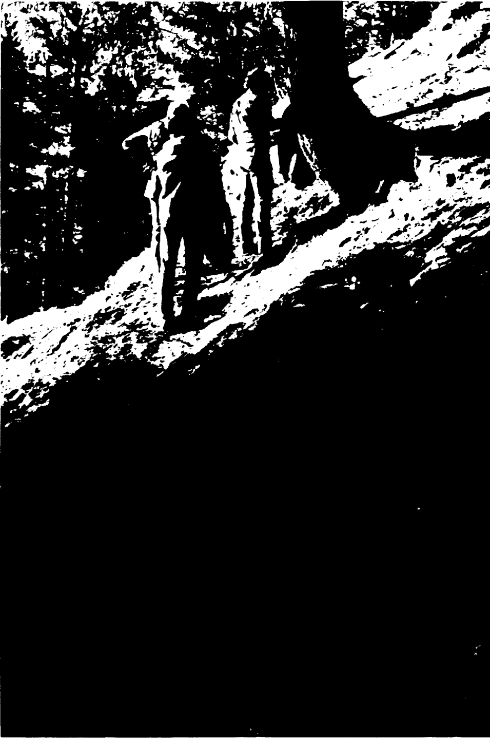
Figure 2.7: Steep Trail Section in Bob Marshall Wilderness