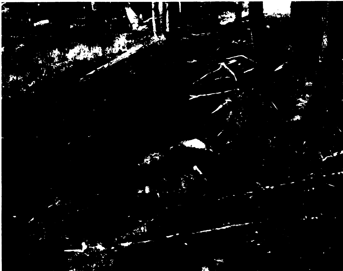
Figure 2.4: Bare Tree Roots on Trail Section in Pecos Wilderness