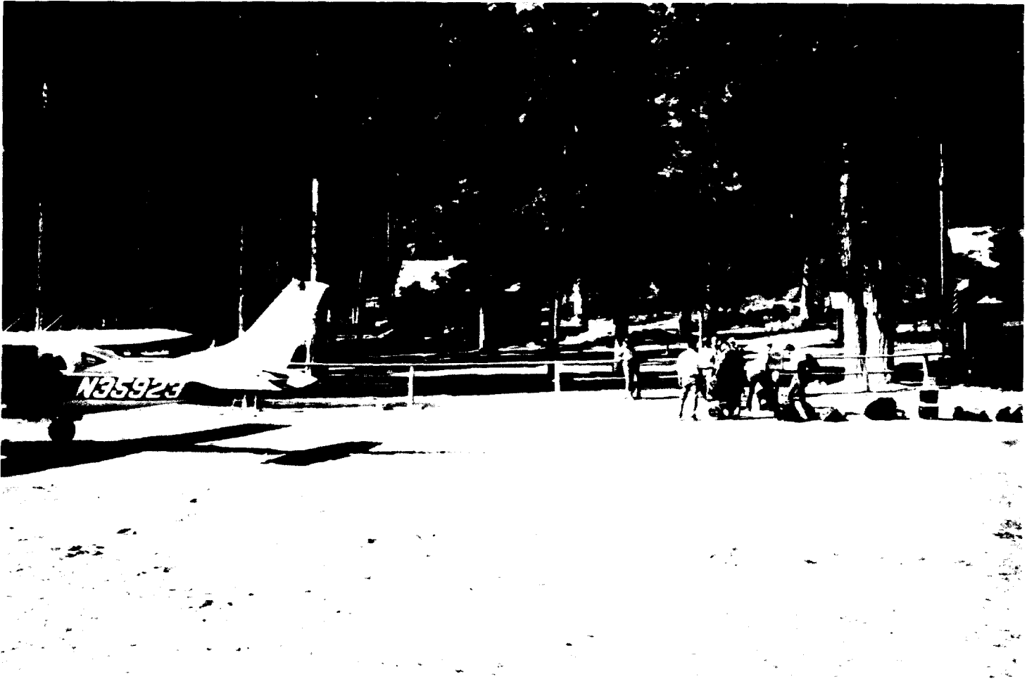
Figure 2.13: Forest Service Administrative Site in Frank Church-River of No Return Wilderness

the wilderness management plan. Because of this heavy use, a decision was made to repair the airstrip using flown-in mechanized equipment to get the job done quickly. The more wilderness-compatible alternative—repairing the strip with primitive tools, such as horse-drawn graders—would have closed the strip for a much longer period than was actually the case. In contrast, on a trail construction project, a Forest Service contract requires hand chiseling of blasting holes in some rocky areas rather than the use of power drills.