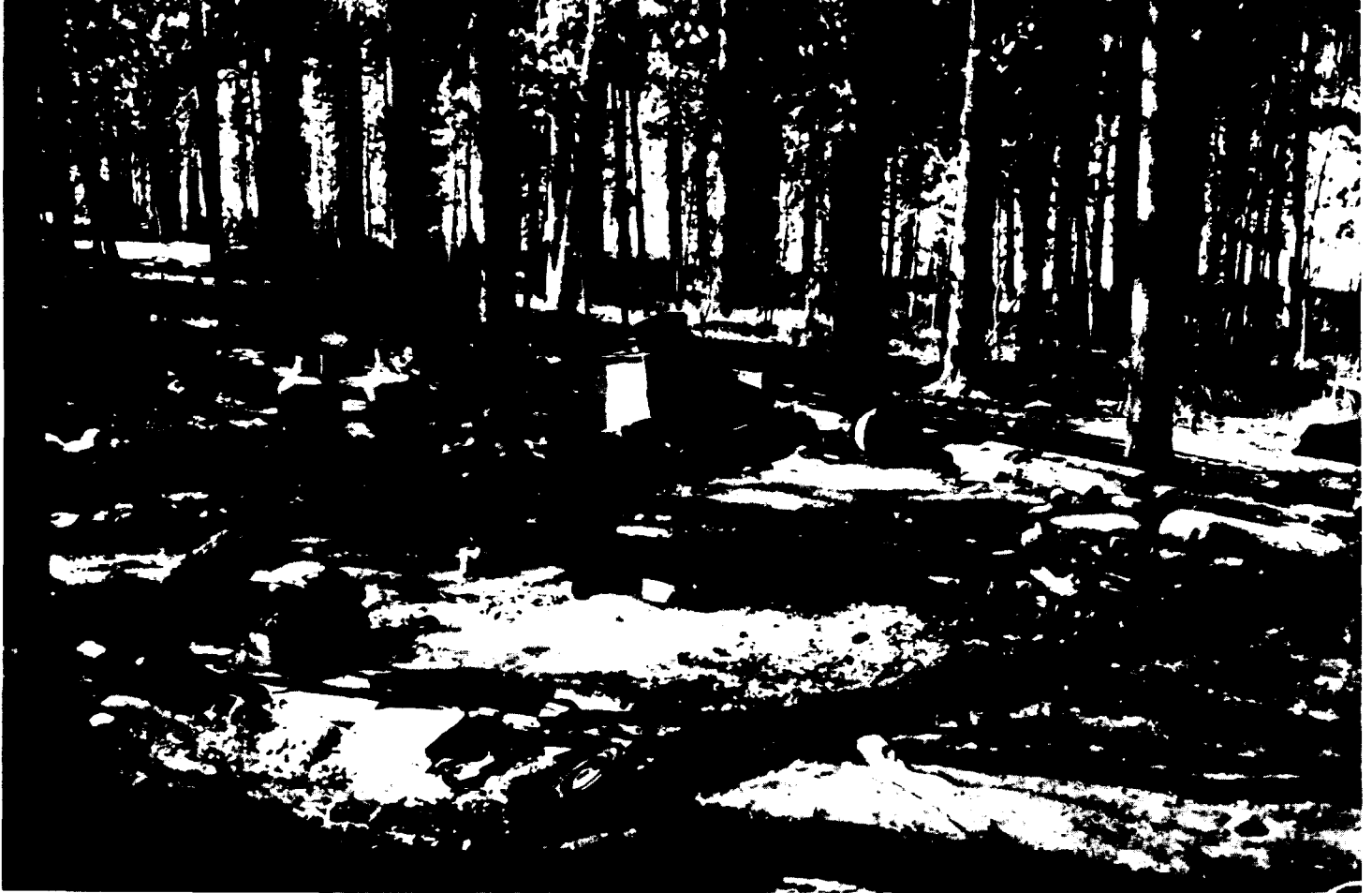
Figure 2.15: Burned-Out Outfitter Camp in Frank Church-River of No Return Wilderness