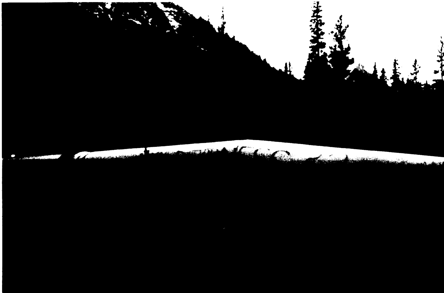
Figure 2.23: Water Collection Pipes at Boundary to Holy Cross Wilderness