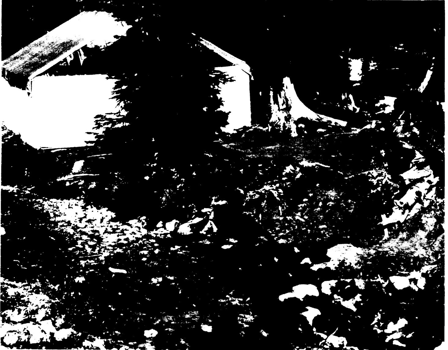
Figure 2.16: Outfitter Camp in Bob Marshall Wilderness