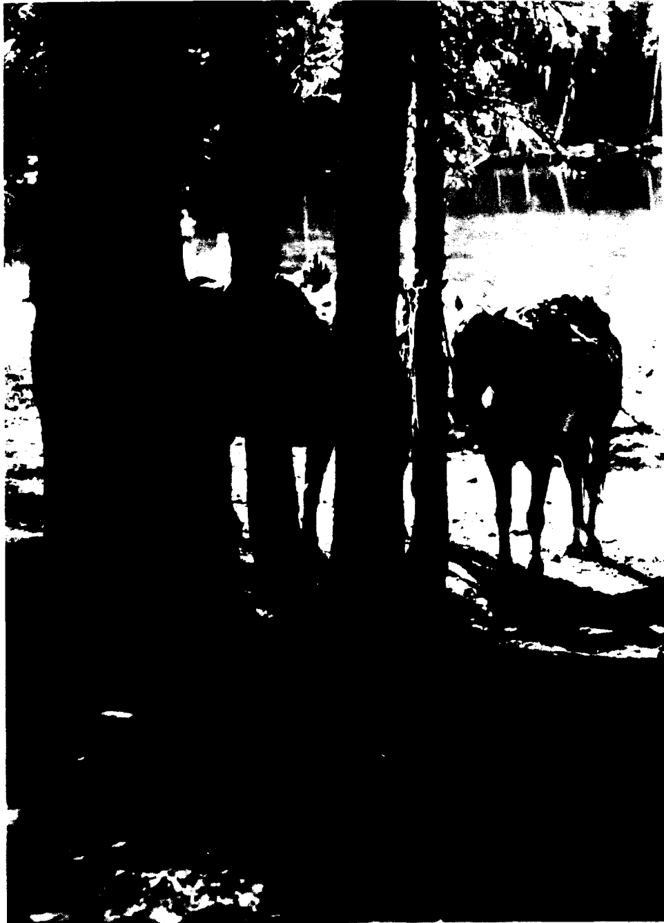
Figure 2.9: Firering and Horses Tethered to Trees at Camping Area Adjacent to a Lake in Bob Marshall Wilderness

areas with firerings, litter, and tree root exposure as a result of horses being tied to the trees. (See fig. 2.9.)