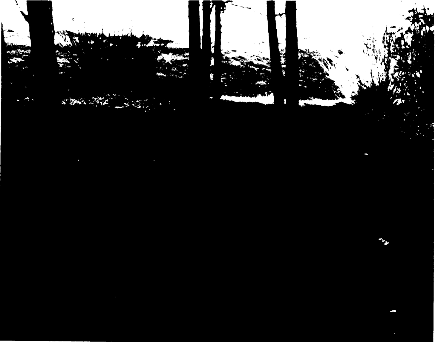
Figure 2.11: Pack Animal Damage at Campsite in Pecos Wilderness