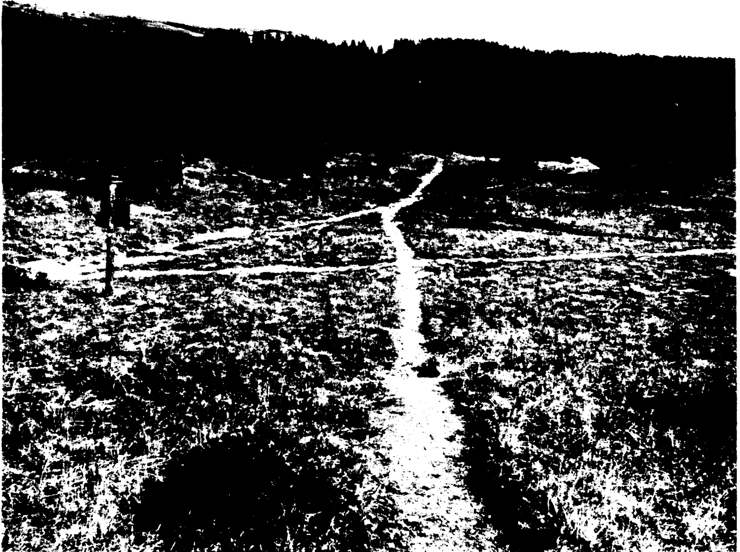
Figure 2.2: Multiple Trails in Pecos Wilderness