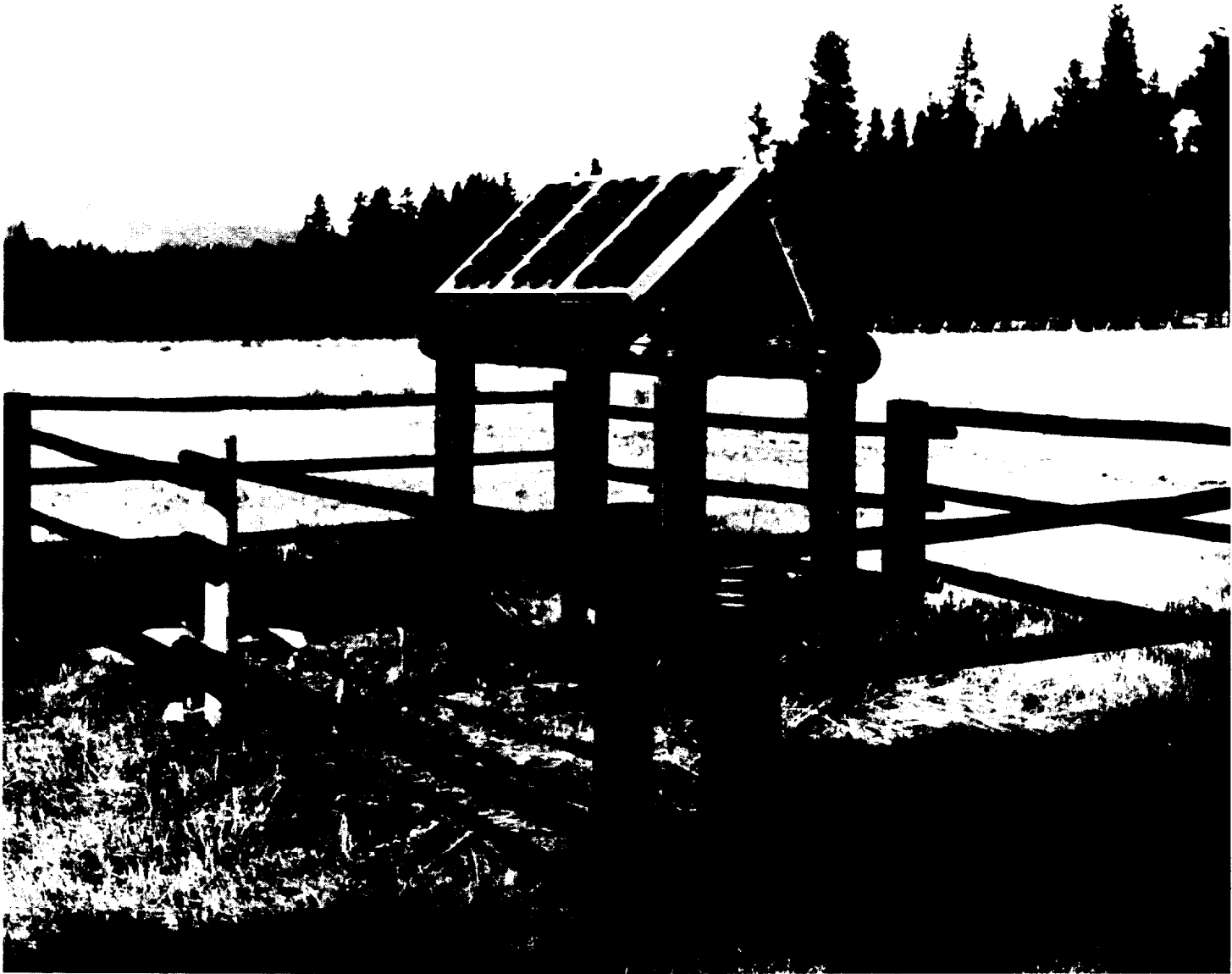
Figure 2.14: Forest Service Solar Panel in Bob Marshall Wilderness

The Forest Service also maintains 11 guard stations in this wilderness. Fire lookouts are also present in the wilderness but their role has largely been taken over by aircraft patrols. Unlike the situation in the Three Sisters Wilderness, where fire lookouts are available for public use, these facilities are secured and maintained on a limited basis for use in wildland fire and communications support.