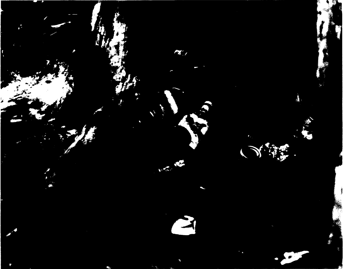
Figure 2.10: Litter at Camping Area in Pecos Wilderness