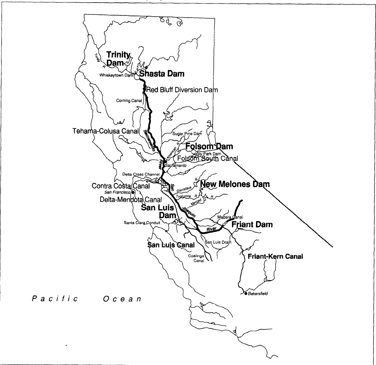
Figure 1.1: Major Components of the Central Valley Project in California