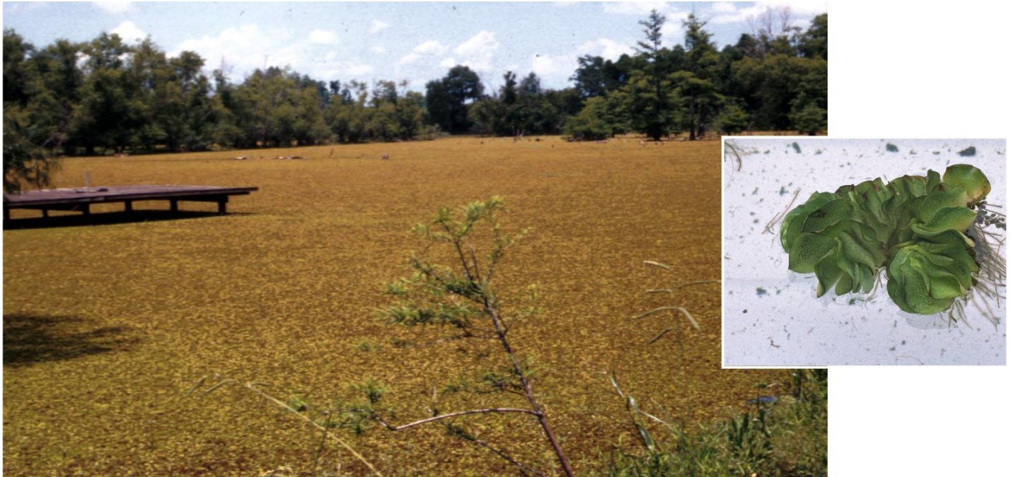
Figure 4: Giant Salvinia Covering a Pond in Texas

Once the home of trophy bass, this 6-acre pond east of Houston, Texas, became completely covered with giant salvinia within months of the initial infestation.