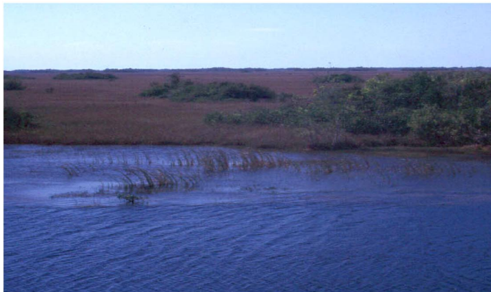
The Asian swamp eel thrives in adverse conditions. This air-breathing creature has a voracious appetite for fish, frogs, and aquatic invertebrates. It has turned up in a canal adjacent to the Florida Everglades.