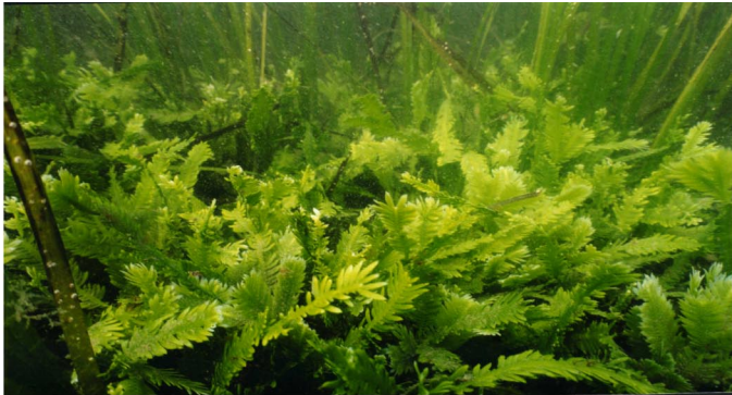
Caulerpa taxifolia (a.k.a. "killer algae") grows as a dense blanket, smothering and killing aquatic vegetation. It is shown here invading a native eelgrass bed in a coastal lagoon north of San Diego.