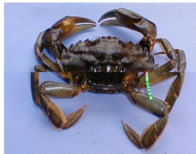
The European green crab, an invasive predator that feeds voraciously on shellfish, may seriously affect shellfish aquaculture and Dungeness crab populations on the West Coast.