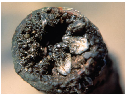
Zebra mussels clogging a pipe.