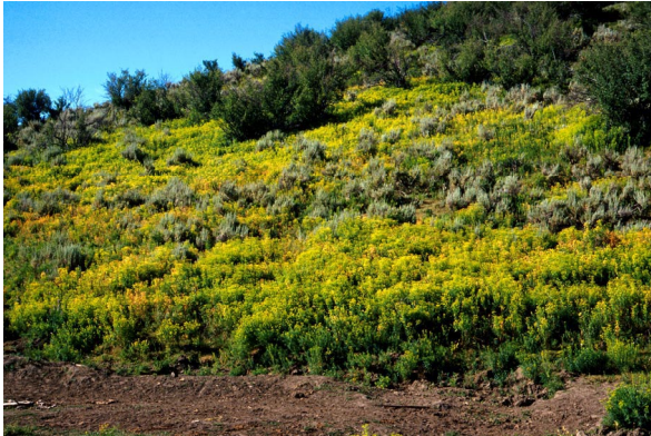
Figure 1: Leafy Spurge, Asian Long-Horned Beetle, Zebra Mussels, and Green Crab