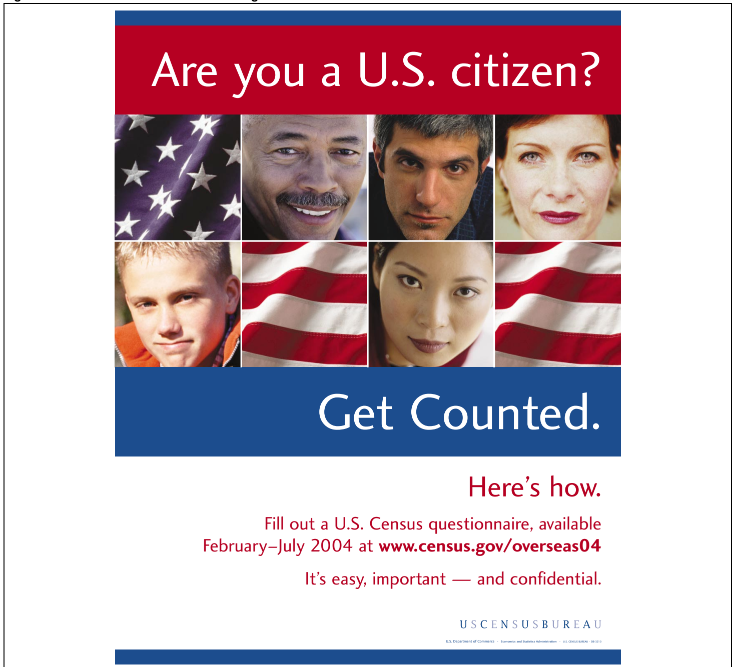
Figure 1: Census Bureau Poster Advertising the Overseas Census