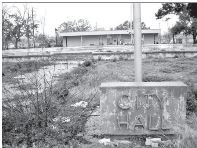
Figure 3: City Halls in Mississippi and Louisiana Have Been Destroyed and City Officials Now Operate Out of Trailers