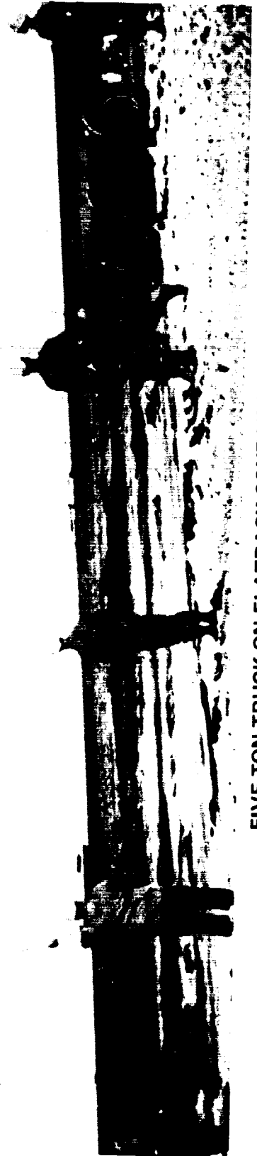
FIVE-TON TRUCK ON FLATRACK CONTAINER.