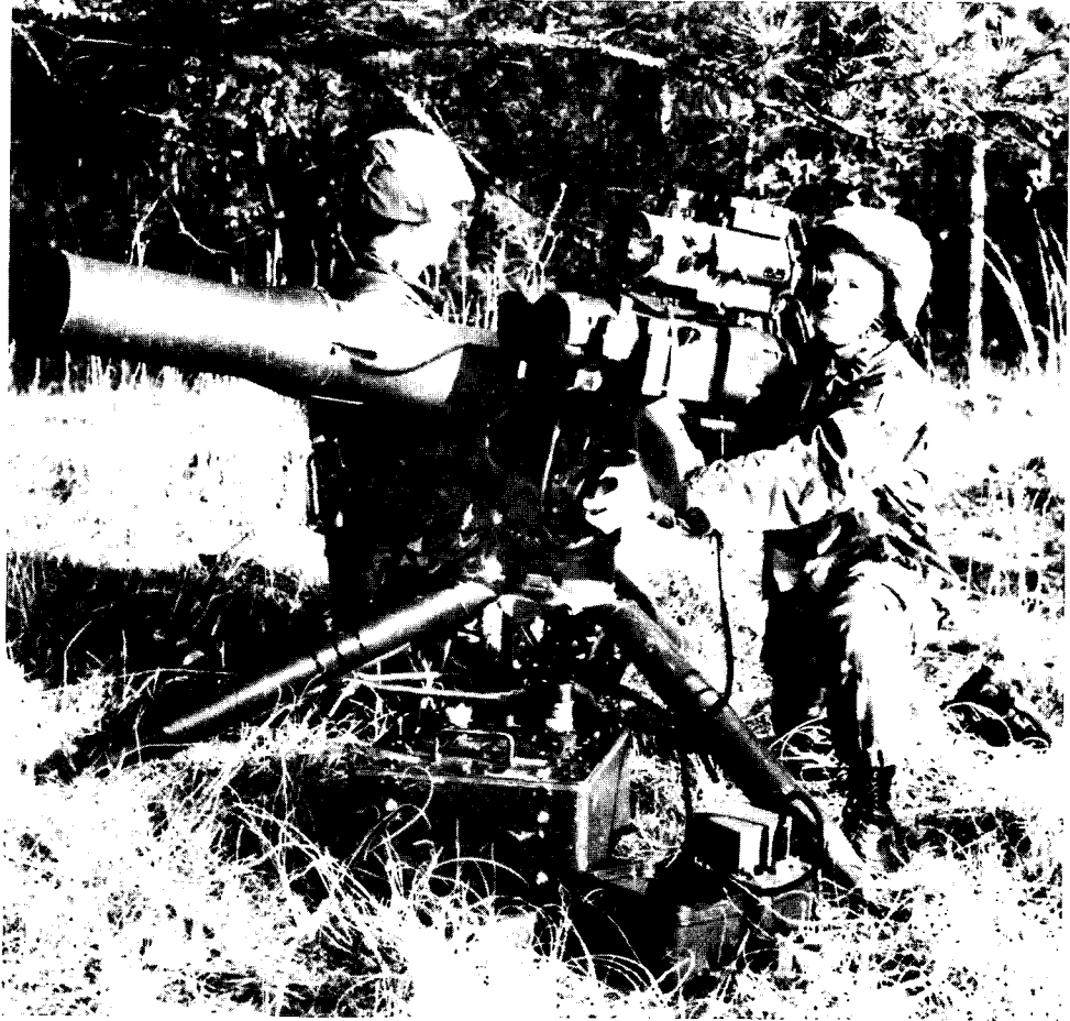
Figure 1.5: TOW

launcher transmits course corrections to the missile. tow2's tracking and sighting have been upgraded to maximize resistance to [material deleted]. Its warhead diameter is 150 millimeters (6 inches). (Infantry have also used heavy antitank guns such as the 106-millimeter recoilless rifle. We did not include such weapons in this study.)