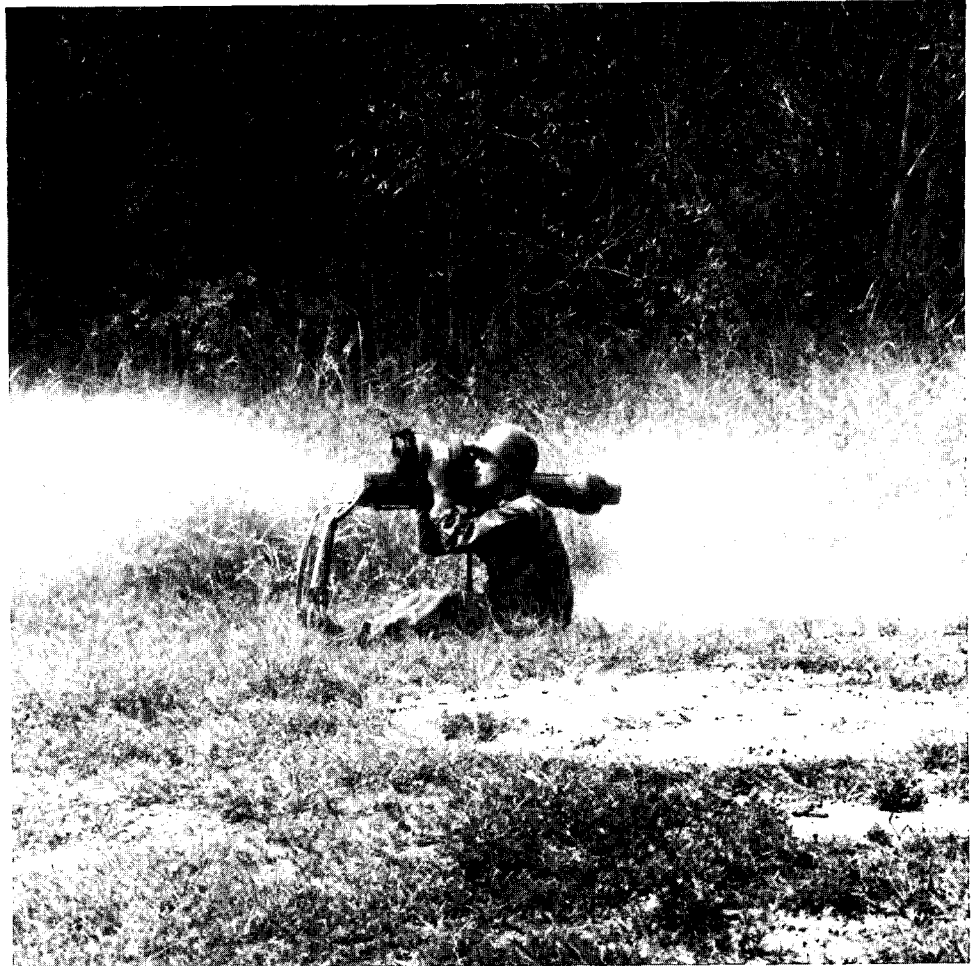
Figure 1.4: Dragon