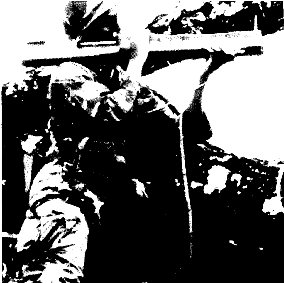
Figure 1.2: M72A3