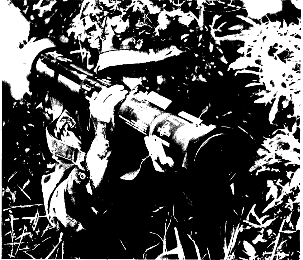
Figure 1.3: AT4