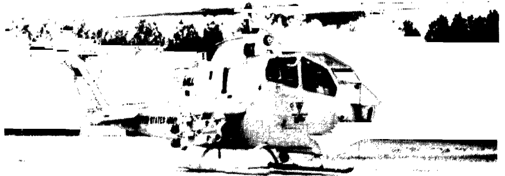
Figure 1: Cobra Attack Helicopter and AVR-2 Laser Warning System