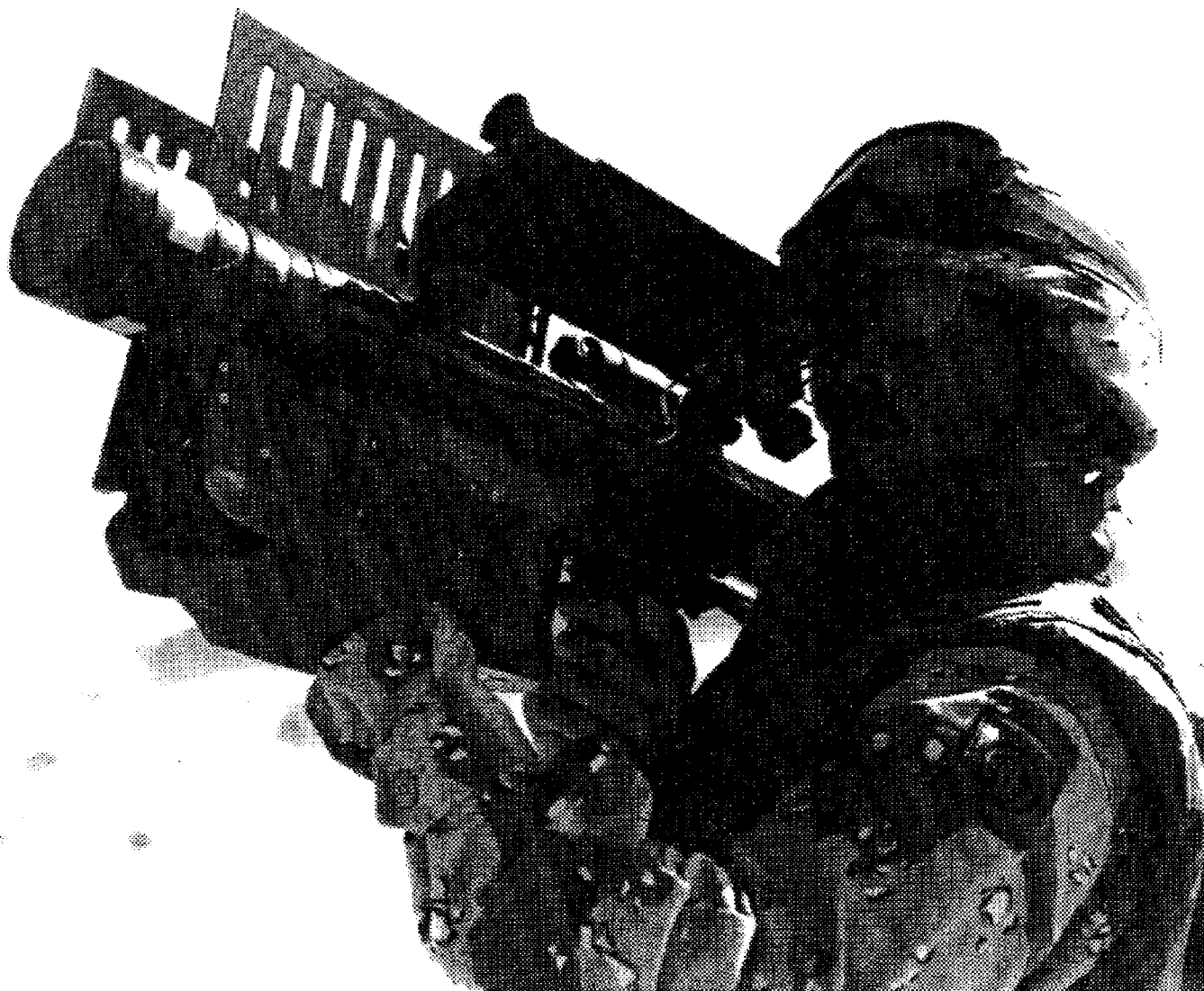
Figure 1: The Stinger Missile

Since 1970, several hundred thousand of these missiles have been produced and issued to the military services, and thousands were sold to other nations through the Foreign Military Sales Program. Because the