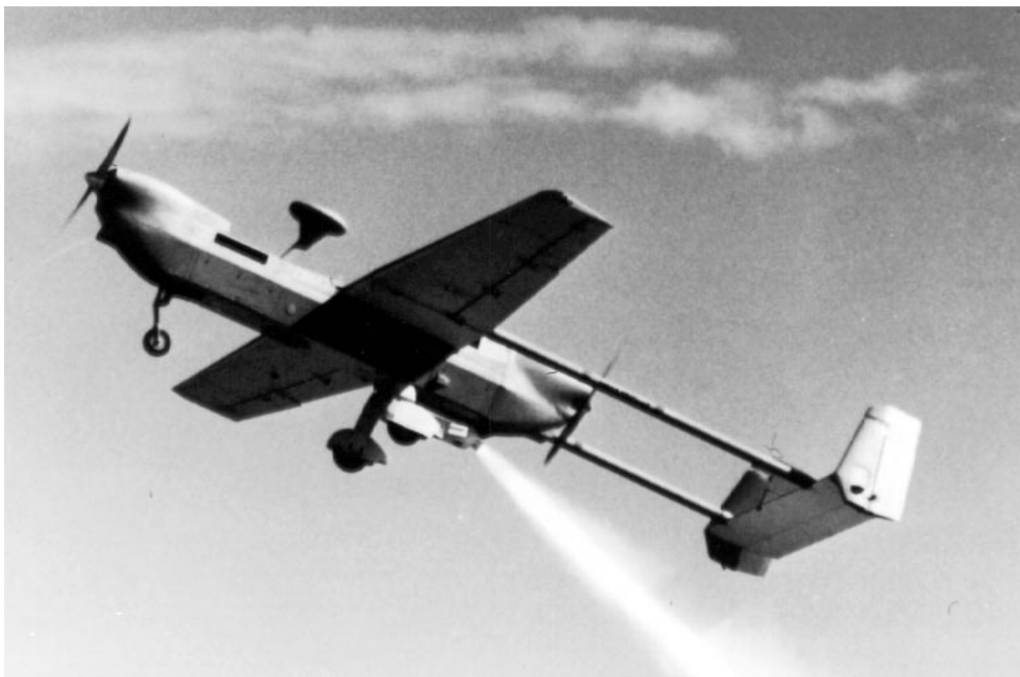
Figure 2: Hunter UAV