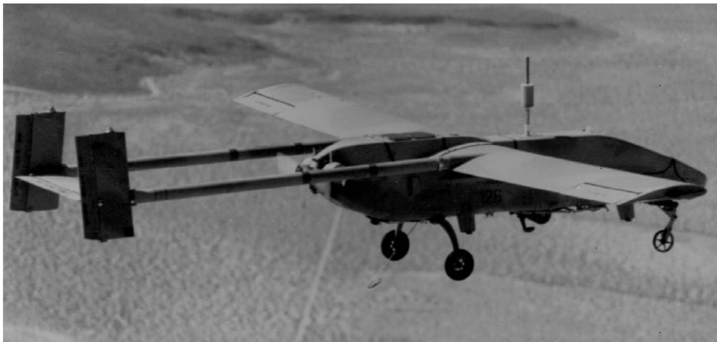
Figure 1: Pioneer UAV

Despite the importance of operational testing as a management control to ensure adequate system performance, DOD started producing two UAVs, the Pioneer and more recently the Hunter, before subjecting them to any operational testing. (See figs. 1 and 2.) These two systems, both acquired as nondevelopmental items 1 from the same foreign contractor, clearly illustrate the adverse consequences of beginning production without having adequate assurance of satisfactory system performance. For example, premature production of the Pioneer resulted in a doubling of the costs for the nine acquired systems that do not meet service requirements. DOD has also spent $627 million to acquire and support seven Hunter systems that are experiencing problems and an uncertain future.