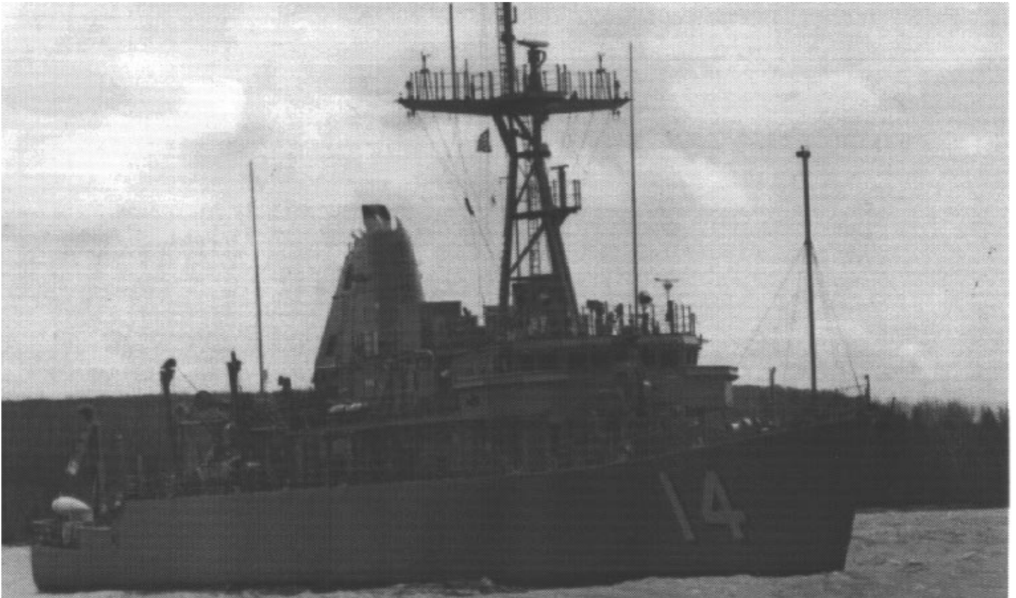
Figure 1.1: An MCM Ship

The Avenger class MCM ship, the larger and more capable of the two classes of mine countermeasures ships, is a 224-foot ocean-going mine warfare ship designed to clear mines in both coastal and offshore areas. (See fig. 1.1.) The hull is constructed of wood and glass-reinforced plastic to maintain a nonmagnetic character, which is essential to mine clearing operations.