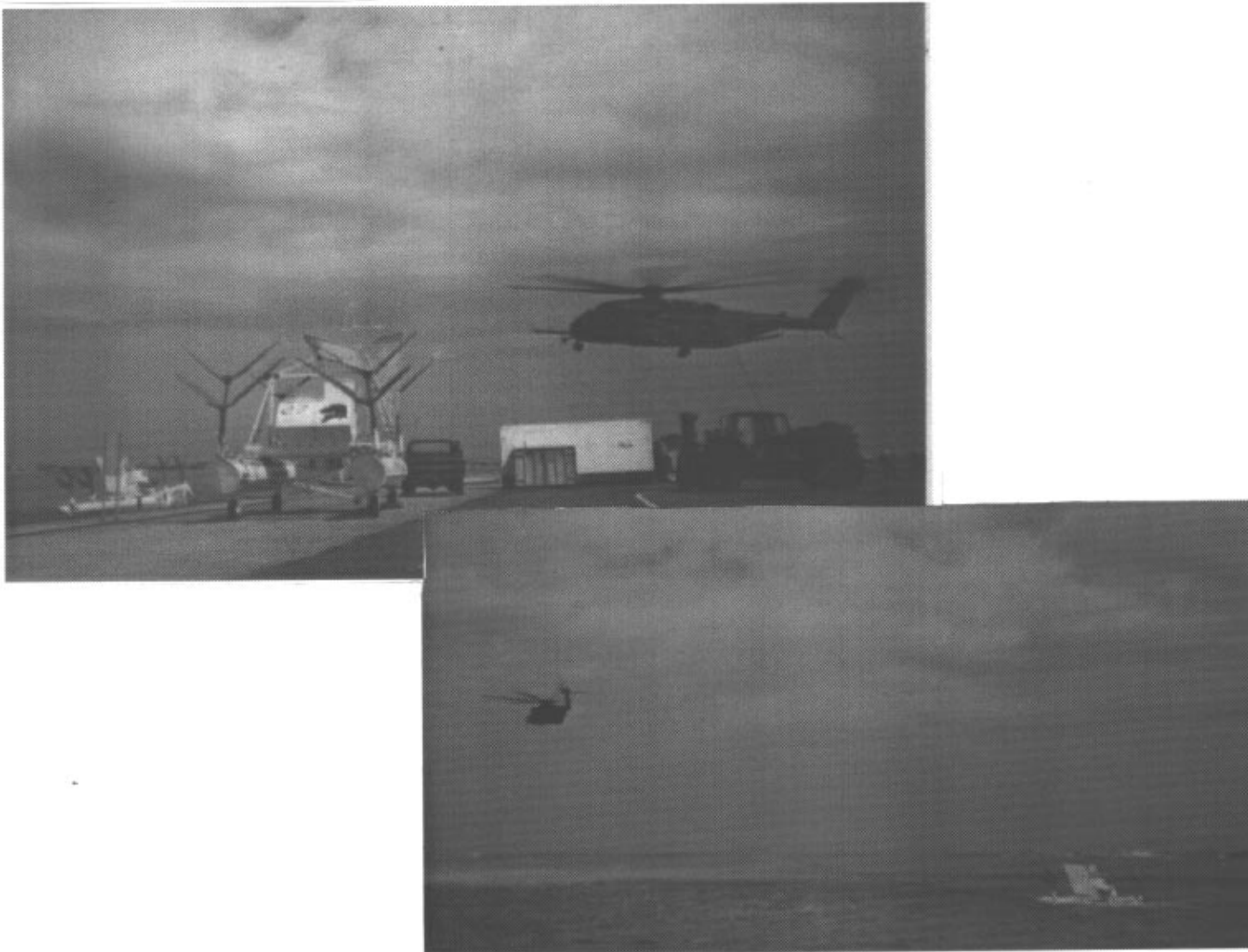
Figure 1.4: An MH-53E Helicopter With Minesweeping Gear