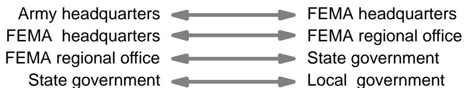
Figure 1: FEMA's Communications Protocol for CSEPP