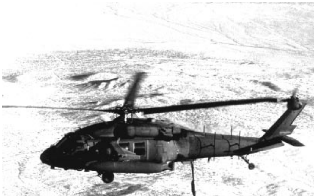
Figure 3: Advanced Quickfix