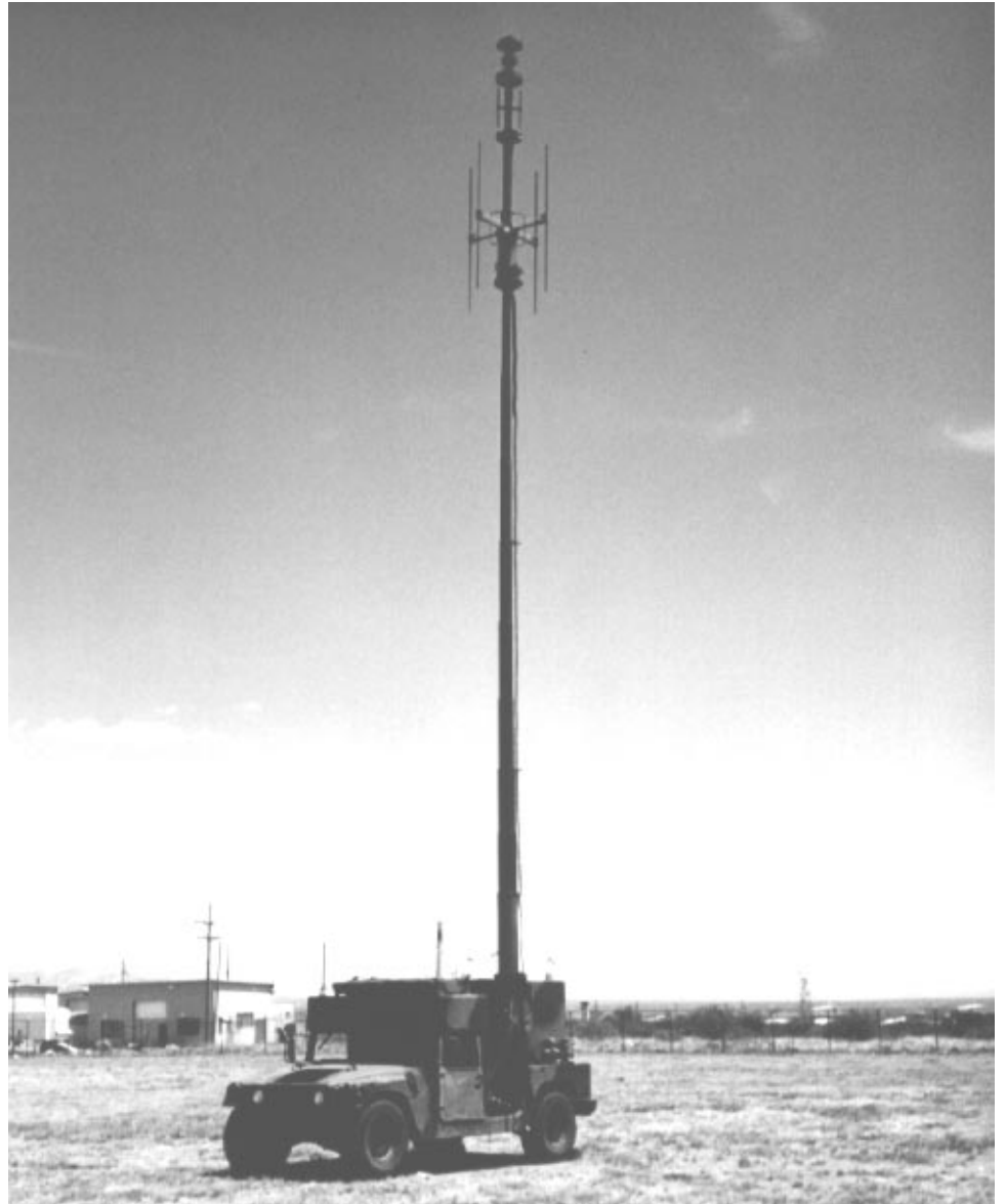
Figure 1: Ground Based Common Sensor-Light