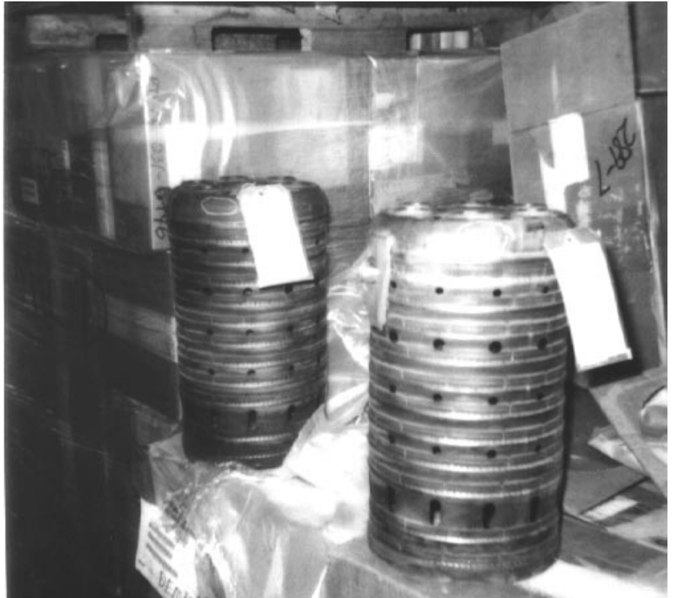
Figure II.1: Engine Combustion Chamber

The Air Force decided that 184 TF-33 engine combustion chambers (Stock No. 2840008285214RV) (see fig. II.1) used on the KC-135 aircraft were surplus and sent them to the Oklahoma City DRMO. The parts originally cost $452,352. On April 15, 1997, the DRMO destroyed the 184 parts, although the parts were repairable. The DRMO destroyed the parts because the Air Force had assigned a demilitarization code to the parts requiring total destruction to protect military technology. The DRMO estimated that it spent $211 to destroy the parts and sold them as scrap for $3,450. After we pointed out that this was a commercial-type item, the Air Force equipment specialist said the assigned demilitarization code was incorrect because the parts contained no military technology. As a result, the DRMO destroyed parts that the private sector could have used. The equipment specialist corrected the demilitarization code.