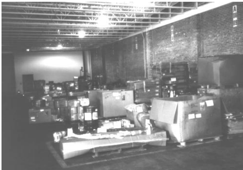
Figure 2: Cobra Helicopter Parts Stored at Corpus Christi DRMO

Defense Reutilization and Marketing Service officials said that in February 1996, they placed a prohibition against selling Cobra parts at DRMOs because the Army-assigned demilitarization codes were inaccurate. The property disposal specialist responsible for the prohibition said the Army planned to review and validate the demilitarization codes for the Cobra helicopter parts and he wanted to be sure the codes were accurate before proceeding with a sale or destruction action. He said the Army had not completed its demilitarization code review. The specialist said he also instructed the DRMOs to destroy the parts if they started experiencing a storage impact. After a meeting with the Chief of the Corpus Christi DRMO, the Defense Reutilization and Marketing Service issued a memorandum directing the DRMOs not to destroy any Cobra parts unless they are in a scrap condition and to hold usable parts in storage until the Army completes the demilitarization code review.