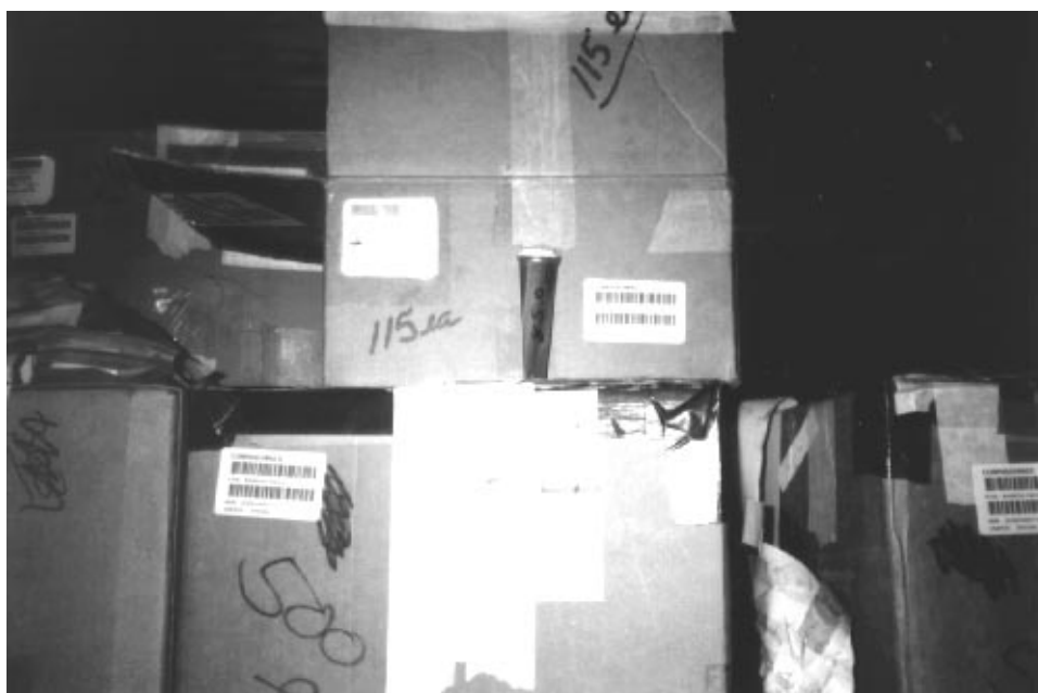
Figure II.3: Turbine Rotor Blades in Manufacturer's Original Packaging

On September 29, 1996, the Corpus Christi DRMO received notice that six transmission cartridge assemblies (Stock No. 1615011167083) used on the UH-1 helicopter were no longer needed by the Army. These parts originally cost $36,774. Since the Army had assigned demilitarization code F to the parts, the DRMO requested disposition instructions from the Army Aviation and Troop Command. On December 12, 1996, the Command instructed the DRMO to destroy the part unless it was (1) unused, (2) in serviceable condition, (3) physically marked with the manufacturer's code, and (4) in