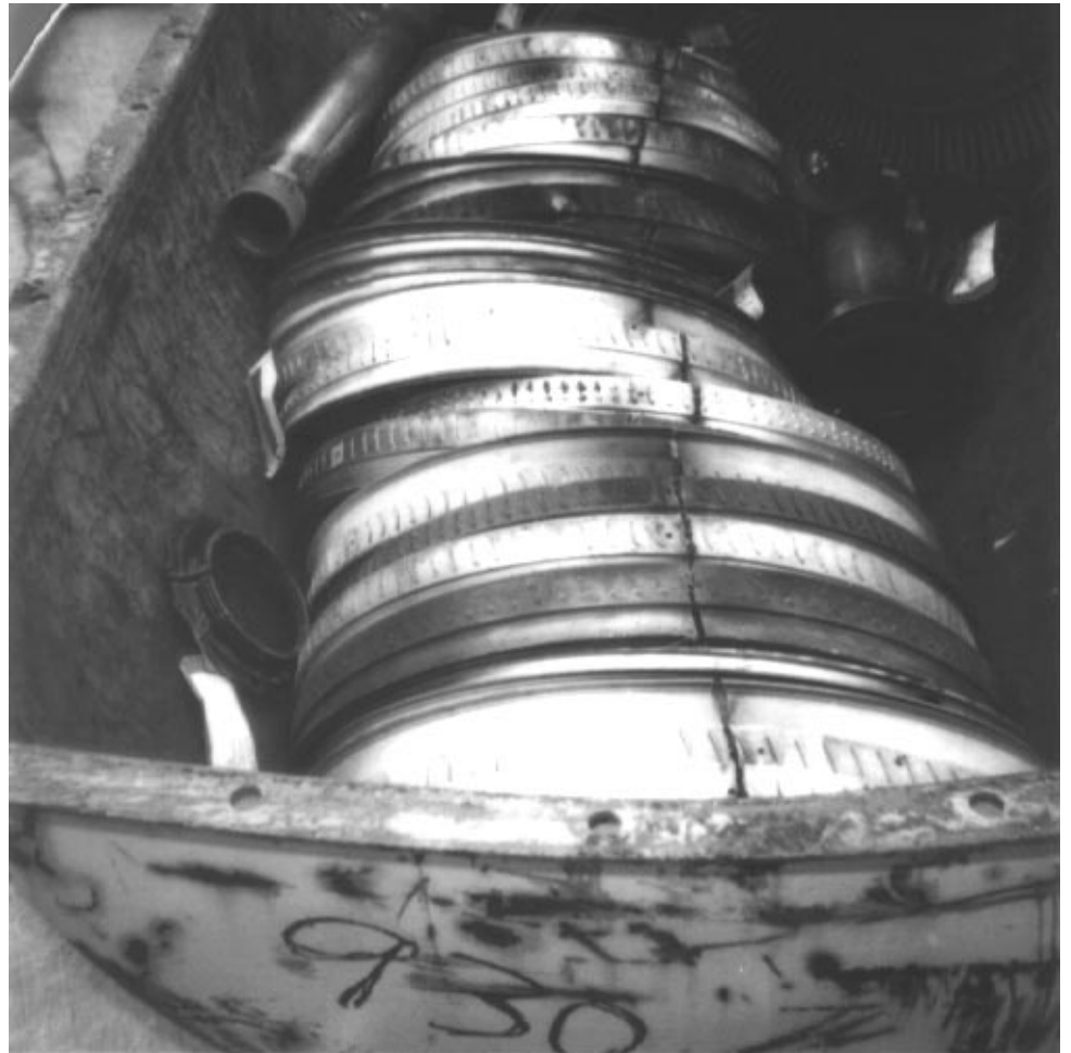
Figure II.2: Nozzle Rings

On April 14, 1997, the Corpus Christi DRMO destroyed 53 circuit card assemblies (Stock No. 5998013370963) used on the UH-60 helicopter. The parts originally cost $54,392. The DRMO destroyed the parts because the Army had assigned a demilitarization code to the parts requiring total destruction to protect military technology. After we questioned if military technology was involved with this part, the Army equipment specialist said the assigned demilitarization code was incorrect because the part, although military unique, was nonsignificant and contained no military technology that needed to be protected. As a result, the DRMO destroyed