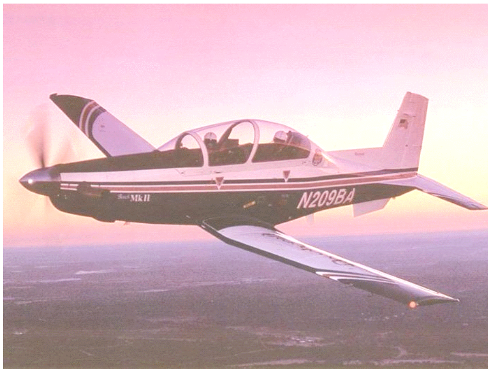
Figure 1: JPATS Aircraft, T-6A Texan II

The JPATS aircraft shown in figure 1, the T-6A Texan II, is to be a derivative of the Pilatus PC-9 commercial aircraft. Raytheon Aircraft Company, the contractor, plans to produce the aircraft in Wichita, Kansas, under a licensing agreement with Pilatus, the Swiss manufacturer of the PC-9. The JPATS aircraft will undergo limited modification to incorporate several improvements and features that are not found in the commercial version of the aircraft, but are required by the Air Force and the Navy. Modifications involve (1) improved ejection seats, (2) improved birdstrike protection, (3) a pressurized cockpit, (4) an elevated rear (instructor) seat, and (5) flexibility to accommodate a wider range of male and female pilot candidates. These modifications are currently being tested during the qualification test and evaluation phase, which is scheduled to be completed in November 1998. Initial operational capability is planned for fiscal year 2001 for the Air Force and fiscal year 2003 for the Navy.