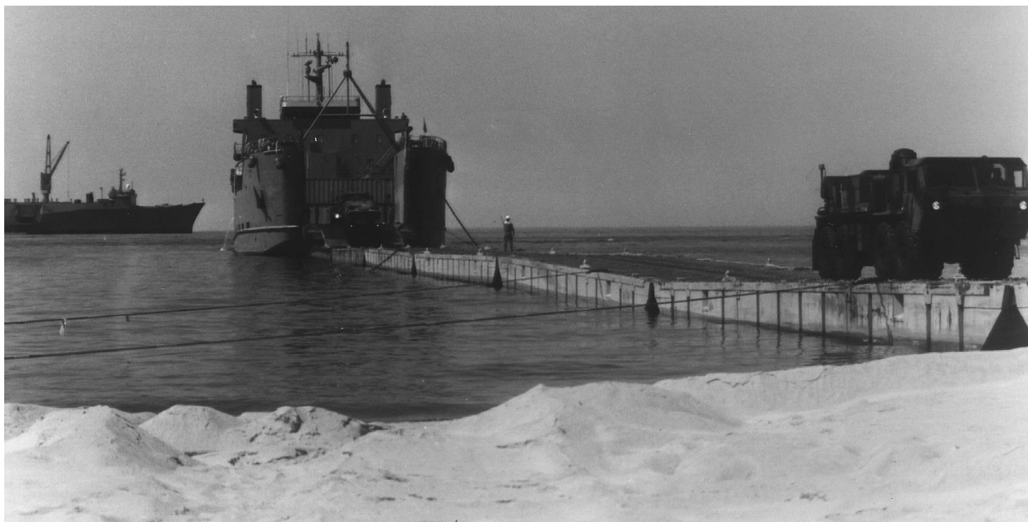
Figure I.8: Logistics Support Vessel Unloading Trucks