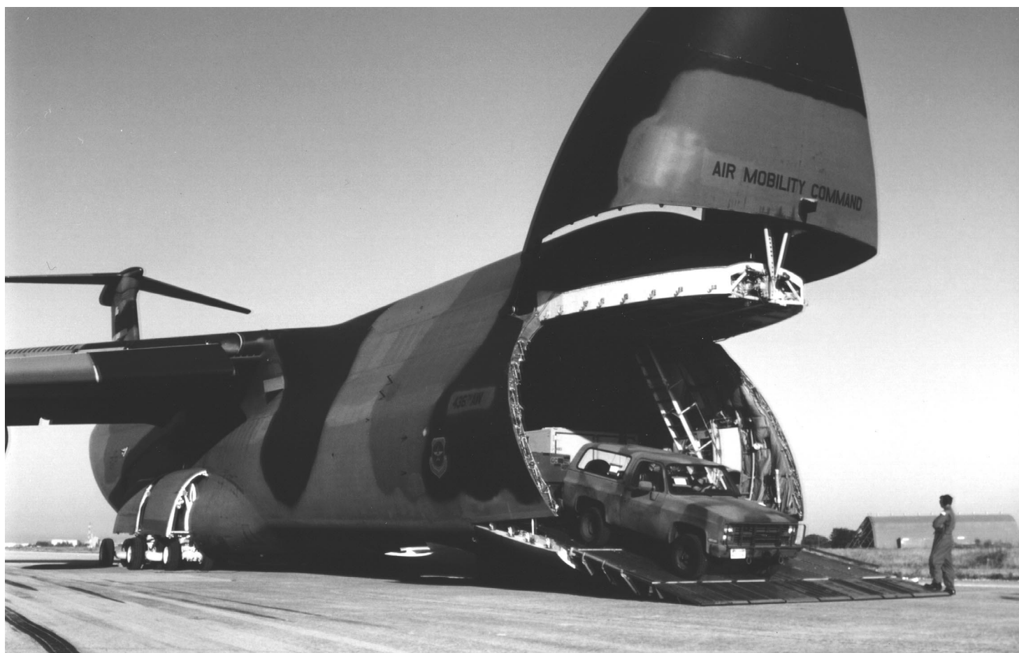
Figure I.3: C-5 Galaxy