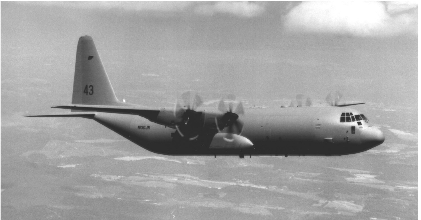
Figure I.1: C-130 Hercules

The C-130 Hercules is the Air Force's primary intratheater airlifter. It can carry 6 pallets and 17 tons of cargo and accommodate 90 passengers. The C-17 Globemaster, being produced by the Boeing Corporation, can carry 18 pallets and 65 tons of cargo and accommodate 102 passengers. The C-5 Galaxy can be loaded with 36 pallets and can carry 89 tons of cargo and 73 passengers. Figures I.1 through I.3 show the C-130, C-17, and C-5 airlifters, respectively.