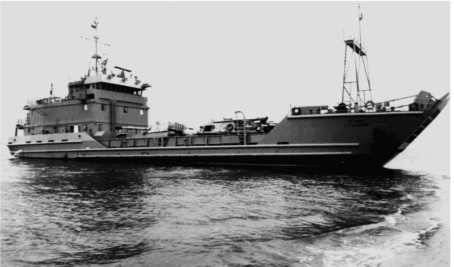
Figure I.9: Landing Craft, Utility-2000