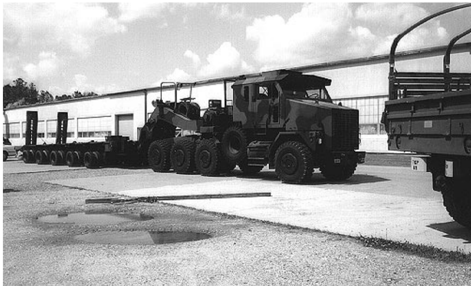
Figure I.4: Heavy Equipment Transporter System

Figures I.4 through I.6 show the Heavy Equipment Transporter System, the Palletized Load System, and the 34-ton line hauler, respectively.