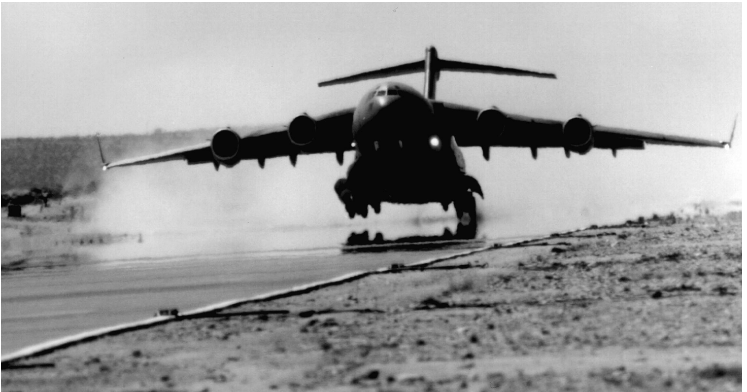
Figure I.2: C-17 Globemaster