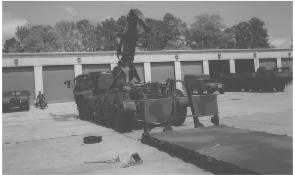
Figure I.5: Palletized Load System