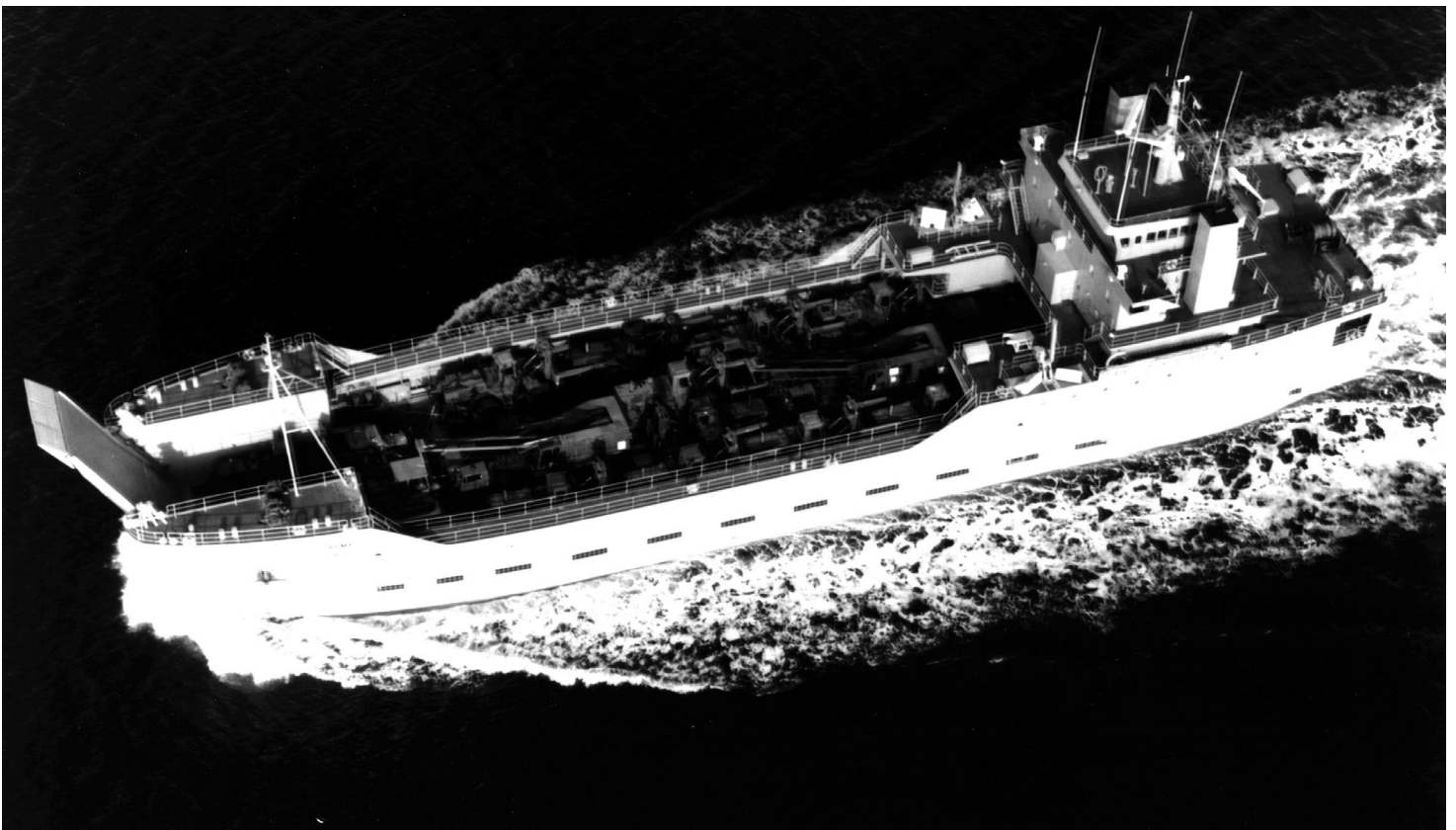
Figure I.7: Logistics Support Vessel

The Logistics Support Vessel has the capacity to carry 2,000 tons and accommodate 24 M1 main battle tanks or 25 20-foot containers (50 if they are double-stacked). Each Landing Craft, Utility-2000 has the capacity to carry 350 tons and accommodate 5 M1 main battle tanks or 12 20-foot containers (24 if double-stacked). Figures I.7 through I.9 show the Logistics Support Vessel and the Landing Craft, Utility-2000.