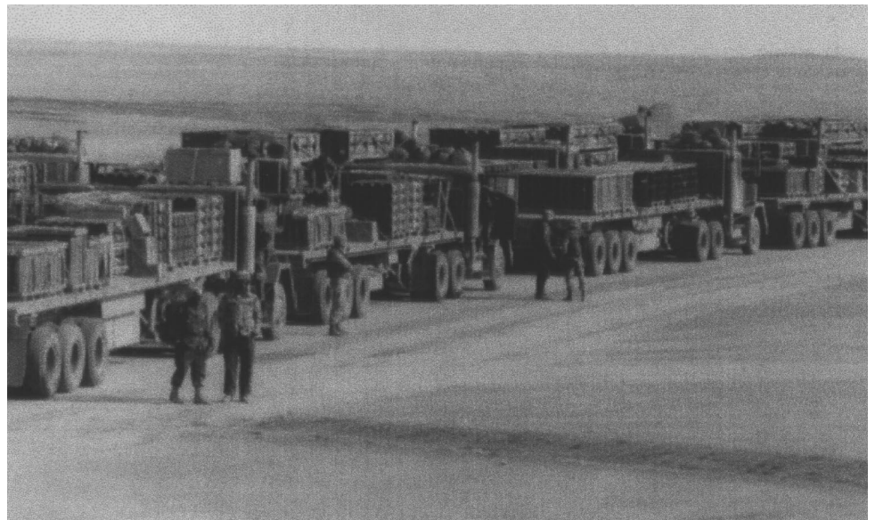
Figure I.6: 34-Ton Line Hauler