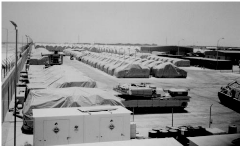
Figure 2.2: Bags and Tunnels Used for Temporary Storage of U.S. Army Prepositioned Equipment in Qatar