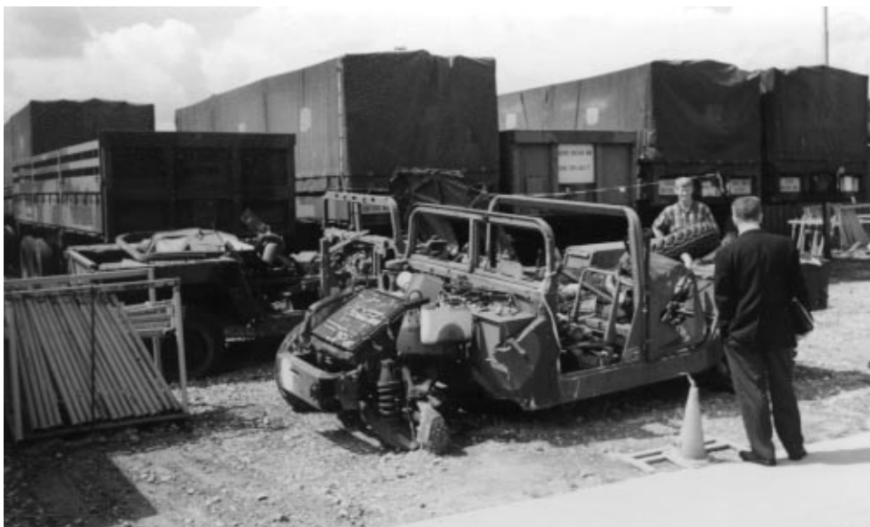
Figure 2.3: A High-Mobility, Multipurpose Wheeled Vehicle Left in Poor Condition at a Prepositioning Site in Europe

redistributing it to the brigade sets on ships and in Kuwait, Korea, and Qatar.