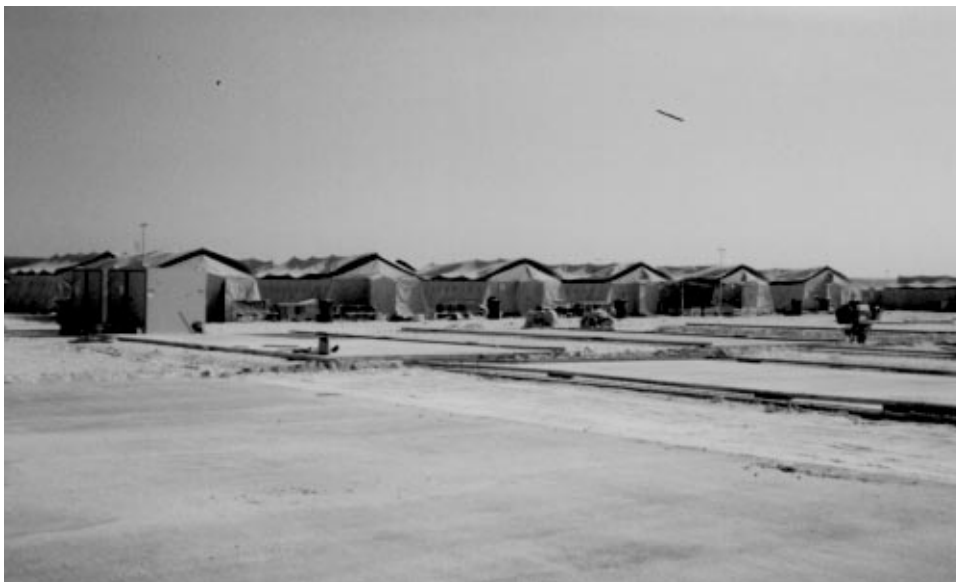
Figure 1.1: Air Force Bare Base Set in Use in Bahrain