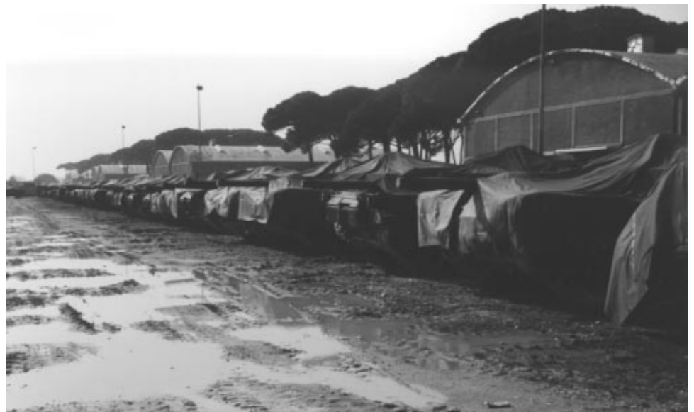
Figure 2.4: U.S. Army Abrams Tanks Stored Outside in Livorno, Italy

addition, officials from the Combat Equipment Group-Europe told us that virtually all the prepositioning sites in Europe have deferred periodic maintenance on at least some of their equipment to give priority to maintenance and repair of equipment to be redistributed.