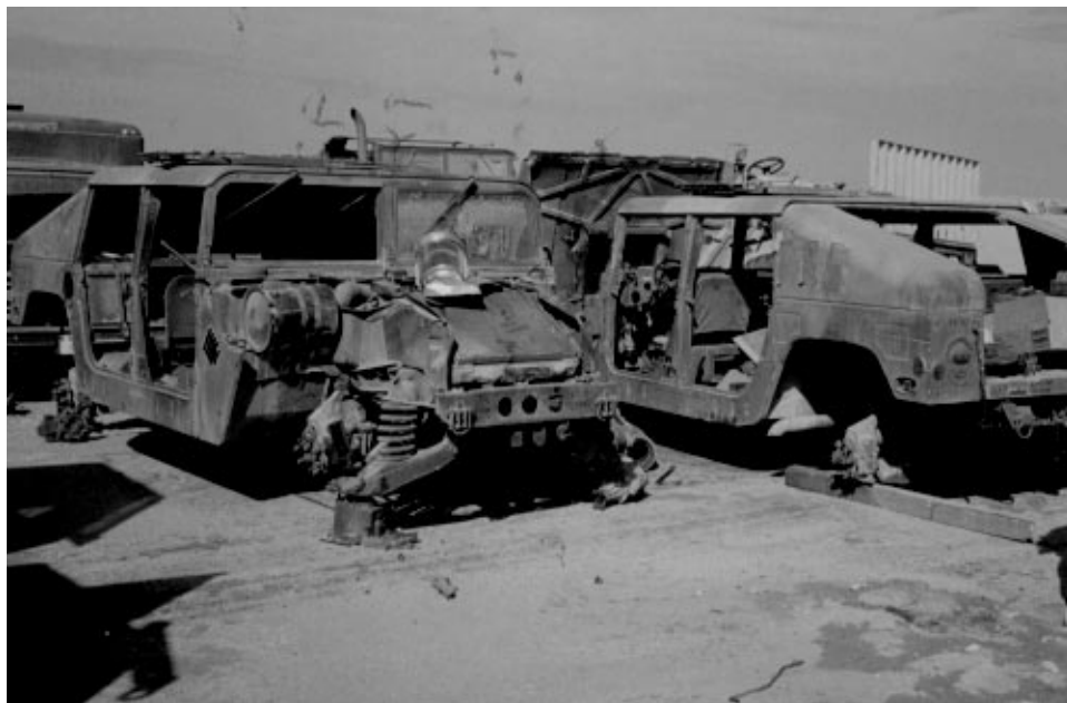
Figure 3.5: High-Mobility, Multipurpose Wheeled Vehicles Returned From Bright Star Exercise to Thumrait, Oman