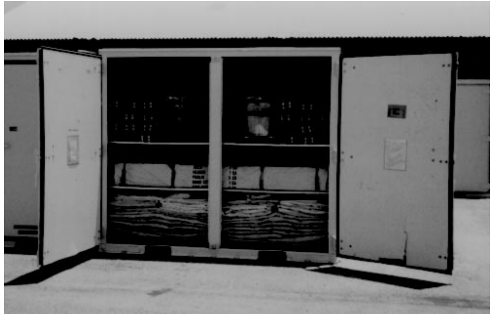
Figure 3.1: Harvest Falcon Equipment Before Shipment Compared to Similar Containers of Equipment Returned From Deployment