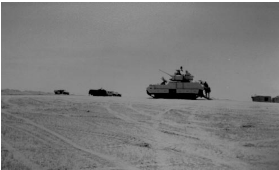
Figure 2.1: Unit Training With Army Brigade Set Equipment in Northern Kuwait

issued to them in February 1998 and that they had maintained 95 percent or more of the equipment in operational condition during each month of their deployment. They also said that the deployment had offered excellent, realistic training opportunities unavailable at their home bases. Figure 2.1 shows soldiers using brigade set equipment for training in Kuwait in May 1998.