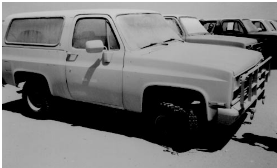
Figure 3.4: Air Force Truck With Exploded Tire, in Storage at Thumrait, Oman