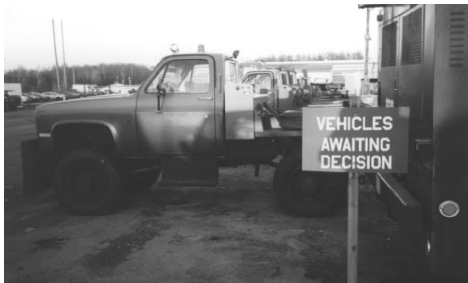
Figure 3.2: Vehicles Awaiting Disposition Decisions at European Storage Site