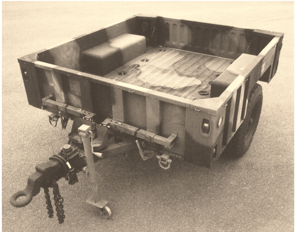
Figure 1: The High Mobility Cargo Trailer