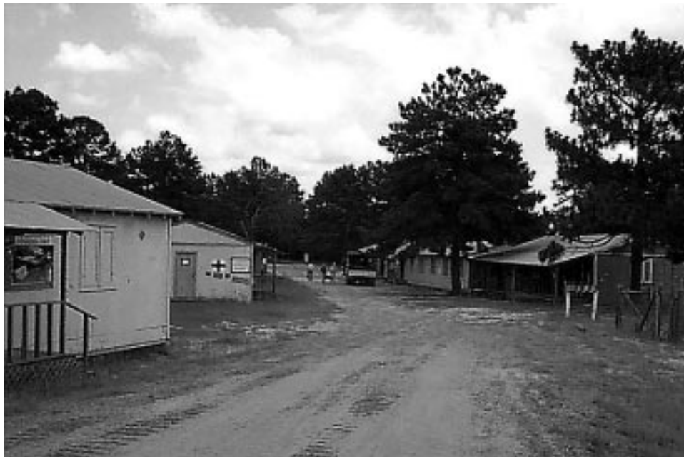
Figure 3: Mock Civilian Village at the Joint Readiness Training Center

The NTC and the CMTC sponsor exercises designed to train armor and mechanized infantry units, such as those from the 1st Armored and 3rd Infantry Divisions, in a high intensity threat environment. The JRTC provides nonmechanized or light forces, such as the 82nd Airborne and the 10th Mountain Divisions, with exercises in a low-to-medium threat environment. Both centers, however, do provide training for task forces made up of heavy and light units operating together. The CMTC and the JRTC also have constructed mock towns for training in urban warfare. Forces from the other military services as well as special operations units are also brought into the exercises at all three centers. Brigades and battalions deploy to these centers with their associated combat service and service support units.