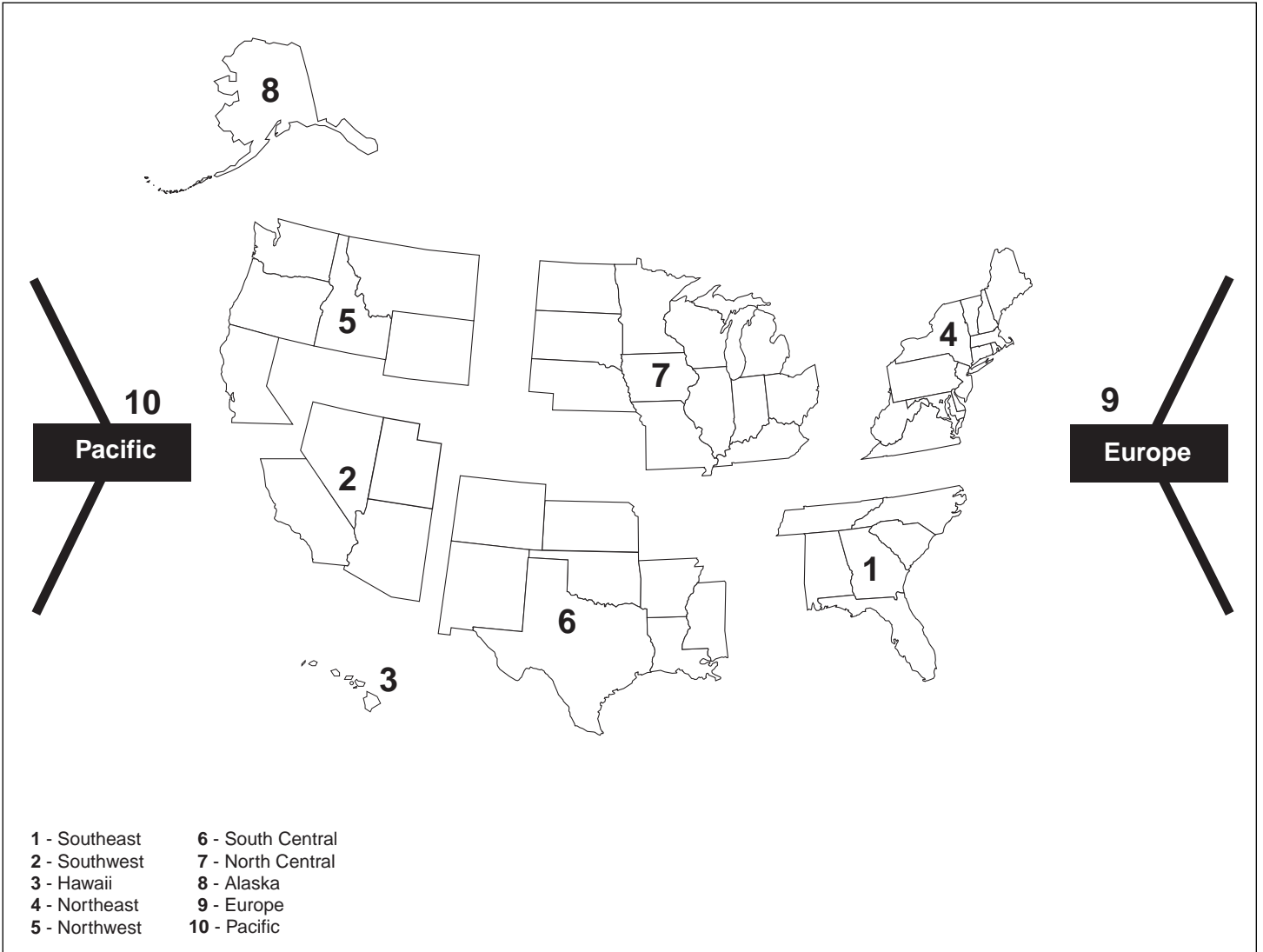
Figure 1: Ten Geographic Regions Served by DLA's Maintenance, Repair, and Operations Prime Vendor Program