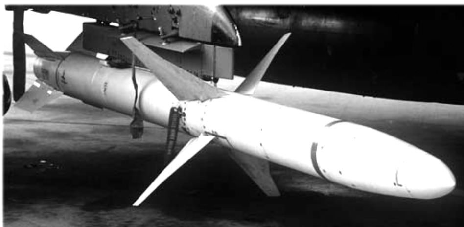
Figure 1: AGM-88 High-Speed Anti-Radiation Missile

among the first to be called in and the last to leave. Suppression aircraft such as the now retired EF-111 and F-4G played a vital role in protecting other U.S. aircraft from radar-guided missile systems during Operation Desert Storm in Iraq. In fact, Air Force strike aircraft were normally not permitted to conduct air operations unless protected by these suppression aircraft. The EF-111 was equipped with transmitters to disrupt or “jam” radar equipment used by enemy surface-to-air missile or anti-aircraft artillery systems. The F-4G used anti-radiation missiles that homed in on enemy radar systems to destroy them (see fig. 1).