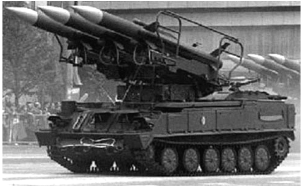
Figure 3: Mobile SA-6 Surface-to-Air Missile System