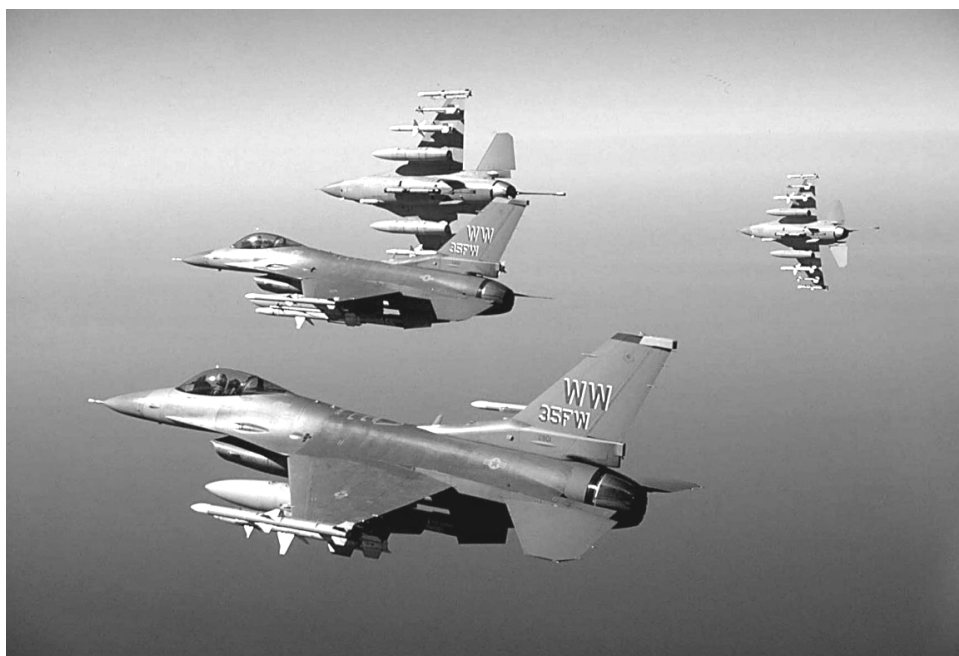
Figure 5: F-16CJ Aircraft

In 1996, we expressed concern about the decision to retire the Air Force's F-4G and EF-111 without comparable replacements. 7 Subsequently, the services realized that the decrease in their suppression capabilities had increased U.S. aircraft vulnerability and could potentially frustrate achievement of U.S. military objectives and prolong future conflicts. Therefore, since 1996, the services have taken a number of actions to improve their suppression capabilities. First, the Air Force is increasing the size of its fleet of F-16CJ suppression aircraft (see fig. 5), and the Navy and the Marine Corps are adding EA-6B suppression aircraft to help reverse the quantitative impact of the retirement of the EF-111s and F-4Gs.