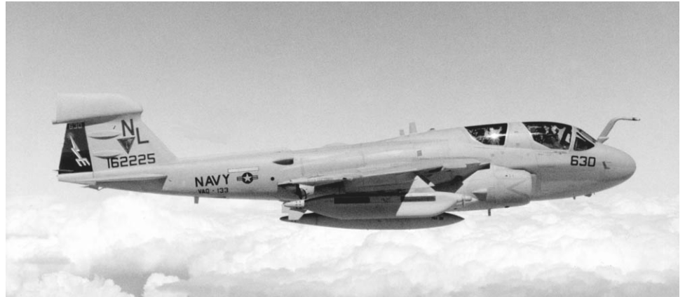
Figure 2: EA-6B Prowler