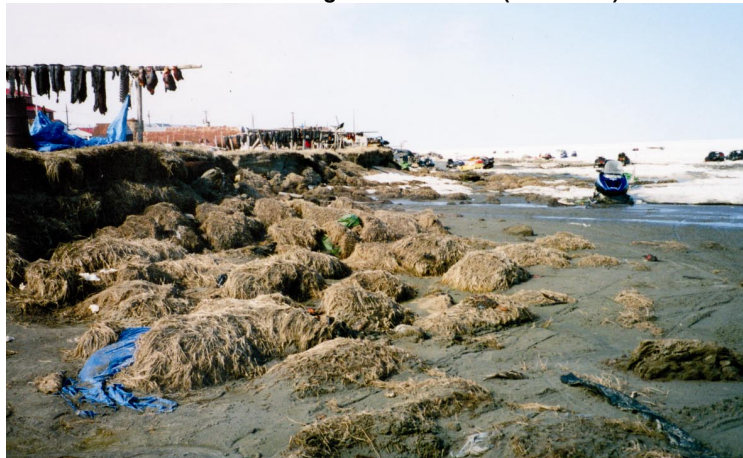
Bluff Erosion at the Native Village of Shishmaref (June 2003)

Although the Denali Commission and two federal agencies raised questions about expanding the role of the Denali Commission in commenting on GAO's report, GAO still believes it continues to be a possible alternative for helping to mitigate the barriers that villages face in obtaining federal services.