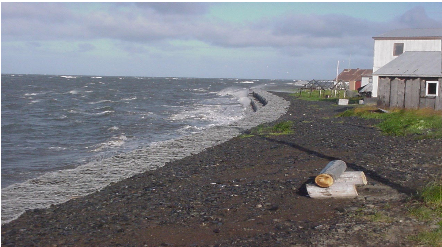
Figure 4: NRCS Seawall Erosion Protection Project at Unalakleet (c. 2000)