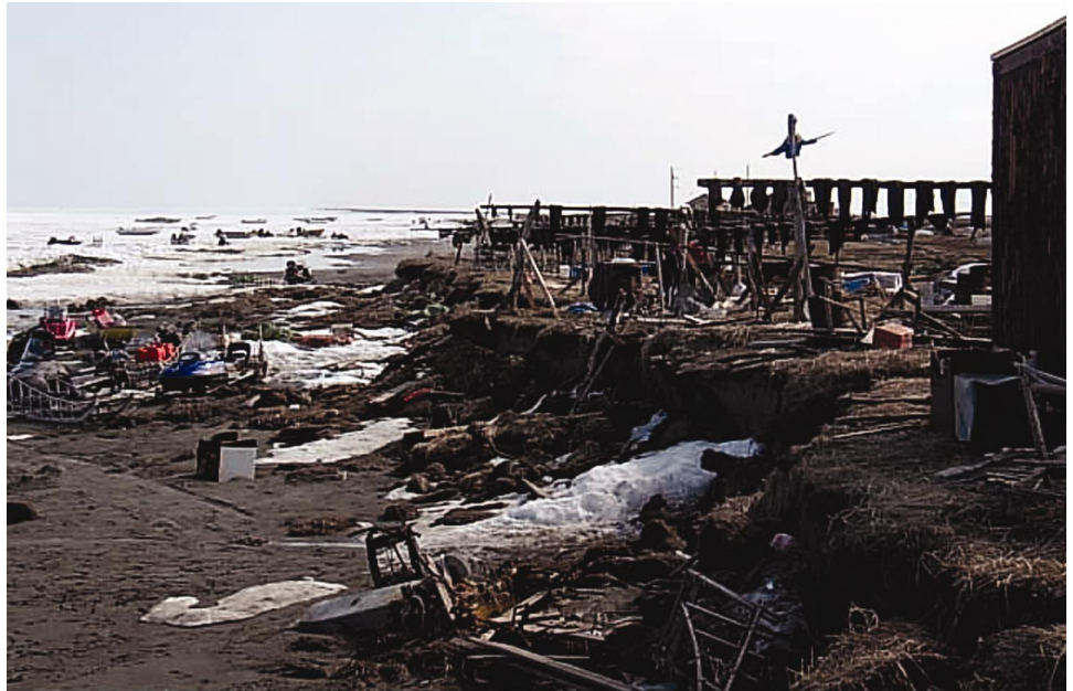
Figure 2: Sea Erosion at Shishmaref (June 2003)