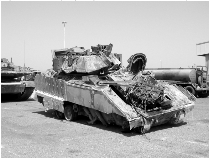
Figure 2: Bradley Fighting Vehicle—Example of Projected Equipment Item Damage