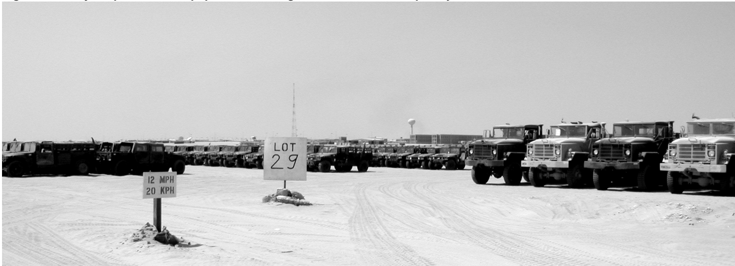
Figure 1: Army Prepositioned Equipment Awaiting Maintenance at Camp Arifjan