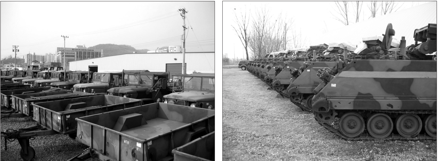
Figure 2: Sustainment Stocks Stored Outside at Camp Carroll, South Korea