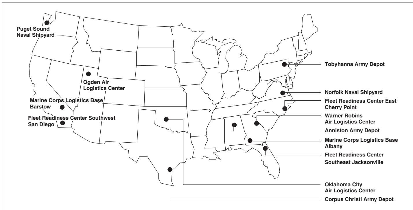
Figure 1: Locations of the 13 BRAC-Affected Military Depot Maintenance Sites

has two primary components. One is to reconfigure DLA's wholesale SS&D network into a streamlined hub and spoke network across the United States while the other is to consolidate the SS&D functions and related inventories at 13 specified military depot maintenance locations where the military services have SS&D functions and associated inventories co-located with a DLA distribution center. DLA, as the business manager for the recommendation, is responsible for implementing the overall recommendation. This review focuses only on the consolidation portion of the SS&D BRAC recommendation at the depot maintenance level. Figure 1 provides a map of the 13 BRAC-affected military locations where depot maintenance is performed.