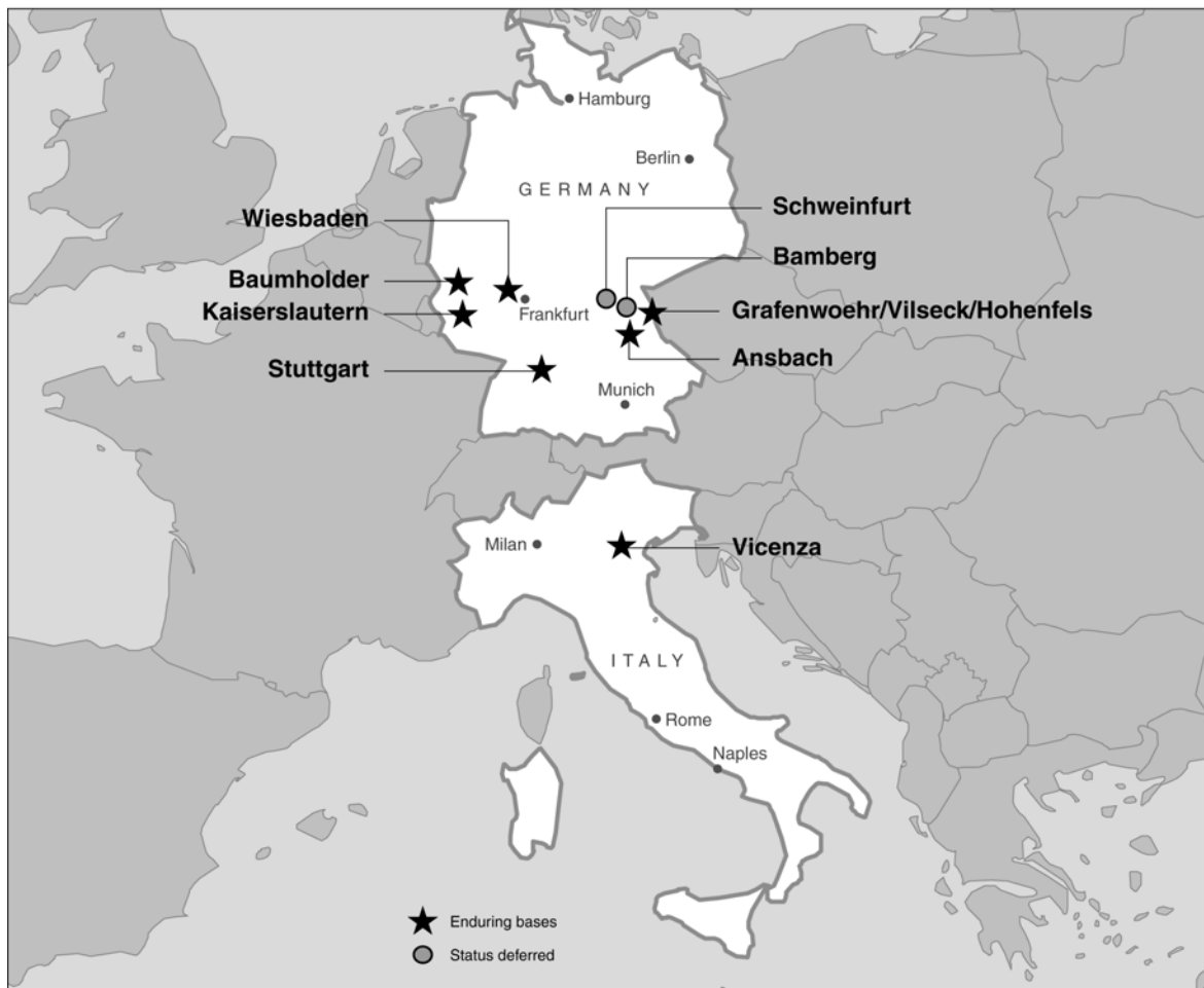
Figure 1: Major Installations Supporting U.S. Army Forces in Europe