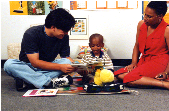
Figure 1: Recruitment Efforts to Attract Young People to the Field of Teaching.