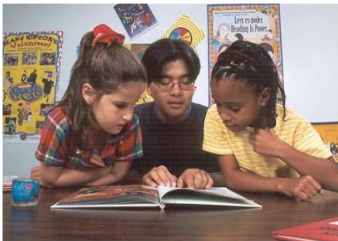
Early exposure to teaching is a recruitment strategy used by several grantees.

Education has approved or awarded 123 grants to states and partnerships totaling over $460 million dollars. Grantees have used funds for activities they believe will improve teaching in their locality or state, but it is too early to determine the grants’ effects on the quality of teaching in the classroom. While the law allows many activities to be funded under broad program goals outlined in the legislation, most grantees have focused their efforts on reforming requirements for teachers, providing professional development to current teachers, and recruiting new teachers. However, within these general areas, grantees’ efforts vary.