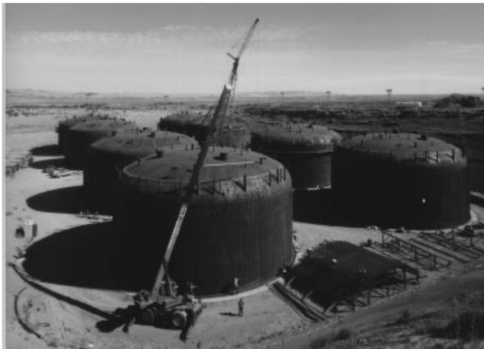
Figure 1: Typical Hanford Tank Farm Under Construction

DOE's program for addressing these wastes, called the Tank Waste Remediation System, calls for a series of actions to chemically characterize the waste in the tanks, remove it from the tanks, and prepare it for permanent disposal during the several hundred thousand years in which some of it will remain dangerously radioactive. This program is expected to cost $36 billion over its life-cycle.