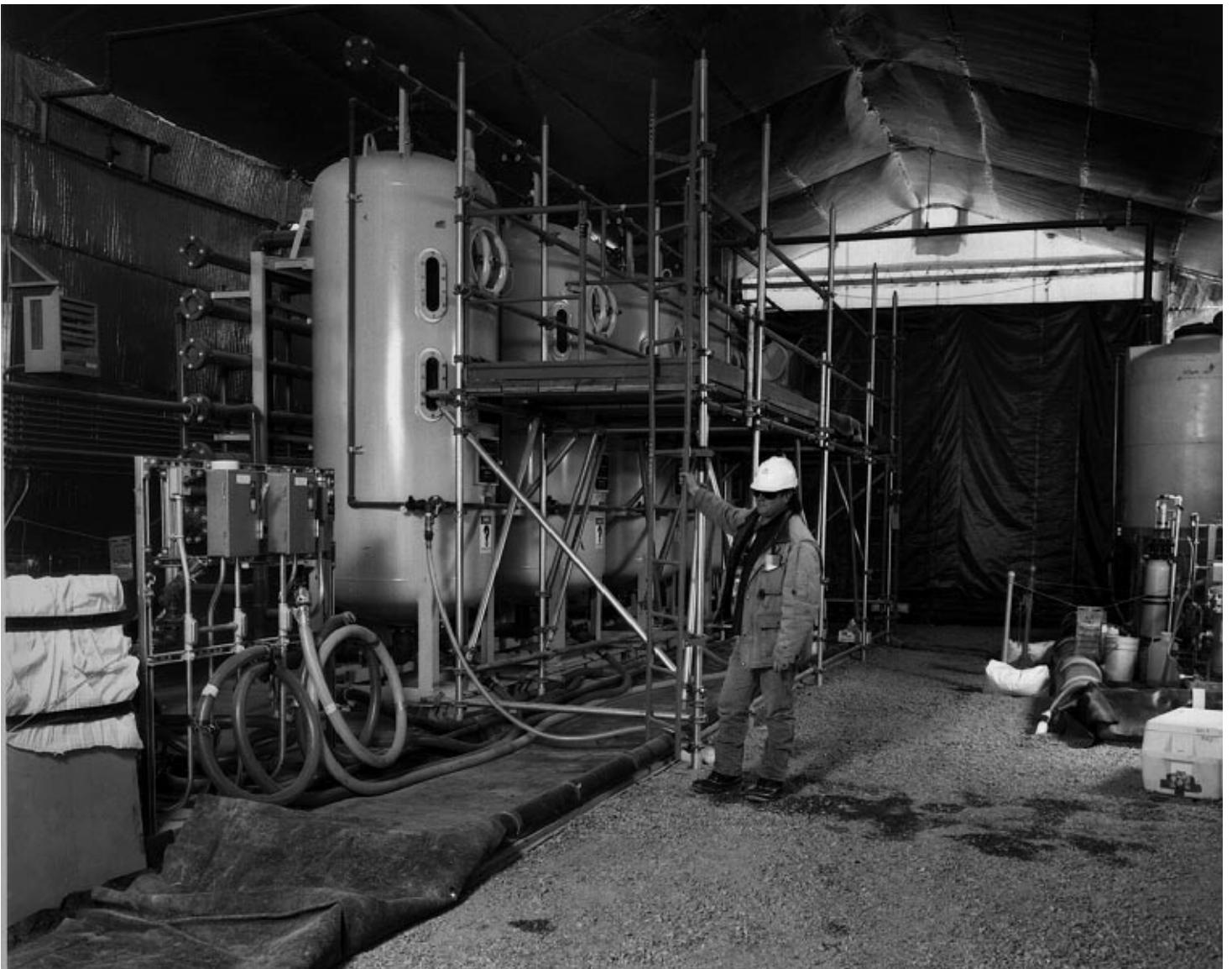
Figure 5: Treatment Facility for Removal of Strontium From Groundwater Near the Columbia River at Hanford

Surface water or groundwater may have been contaminated by radioactive or hazardous materials leaching through the soil from spills and leaks or through normal operations. (See fig. 5.)