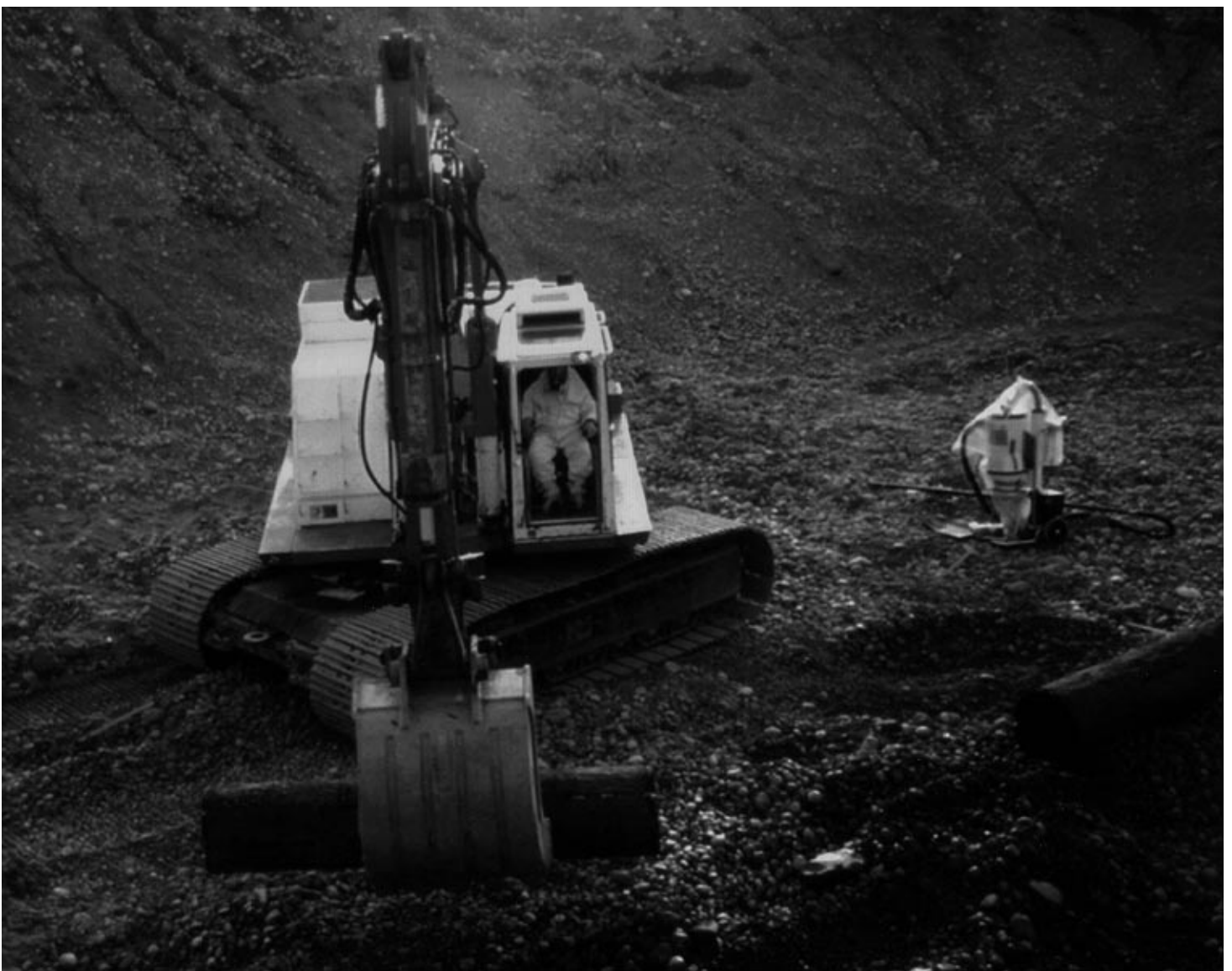
Figure 4: Cleanup of a Hanford Liquid Waste Disposal Facility

Soil may have been contaminated by leaks or spills or by using liquid waste disposal facilities, such as trenches and waste ponds, to disperse contaminated liquids. (See fig. 4.)