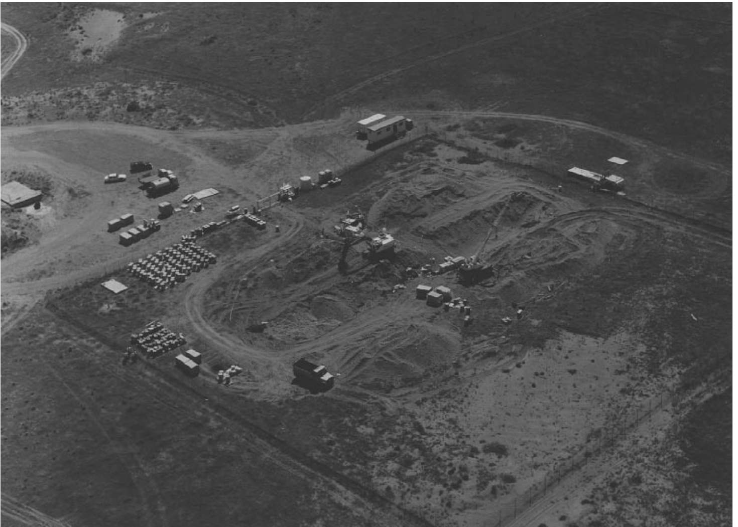
Figure 3: Excavation at a Hanford Burial Ground

Burial grounds may contain radioactive and/or hazardous solid and/or liquid waste. Buried in them are such things as barrels of chemicals and other material and equipment from DOE facilities. (See fig. 3.)