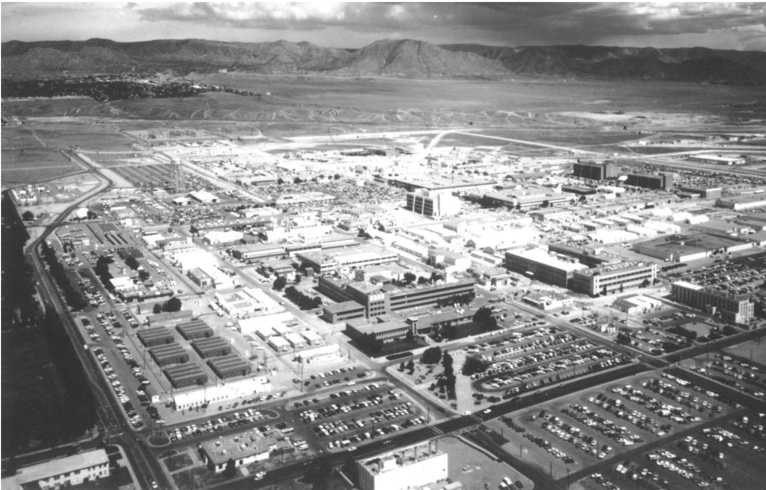
Figure 1.3: Sandia National Laboratories