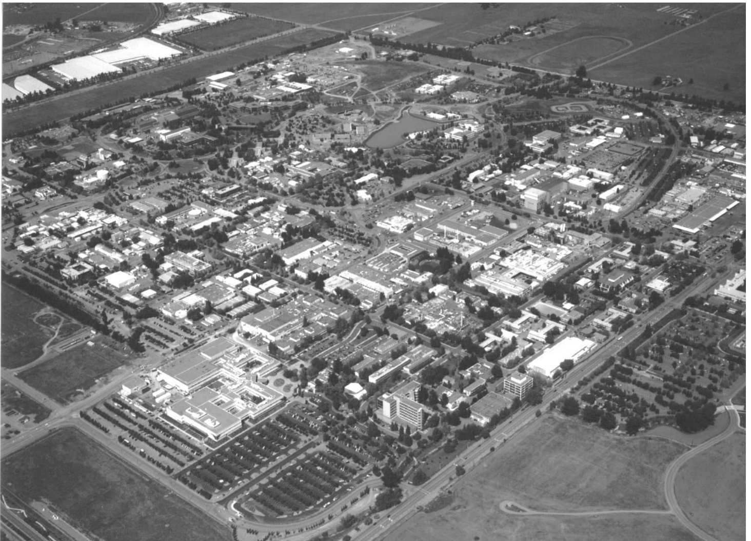
Figure 1.1: Lawrence Livermore National Laboratory