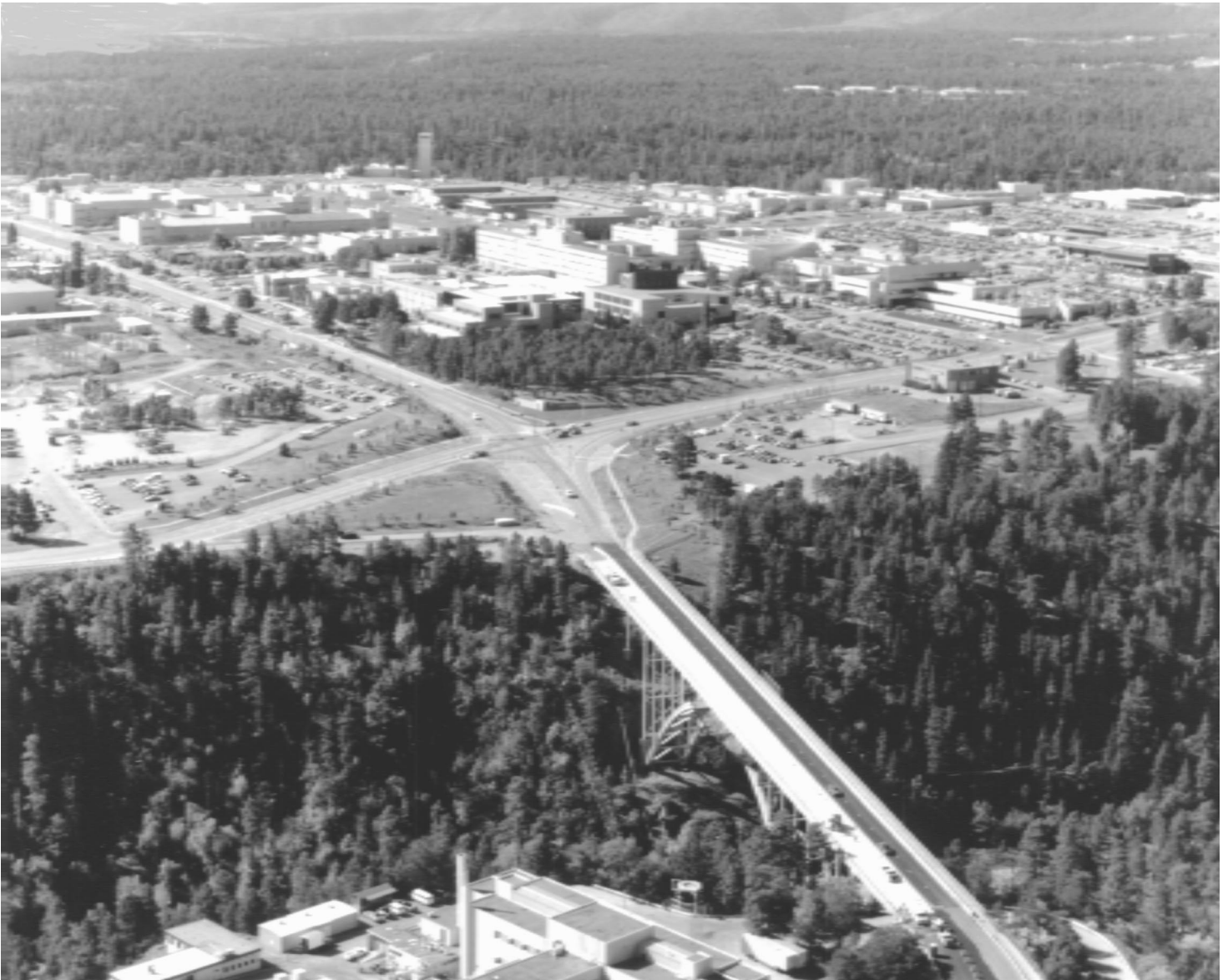
Figure 1.2: Los Alamos National Laboratory