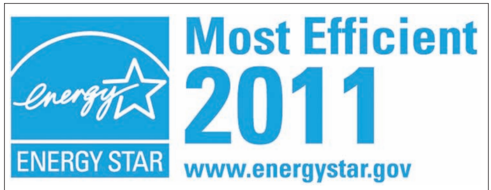
Figure 2: EPA's Energy Star Most Efficient Marketing Template