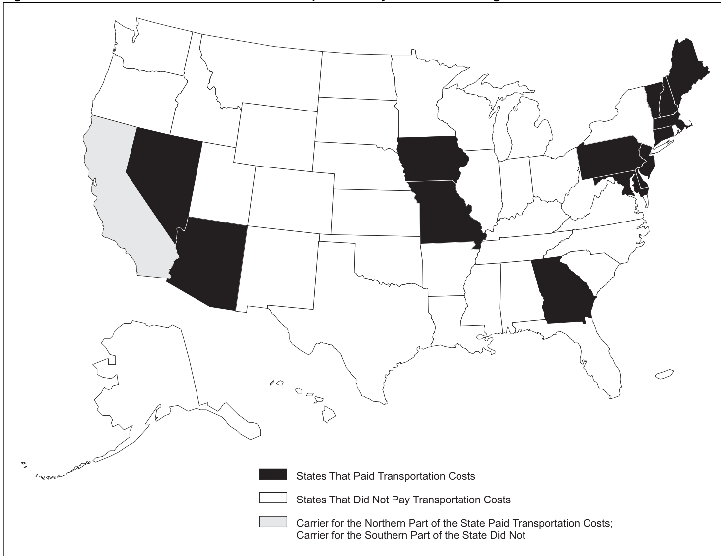
Figure 3: States Where Providers Could Receive Transportation Payments for Providing Ultrasound Services

Because carriers responsible for fewer than one-third of the states allowed separate transportation payments, most ultrasound services performed in nursing homes were done without such payment. Only 3,220 (15 percent) of the 23,600 ultrasound services done in nursing homes in 1995 had claims for separate transportation payments. The remainder,