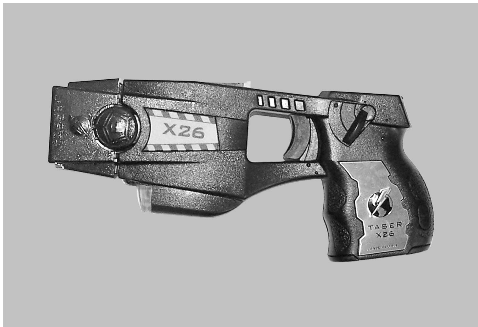
Figure 2: Taser (X-26 Model)