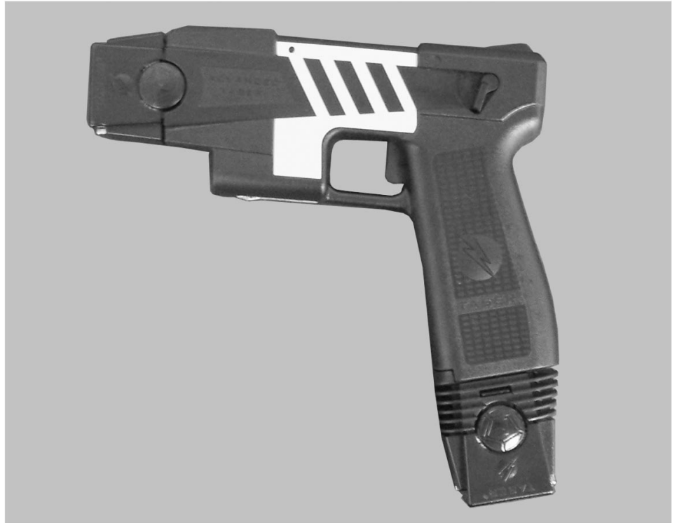
Figure 1: Taser (M-26 Model)