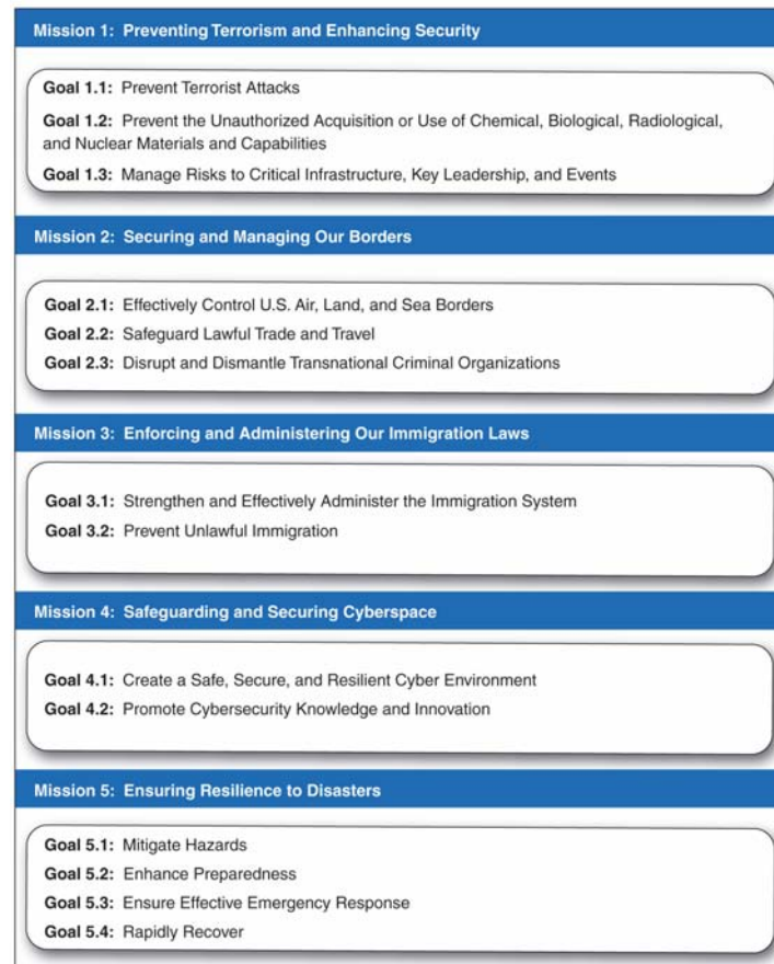
Figure 1: QHSR Missions and Goals

We found that this item was addressed in part because the 2010 Quadrennial Homeland Security Review (QHSR) report included the national homeland security strategy and a list of five homeland security missions, but did not prioritize these missions. According to DHS officials, the five missions listed in the QHSR report have equal priority—no one mission is given greater priority than another. 1 Still, according to Department of Homeland Security (DHS) officials, in selecting the five missions from the many potential homeland security mission areas upon which DHS could focus its efforts, the QHSR report indicates that the five mission areas are DHS’s highest priority homeland security concerns. The QHSR’s five mission areas are listed in figure 1.