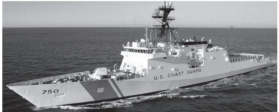
Figure 1: The Coast Guard's First National Security Cutter, The Bertholf