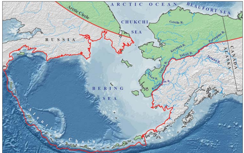
Figure 2: Map of the Arctic Boundary as Defined by the Arctic Research and Policy Act