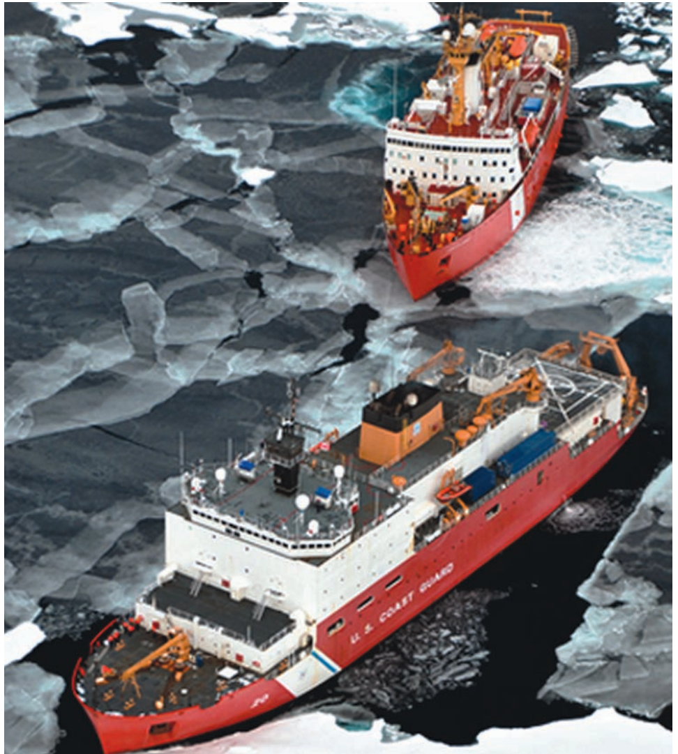
Figure 3: U.S. Coast Guard's Healy and the Canadian Coast Guard's Louis S. St. Laurent on a Joint Mission in the Arctic