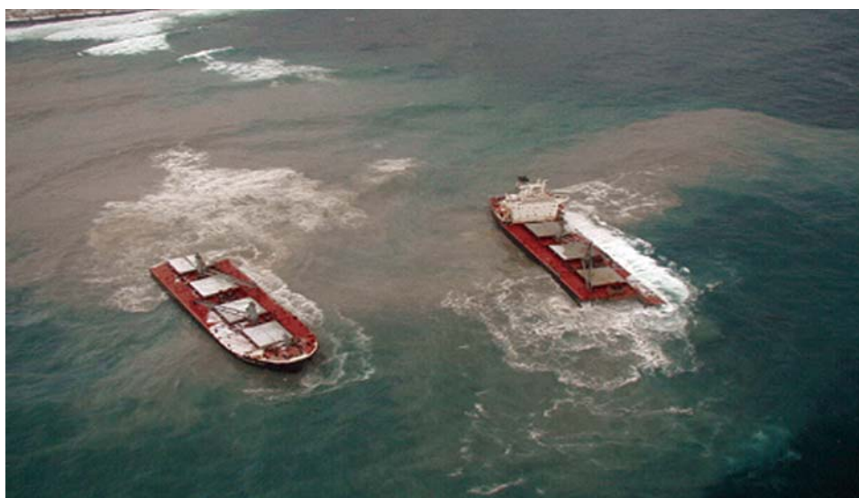
Figure 6: The Grounding of the Vessel Selendang Ayu in the Aleutian Chain