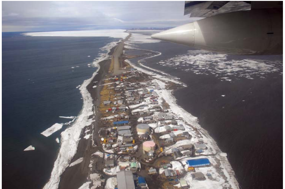
Figure 4: A Coast Guard HC-130 Aircraft on an Arctic Domain Awareness Flight in May 2009 above Kivalina, Alaska