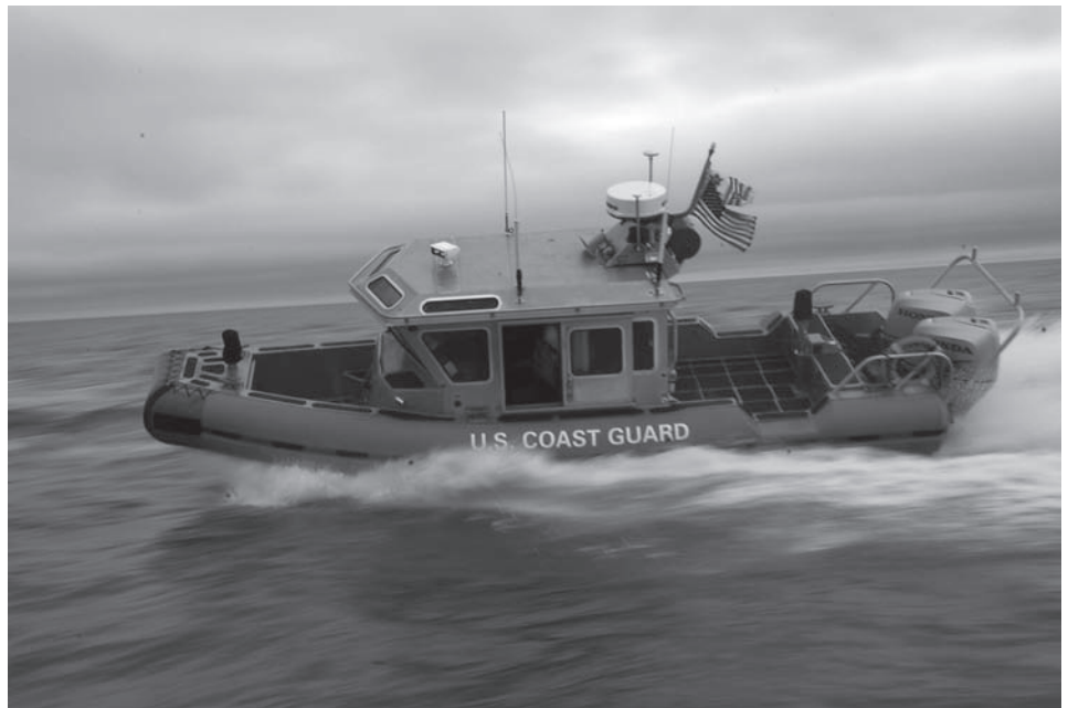
Figure 5: A Response Boat in Arctic Waters Off of Barrow, Alaska