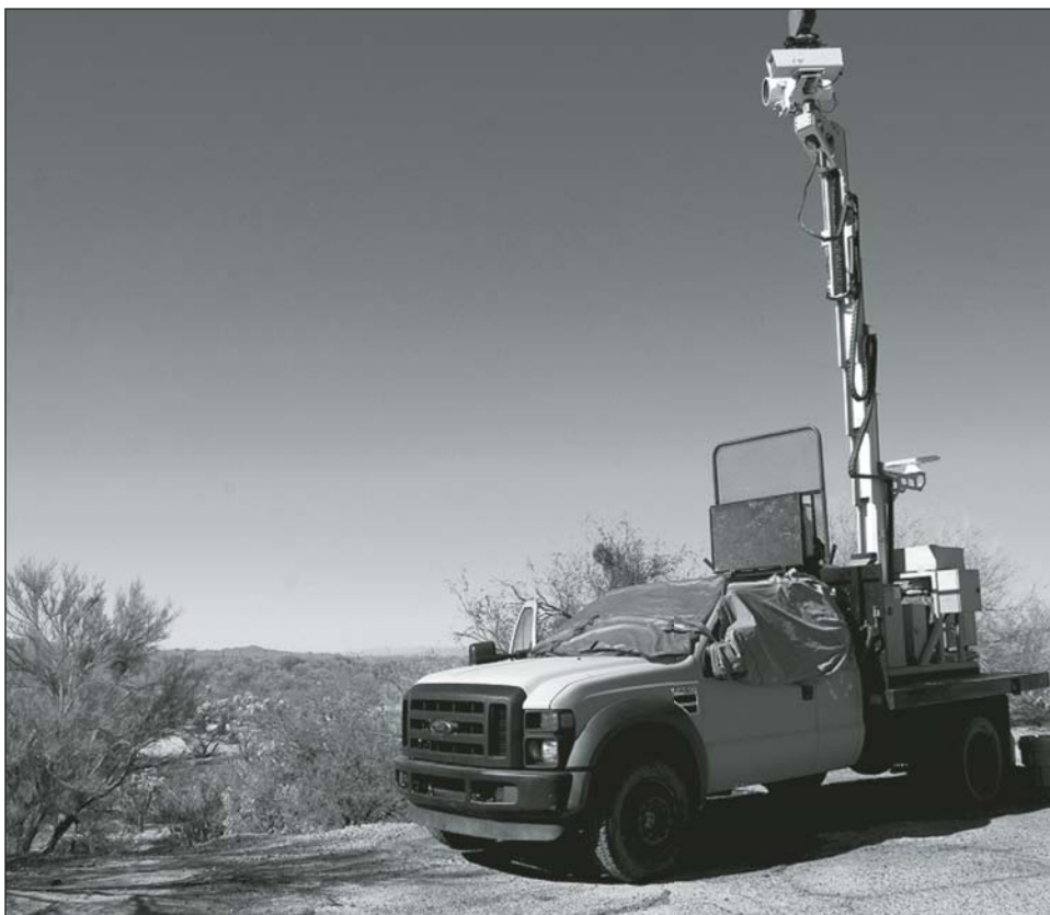
Figure 1: Mobile Surveillance System (MSS)