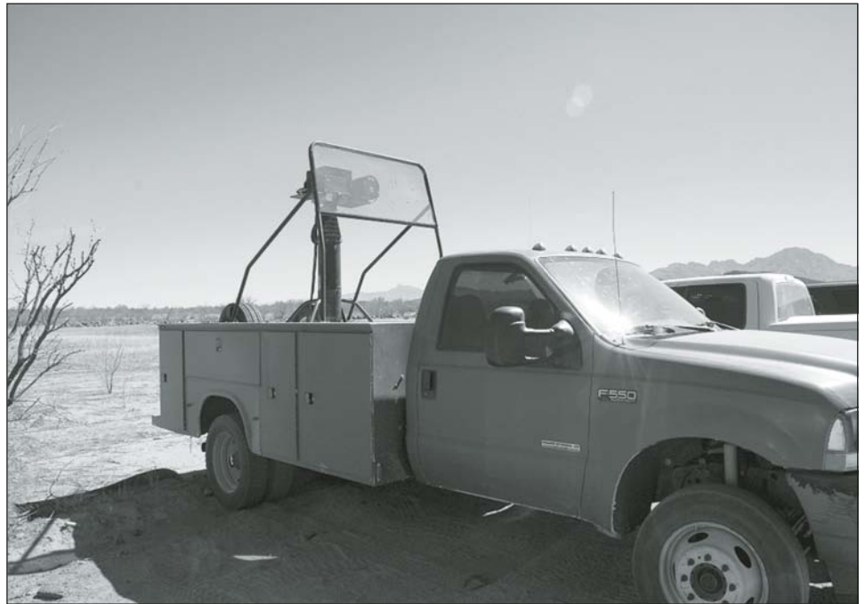
Figure 2: Mobile Video Surveillance System (MVSS)