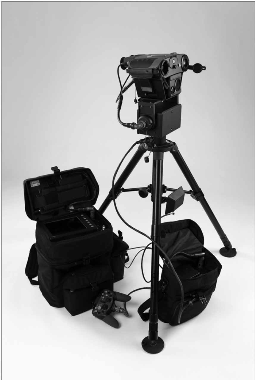
Figure 5: Long Range Handheld Thermal Imaging System (RECON III)