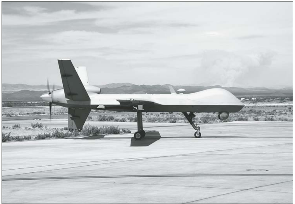
Figure 4: Air Support (Unmanned Aerial System)