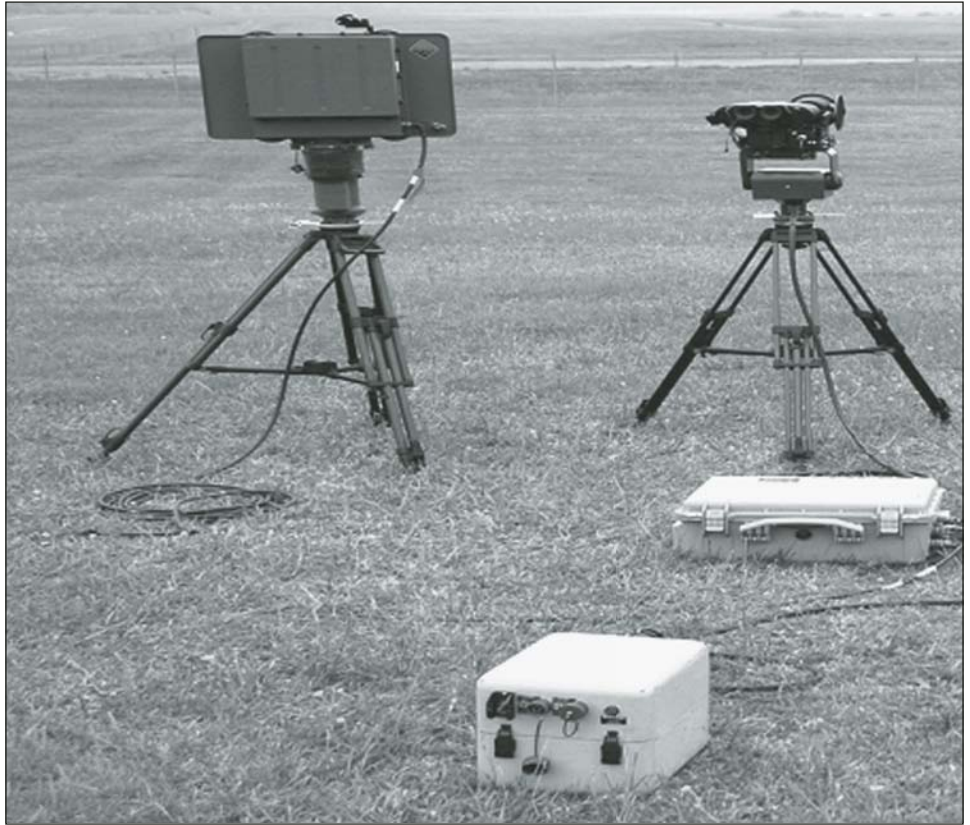
Figure 6: Agent Portable Surveillance System (APSS)