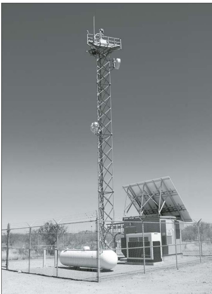
Figure 3: Integrated Fixed Tower Concept (SBI net Tower)