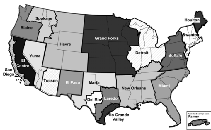
Figure 1: U.S. Border Patrol Sectors

The Border Patrol has 20 sectors as shown below in Figure 1.