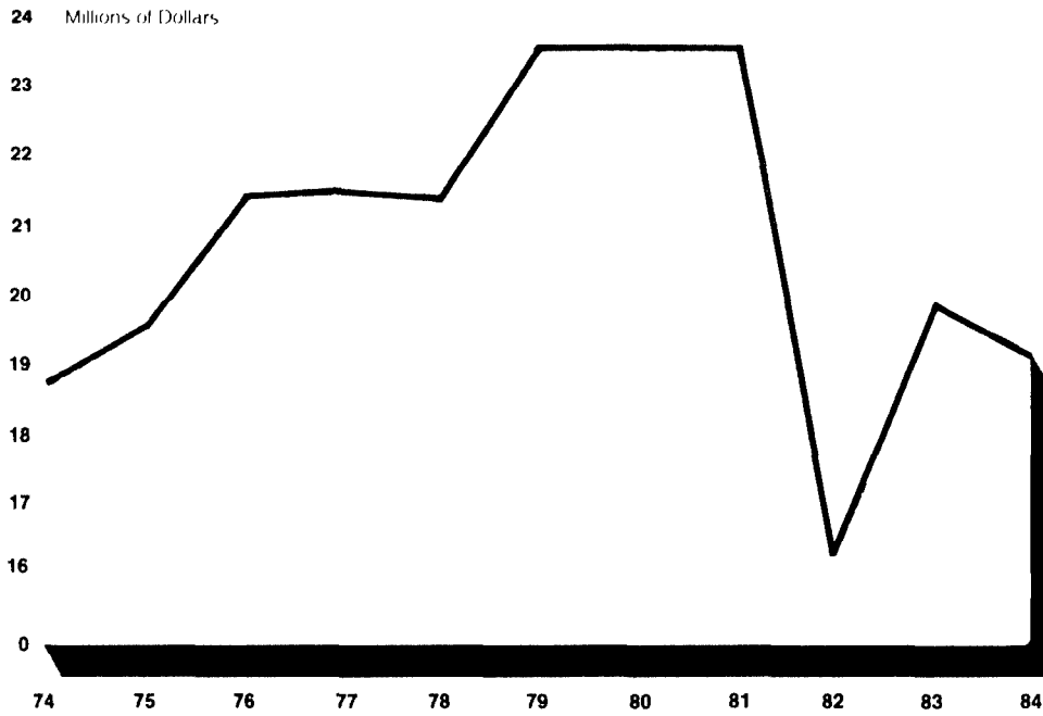
Figure I.2: Amount of Revenue for East St. Louis a (1974-84)

a Does not include amounts given directly to residents, such as welfare assistance, food stamps, etc.