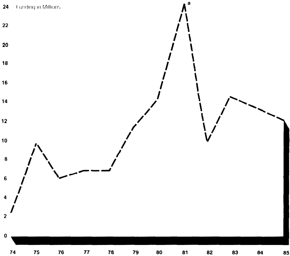
Figure I.1: Total HUD Funding for East St. Louis (1974-85)

a The total amount shown for fiscal year 1981 includes cumulative amounts for some programs that were not accumulated on a year-to-year basis prior to 1981. This, in part, accounts for the significant increase in funding shown for fiscal year 1981.