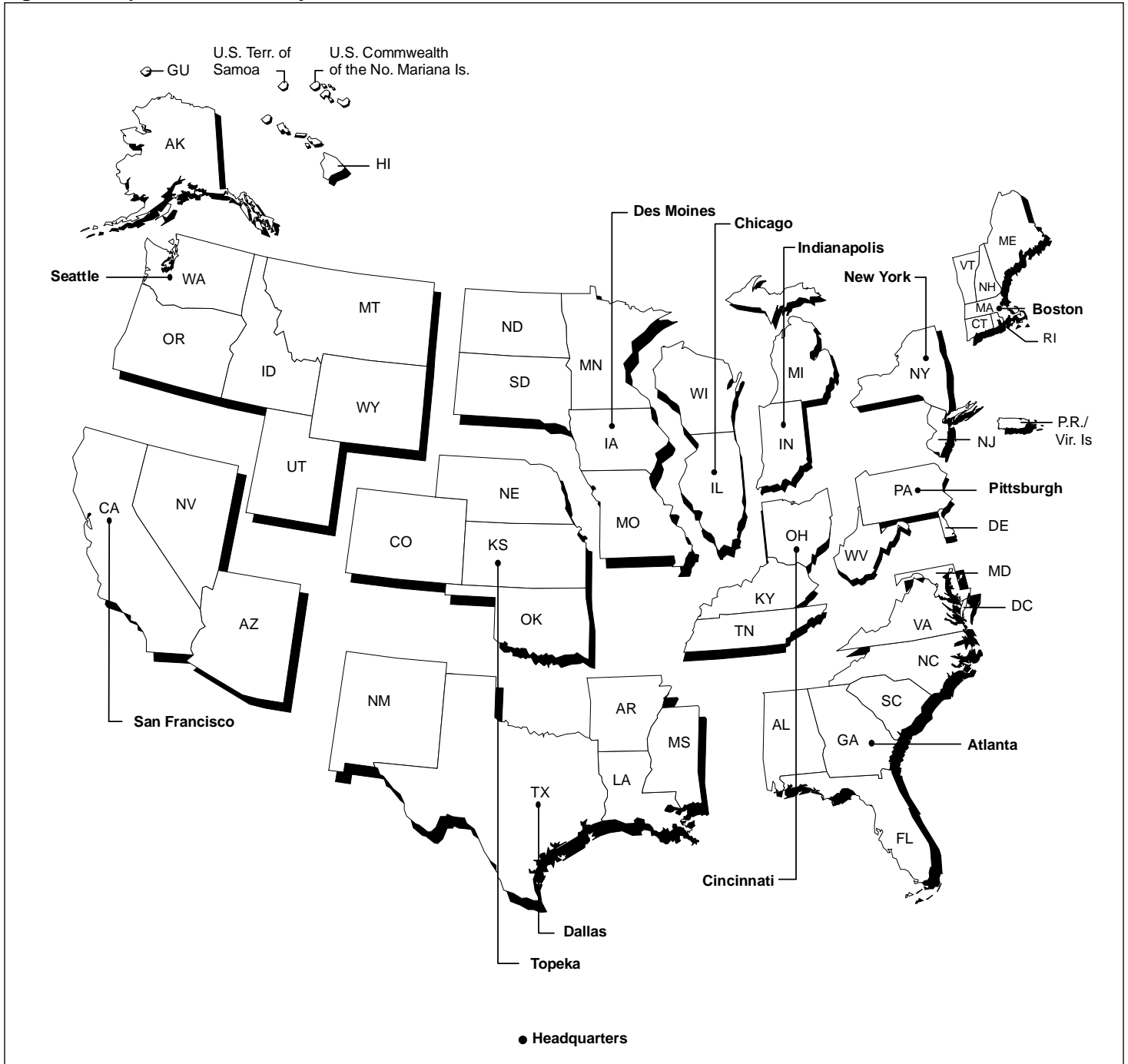
Figure 1.2: Map of the FHLBank System