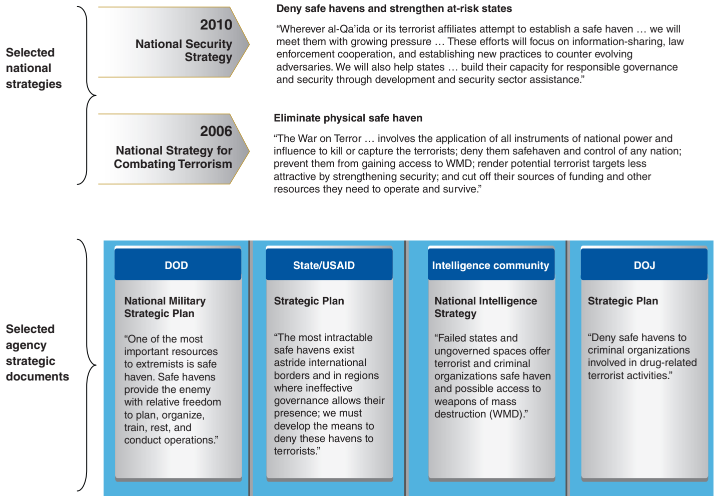
Figure 1: Selected U.S. Government Strategic Documents Emphasizing the Importance of Denying Safe Haven to Terrorists