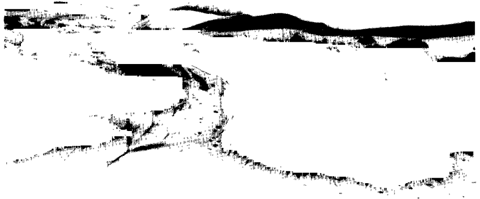
Figure 1.2: View of the Oregon Dunes National Recreation Area