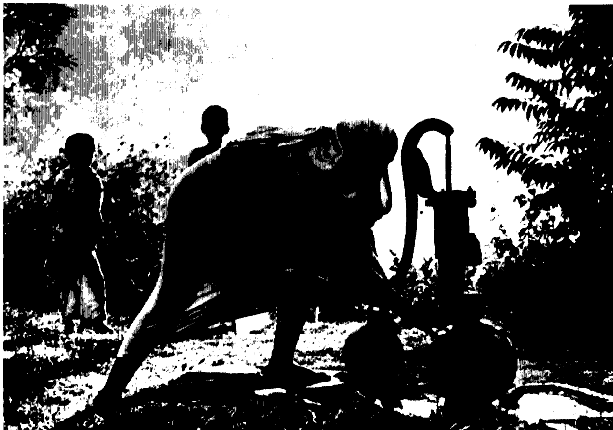
A MOTHER IN BANGLADESH PUMPS WATER FROM A NEWLY INSTALLED TUBEWELL.

Other international agencies are involved in water resources activities in developing countries, including private and voluntary organizations (PVOs). For example, the Cooperative for American Relief Everywhere, Inc. (CARE), used about $10 million in 1977 for water supply and sanitation, according to a CARE official. Other active PVOs include the Catholic Relief Services, Church