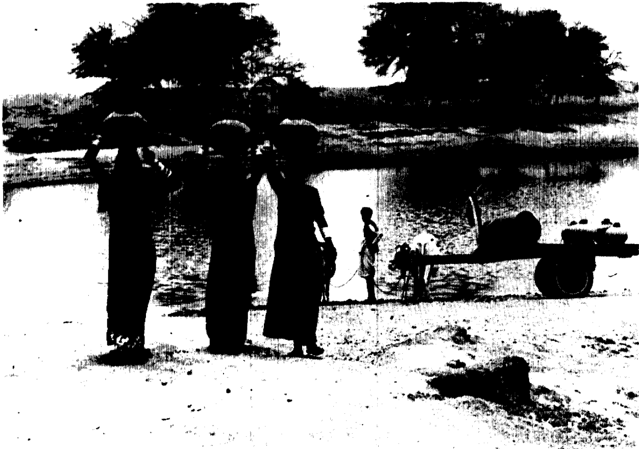
A heavy daily burden for these women of India--and the water is not safe.

The U.N. Conference on Human Settlements held in Canada in June 1976 recommended that quantitative targets be set by nations to ensure that their people have access to safe water supplies and hygienic waste disposal by 1990. The U.N. Water Conference held in Argentina in March 1977 pursued this theme further by recommending that member nations reaffirm their commitment to adopt programs having realistic standards for quality and quantity of drinking water for urban and rural areas by 1990 and that they should prepare plans for 1980 to provide such coverage and to expand and maintain existing systems. The Conference asked member nations to