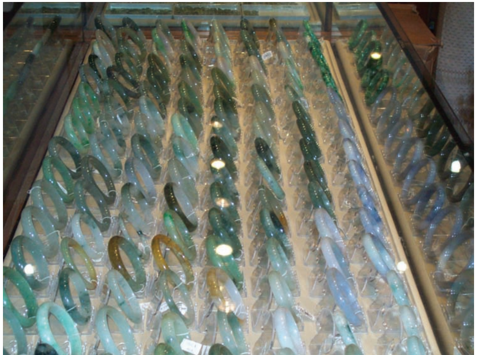
Figure 4: Jadeite Bracelets