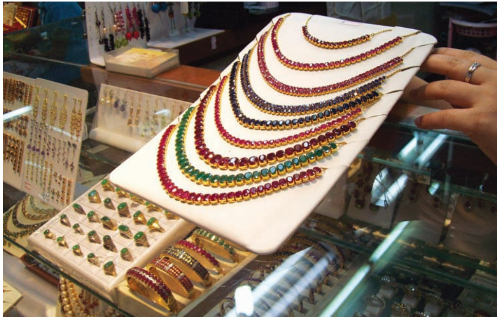
Figure 1: Colored Gemstone Jewelry, Including Ruby and Jadeite Jewelry, for Sale in Rangoon, Burma