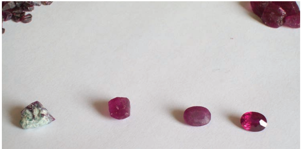
Figure 6: Transformation of Rough Burmese-Origin Ruby into Finished Thai Ruby

undergo substantial transformation (fig. 6), and become products of Thailand.