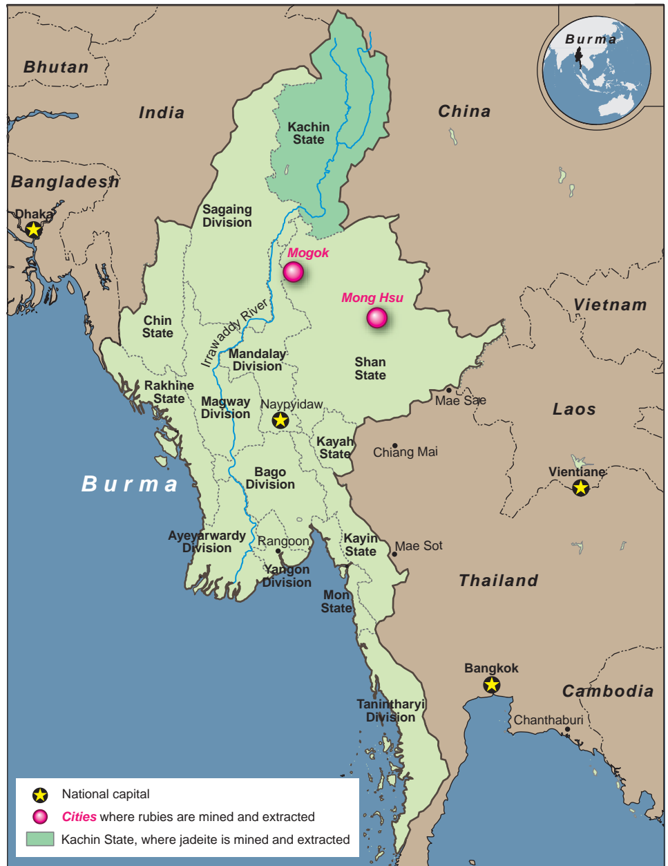
Figure 2: Major Jadeite and Ruby Mining Areas in Burma