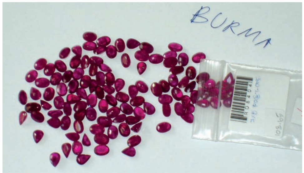
Figure 5: Processed and Finished Burmese-Origin Rubies for Sale in Thailand

Although some of the highest-quality rough rubies might be sold at the government auctions, according to foreign government and industry officials, most rough Burmese rubies processed in Thailand have been smuggled over the border and probably result in little or no revenue for the regime in Burma. Figure 5 shows some Burmese-origin rubies that have been processed and are for sale in Thailand. The very nature of smuggling prevents the Burmese regime from extracting much revenue from these stones. U.S. agency officials said that the Burmese regime probably derives much more revenue from gemstones (such as jadeite) that are almost exclusively sold at government auctions in Rangoon.