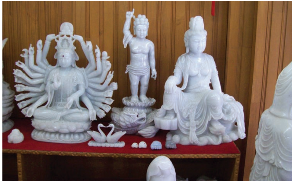
Figure 3: White Jadeite Statues, for Sale in Rangoon, Burma

According to foreign jewelry industry and government officials, the Chinese have a long history of buying and using jade for jewelry, ornaments, and decorations, including statues. Jadeite, a relatively rare and high-quality form of jade that is believed to come mostly from Burma, 6 has positive cultural significance to the Chinese. Figure 3 shows examples of statues carved out of white jadeite. Foreign jewelry industry representatives said that a widely held belief among the Chinese is that jadeite, including wearing jewelry made from jadeite, such as the pieces shown in figure 4, brings good fortune and health.