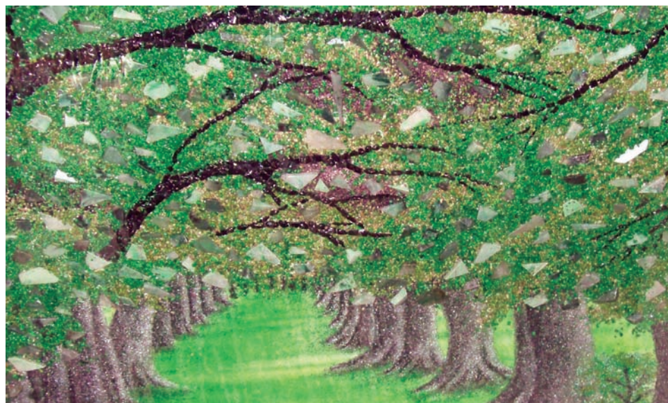
Figure 7: A “Painting” Composed Primarily of Green Jadeite and Other Colored Gemstones Glued to Canvas, for Sale in Rangoon, Burma

cent. 20 Moreover, according to these same data, a single shipment of rough rubies arrived in Charleston, South Carolina, in October 2008 that included 89 million rubies worth a total of only $35,600 (on average, each ruby was worth less than 1/10 cent). Rubies and jadeite can be used in products unimaginable in the diamond context; while conducting our audit in Rangoon, we saw numerous examples of “paintings” composed entirely of various colors of ruby, jadeite, and other colored gemstones glued to canvases (fig. 7). Such products are composed of literally thousands or tens of thousands of stones; each stone could have come from one of any number of sources.