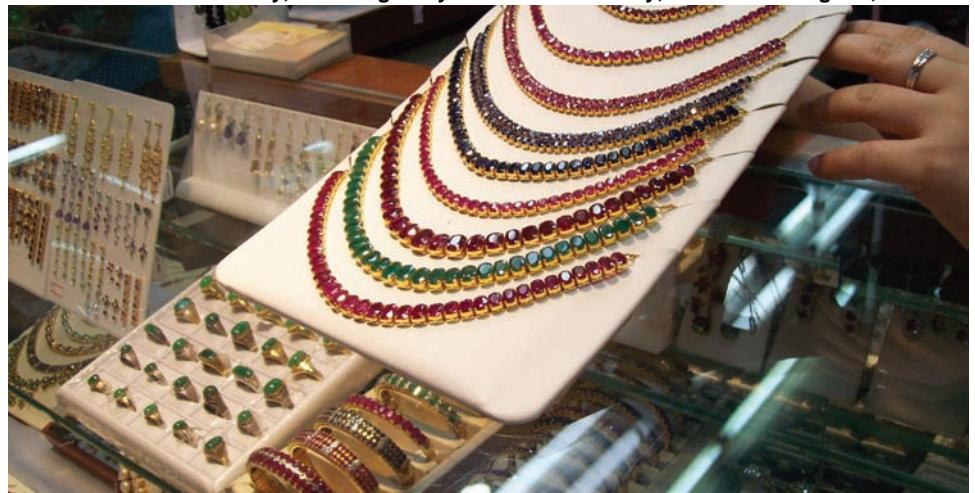
Colored Gemstone Jewelry, Including Ruby and Jadeite Jewelry, for Sale in Rangoon, Burma

Agencies sent a required 60-day report to Congress, but it had little information on progress and challenges related to gaining international support to prevent trade in Burmese-origin rubies, jadeite, and related jewelry. Agencies have made no discernible progress in gaining such international support. Strong support and the cooperation of China and Thailand are important to restrict trade in these items, but highly unlikely. The Office of the United States Trade Representative has not requested a World Trade Organization waiver and State has not introduced a United Nations resolution, noting a number of countries would likely oppose a resolution. Finally, there have been no international meetings to negotiate a global arrangement restricting trade in Burmese rubies and jadeite similar to the Kimberley Process for restricting trade in conflict diamonds. Agency officials cited serious impediments to establishing such a framework.