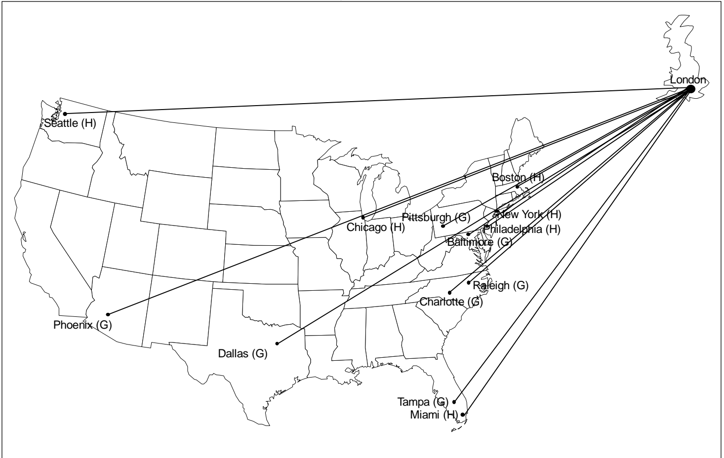
Figure 2: Markets in Which American and British Airways Either Currently Compete With Each Other and Provide Over 70 Percent of the Service or One of the Carriers Has a Monopoly on Nonstop Service, 1997

Note: "H" denotes service to Heathrow; "G" denotes Gatwick. According to American and British Airways representatives, under open skies the alliance would likely switch much of the current Gatwick service to Heathrow.