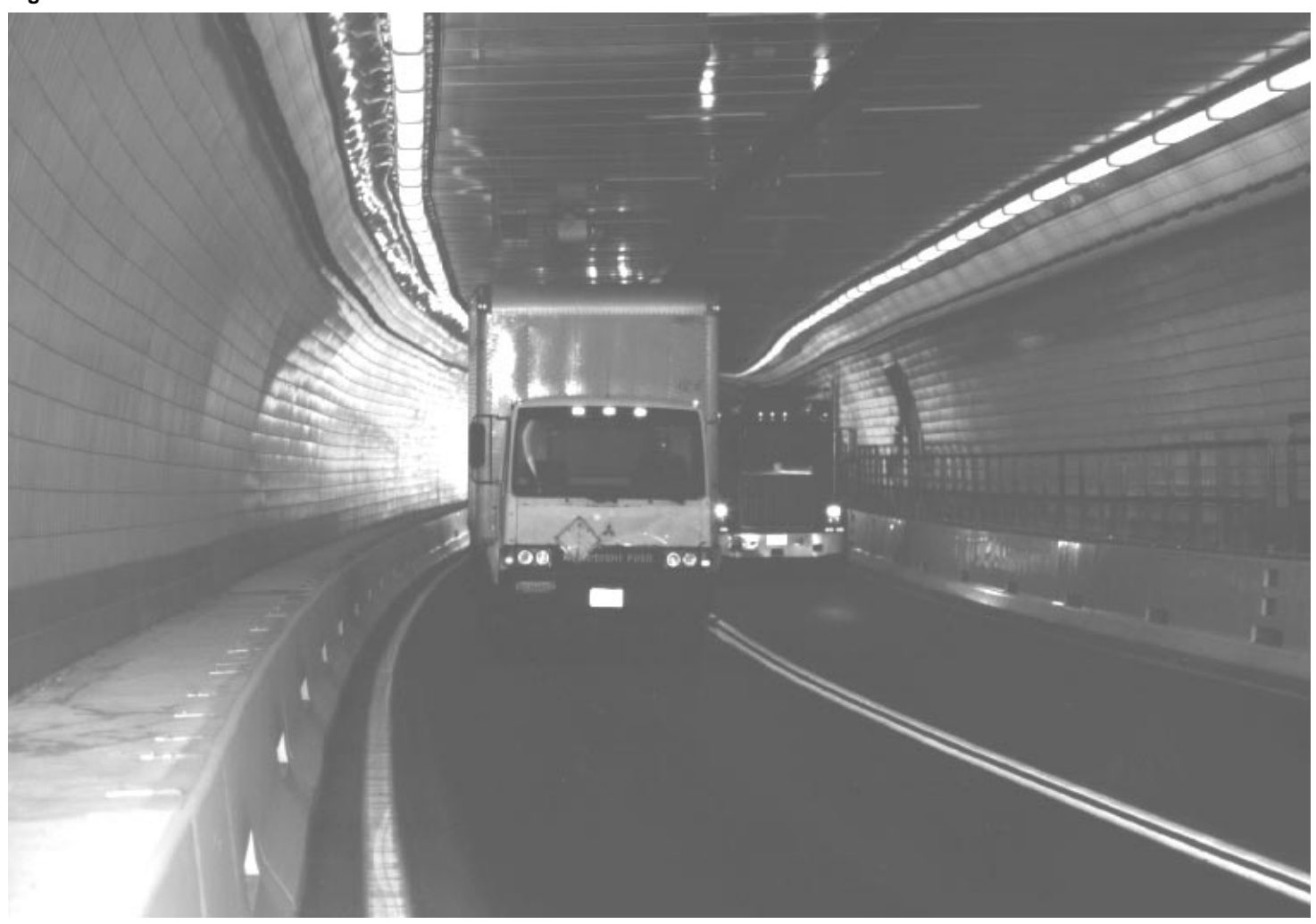
Figure 2: The Ted Williams Tunnel