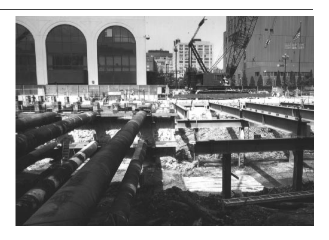
Figure 3: Construction of the Underground Central Artery